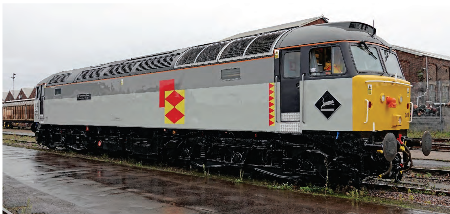
newly named 57003 Eastleigh Works, 7 th Sep 2024 (Trevor Roots)

Inter City Railway Society 50 th Anniversary 1973 - 2023