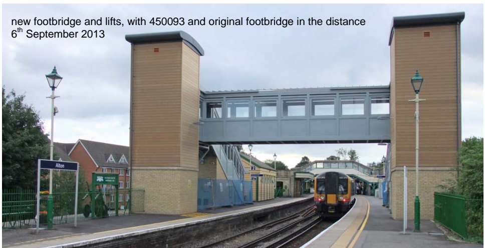
new footbridge and lifts, with 450093 and original footbridge in the distance 6 th September 2013

A new footbridge and lifts were officially opened on 14 th October 2013 at Alton to replace the existing narrow footbridge and end of platform line crossing. Alton is the southern terminus of the line from Waterloo and the northern terminus of the Mid Hants Railway (MHR) 'Watercress Line' from New Alresford, the platform for which can be seen on the extreme left in the photo below.