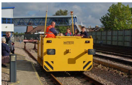
Niteq depot lathe shunter

In the 2 hours I was there it seemed well attended with lots of children (and parents) taking advantage of the rides and walking underneath the length of a unit.