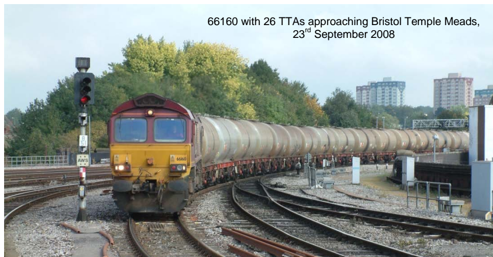
66160 with 26 TTAs approaching Bristol Temple Meads, 23 rd September 2008

The weekly DBS operated oil train servicing FGW depots in the West Country has ceased. The last working was on the 25 th October. FGW has chosen instead to move oil to its depots at Bristol St Philip's Marsh, Plymouth Laira and Long Rock, Penzance by road !!! The loss of this loco hauled freight means there is no longer a booked freight working to west Cornwall.