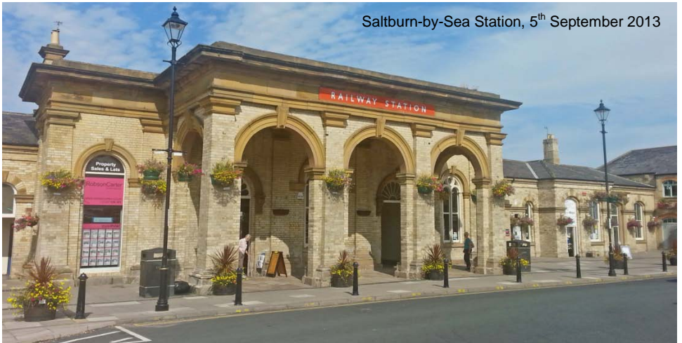
Saltburn-by-Sea Station, 5 th September 2013

One thing that is striking about the journey to Saltburn and indeed many of the journeys I made is the often sudden and juddering transition from urban sprawls to industrial landscapes to breath-taking coastlines and countryside, often in the space of just a few miles. The North East has much to recommend a visit and a little research beforehand or exploration whilst there will uncover a wealth of heritage and history..... certainly not desolate then, ed !!!