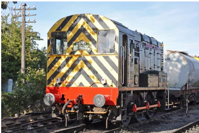
D3018 (08011) 'Haversham' Chinnor Yard

Verdict, a very enjoyable day out although, at £45 for the four of us, it was rather expensive compared to their normal Family ticket which is £25 but which they weren't doing on the day. The time of year with low, bright sunlight combined with the cramped site at Chinnor made photography challenging to say the least! I had planned to go back on the final weekend to see 08649, but the cost and the inclement weather forecast put me off.