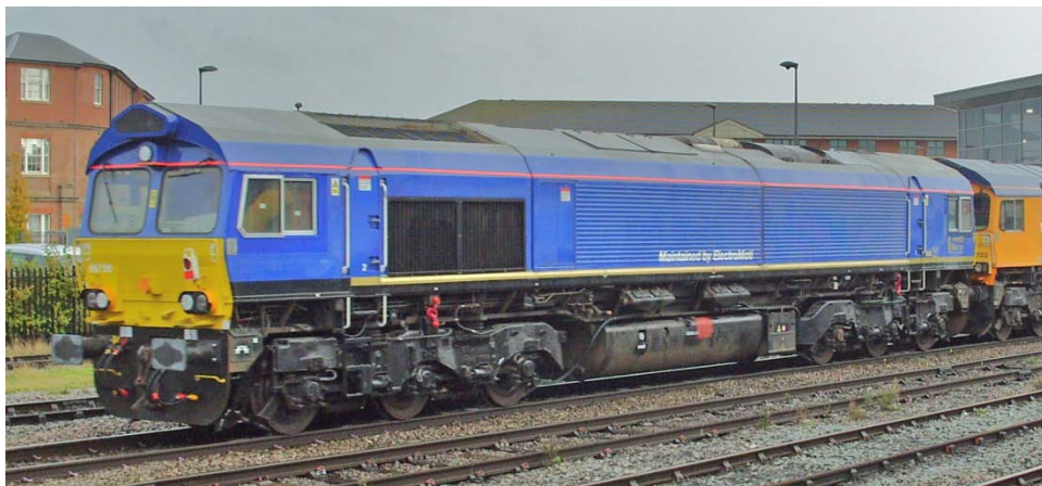
GBRf 66750 being towed into Derby Etches Park by 66703 for tyre turning 22 nd October 2013 (James Holloway)