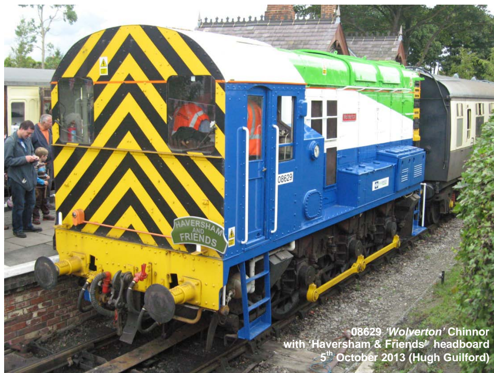
08629 'Wolverton' Chinnor with 'Haversham & Friends' headboard 5 th October 2013

The 5 th /6 th October was the first of three weekends planned to celebrate the link up with the mainline, the 60 th birthday of D3018 (08011) 'Haversham' and the 175 th Anniversary of Wolverton Works. It was feared that this would be put in jeopardy by the demise of Railcare but 08629 'Wolverton' was there in its new livery. Well done to Knorr-Bremse! Shuttle trains were top & tailed by D3018 and 08629, with some going beyond the end of the Chinnor branch over the link into Princes Risborough. I could not get to Chinnor the following weekend, so I am unsure whether the other Wolverton shunter 08649 'Bradwell' turned up as scheduled...yes it did, ed.. Knowledgeable volunteers led conducted tours of the yard where preserved locos on view or in action were 37116, D5581, 08825, Cl.121 bubblecar 55023, 3-CEP 1198 and GWR 0-6-0PT 1369.