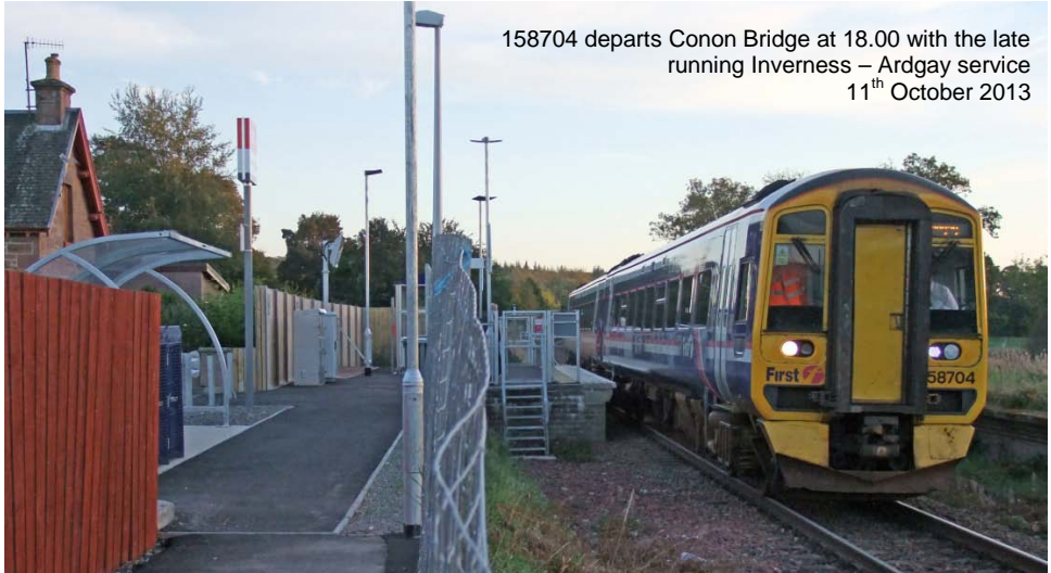
158704 departs Conon Bridge at 18.00 with the late running Inverness – Ardgay service 11 th October 2013

Formerly a two platform station, Conon Bridge, between Muir of Ord and Dingwall, opened on 11 th June 1862 by the Inverness & Ross-shire Railway and closed on 13 th June 1960. Conon Bridge was re-opened on the 8 th February 2013 as a single 15 m platform, on what is now a single track section. The original second disused platform can be seen to the right of 158704 in the photo below.