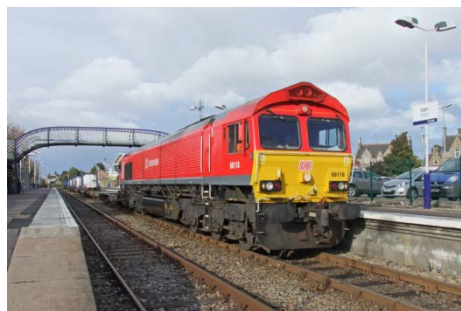
66118 on 4D31 waiting for the road having backed out of Elgin Yard (10.26) 9 th October 2013

Further Whisky trials have been run in October to / from Elgin Yard with 66118 on the 8 th /9 th , 66101 on the 15 th /16 th and 66104 (first repeat loco) on the 22 nd /23 rd . Remarkably of the 6 UK based DBS red CI.66s, 4 have appeared on these trials (half of the locos used), so just need 66001 and 66152 to appear for the set.