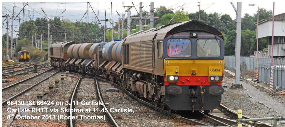
66430 t&t 66424 on 3.11 Carlisle – Carlisle RHTT via Skipton at 11.45 Carlisle, 8 th October 2013 (Roder Thomas)

The only RHTT to operate in Scotland is the 3S95 Inverness – Inverness circuit using a single Cl.66 and two FEAs (642033/035). Running from Sun – Fri, it is a long one taking between 11 and 16 hours to complete and requiring changes of crew at Aberdeen and Perth (longer run). On Mon/Tue/Thu it runs in the daylight for only the start and finish. Starting at 16.02 it heads south over Culloden Viaduct (see photo below) to Moy where the loco runs round to return to Inverness before heading to Aberdeen at 18.23, arriving approx 22.00. The route then goes south via Dundee to Perth, arriving approx 02.30 and then back up the Highland mainline to Inverness before completing the loop to Moy again (if not late), arriving approx 08.00. On Wed & Fri the final Moy loop is omitted with arrival back at Inverness around 04.00-05.00.