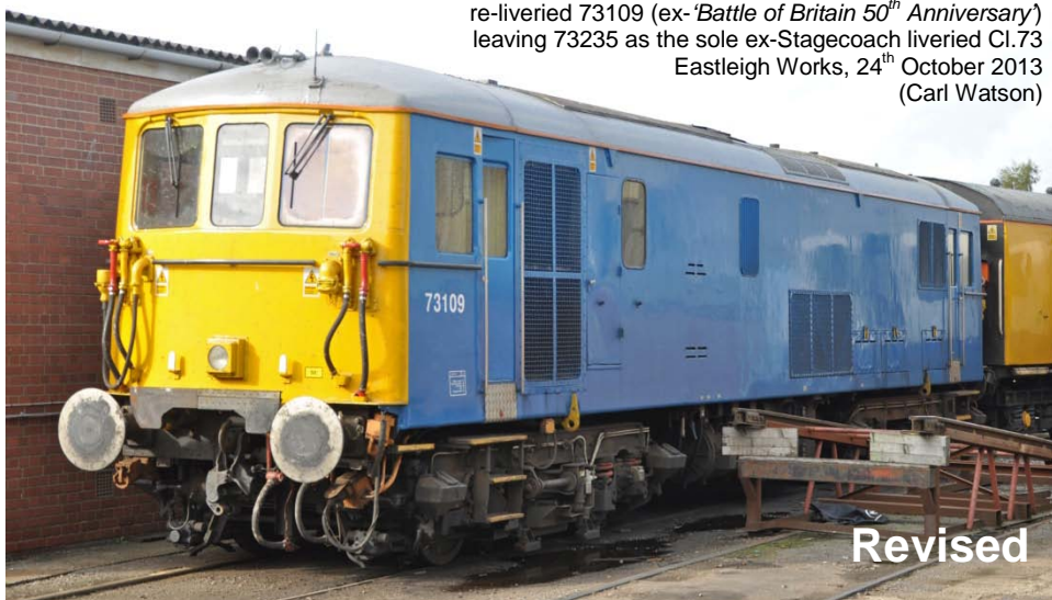
re-liveried 73109 (ex- 'Battle of Britain 50 th Anniversary' ) leaving 73235 as the sole ex-Stagecoach liveried Cl.73 Eastleigh Works, 24 th October 2013