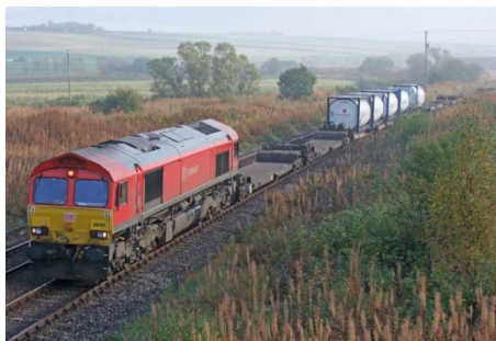
66101 on 4H31 waiting for service trains to pass in Keith Loop (11.15) 15 th October 2013