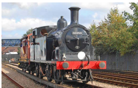
0-4-4T 30085 + S56289

Stock on depot: DMU 158890, EMUs 444001/013/020/042, 450013/029/090/100/104/109/120/543/552