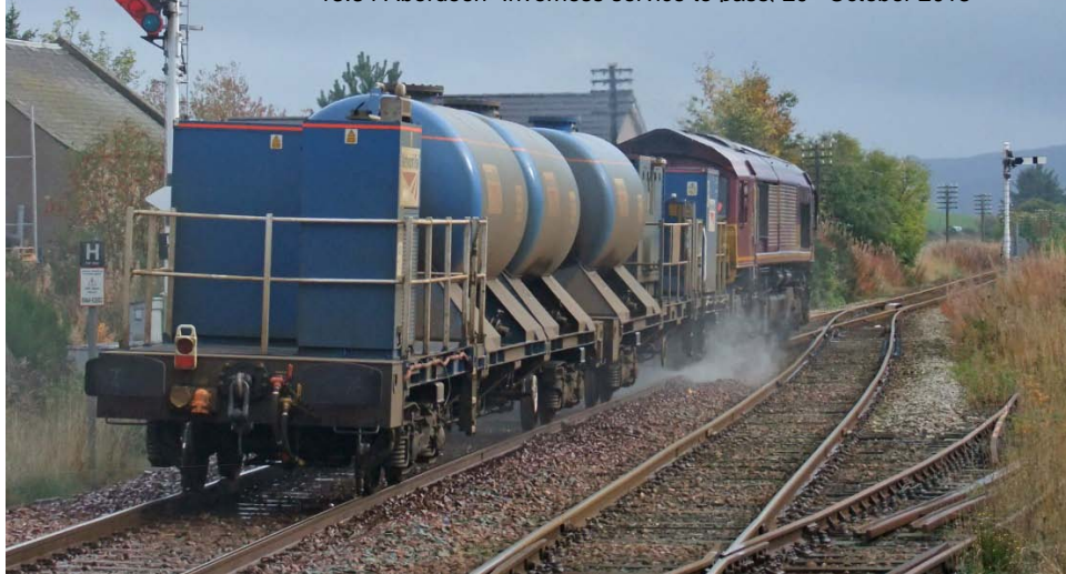
66023 + FEAs 642033/035 (rear) on 3S95 Inverness – Inverness RHTT heading south from Insch at 13.35 after waiting for the 13.34 Aberdeen- Inverness service to pass, 20 th October 2013

The first loco to operate the service was DBS 66023 but this failed after 3 weeks at Keith on Tuesday 22 nd October at 20.29 and was rescued in the early hours of Wednesday by 66104, off the whisky train from Elgin Yard. This messed up the return whisky train and 66023 was eventually seen heading south behind 66101 on Friday 25 th October, arrived Stirling at 23.34. The only nearly all daylight run is on Sundays with the train operating Inverness – Dundee return, no Moy loop, starting at 10.20, approx 15.30 at Dundee with arrival back into Inverness at 22.15 (not sure about driver change).