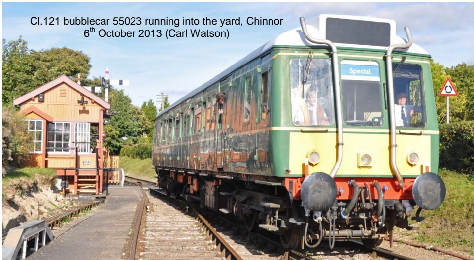
CI.121 bubblecar 55023 running into the yard, Chinnor 6 th October 2013

visiting GWR 0-6-0PT 1369 were all in action on the day. Home fleet locos present in the yard but not in use were D5581 (31163) (leaking air tank), 37116 (operational but not in use) and recent arrival 08825 (awaiting fitting of vacuum brakes).