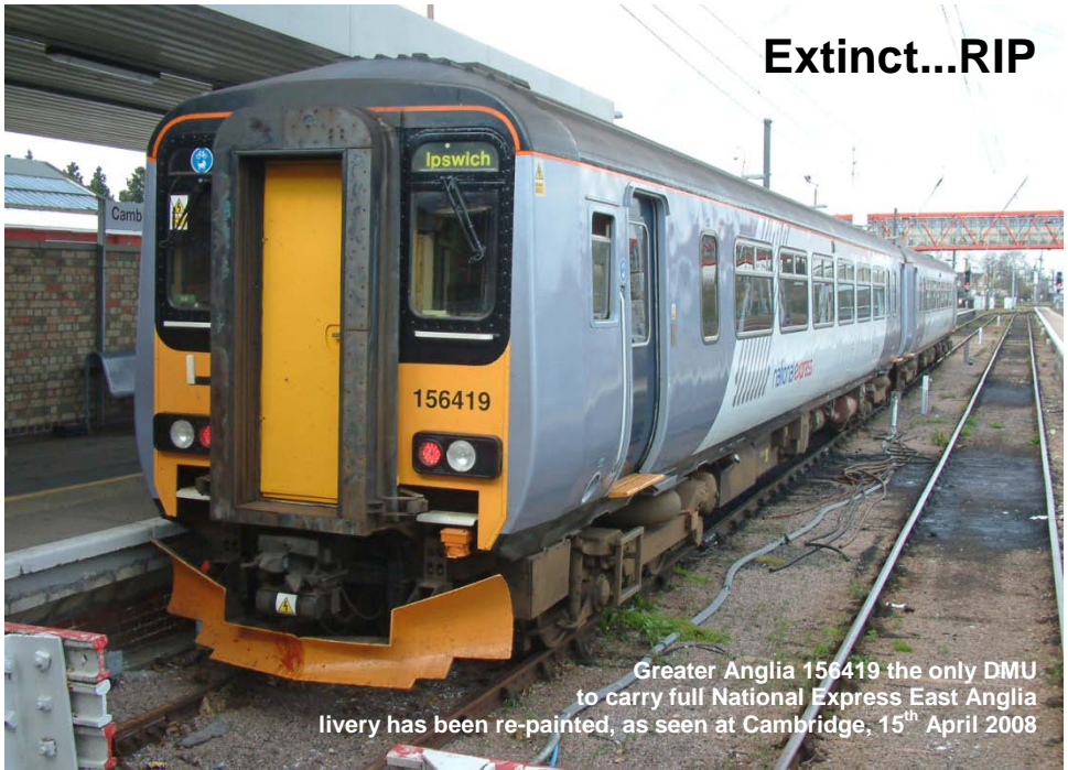
Greater Anglia 156419 the only DMU to carry full National Express East Anglia livery has been re-painted, as seen at Cambridge, 15 th April 2008