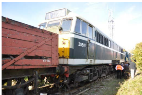
resident locos in the yard at Chinnor, 37116 (left) and D5581 (right), 6 th October 2013