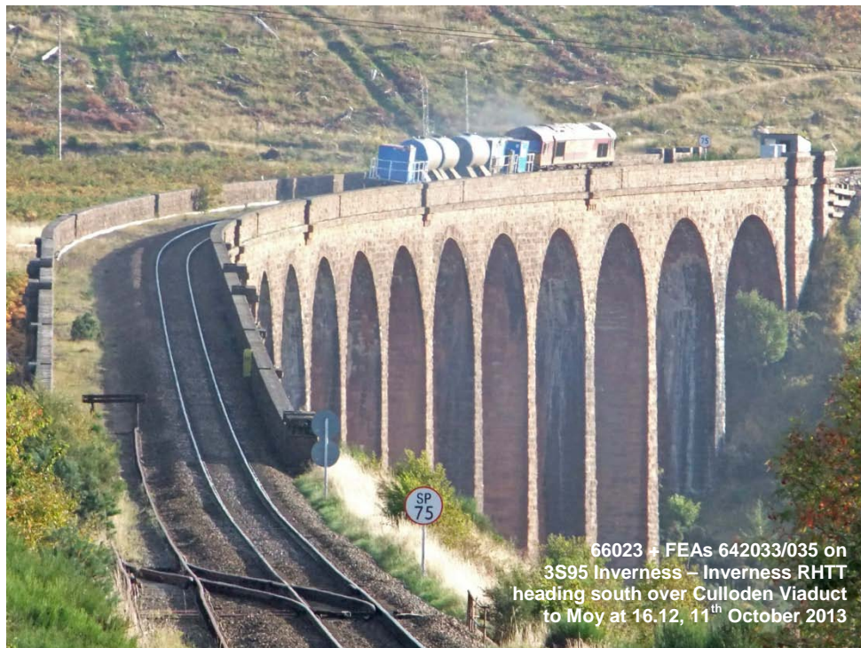
66023 + FEAs 642033/035 on 3S95 Inverness – Inverness RHTT heading south over Culloden Viaduct to Moy at 16.12, 11 th October 2013

The only RHTT to operate in Scotland is the 3S95 Inverness – Inverness circuit using a single Cl.66 and two FEAs (642033/035). Running from Sun – Fri, it is a long one taking between 11 and 16 hours to complete and requiring changes of crew at Aberdeen and Perth (longer run). On Mon/Tue/Thu it runs in the daylight for only the start and finish. Starting at 16.02 it heads south over Culloden Viaduct (see photo below) to Moy where the loco runs round to return to Inverness before heading to Aberdeen at 18.23, arriving approx 22.00. The route then goes south via Dundee to Perth, arriving approx 02.30 and then back up the Highland mainline to Inverness before completing the loop to Moy again (if not late), arriving approx 08.00. On Wed & Fri the final Moy loop is omitted with arrival back at Inverness around 04.00-05.00.