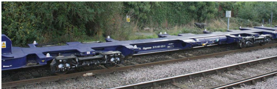
new IDA Bogie Twin Cont Flat 'Lowliner' 39.70.4901.025-9 in consist with 10 others seen being hauled through Walsall by 47832, 24 th October 2013