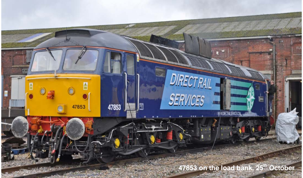
47853 on the load bank, 25 th October

57007's repaint into DRS Compass livery is complete.