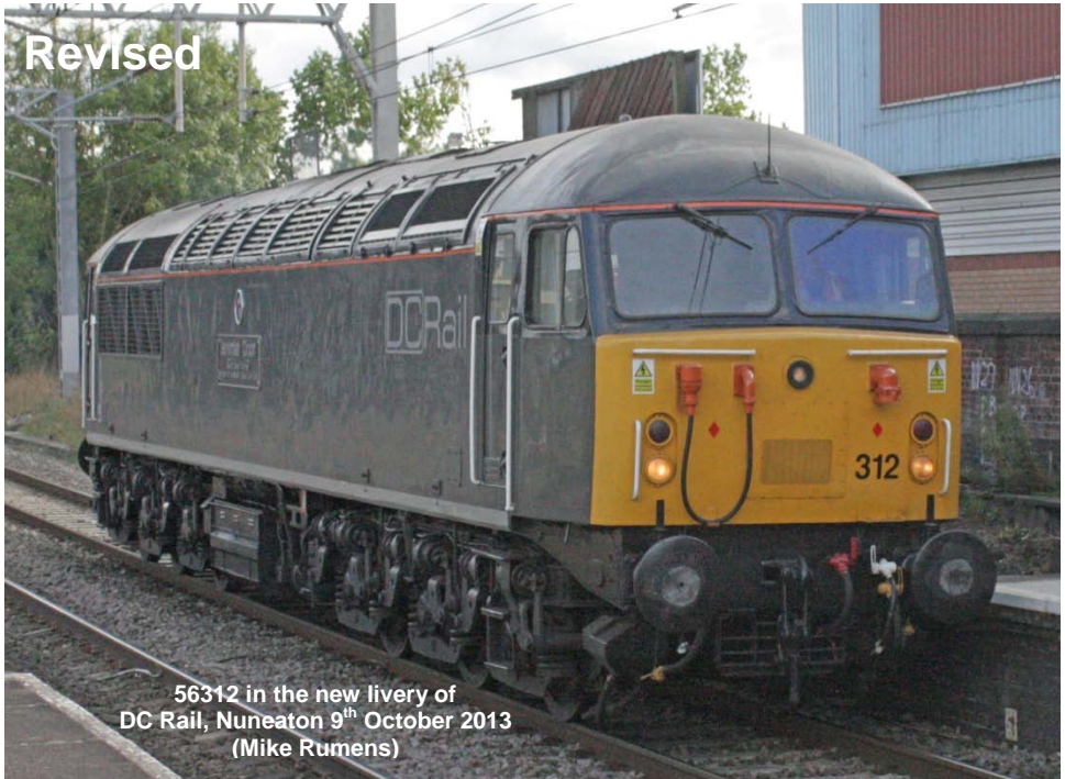
56312 in the new livery of DC Rail, Nuneaton 9 th October 2013 (Mike Rumens)