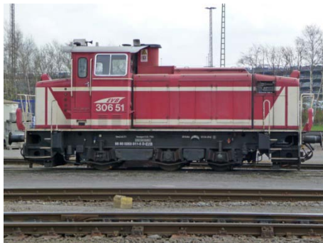
EVB 306 51 DB computer 263011 Bremerhaven Docks, 21 st April 2013