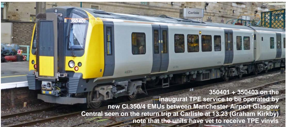
350401 + 350403 on the inaugural TPE service to be operated by new CL350/4 EMUs between Manchester Airport Glasgow Central seen on the return trip at Carlisle at 13.23 (Graham Kirkby) note that the units have yet to receive TPE vinyls