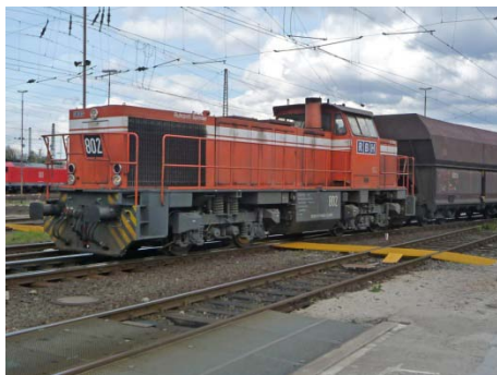
private operator 802 (Cl.G1206) DB computer number 275802 RBH, part of RAG Bahn und Hafenbetriebe Oberhausen West Yard 19 th April 2013