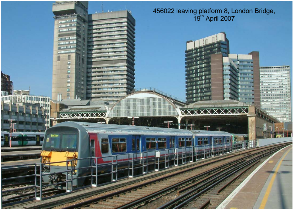
456022 leaving platform 8, London Bridge, 19 th April 2007