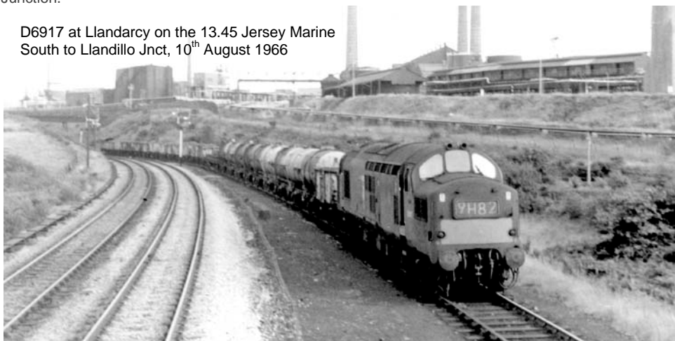
D6917 at Llandarcy on the 13.45 Jersey Marine South to Llandillo Jnct, 10 th August 1966