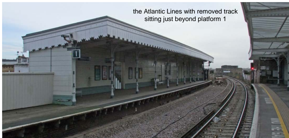
the Atlantic Lines with removed track sitting just beyond platform 1

Following on from the changes made after the East London Line was extended into Clapham Jct (see article August 2012) Battersea Park has been altered with track rationalised. Battersea Park was a junction station with the Victoria to Clapham Jct lines formed by two pairs of double tracks, Brighton Fast and Slow Lines. There were 5 platforms. Platforms 1 and 2 are on the Atlantic Lines (part of the south London Line), a \frac{1}{4} mile double track spur section to Factory Junction, Wandsworth Road. Platforms 3 and 4 serve the Brighton Slow Lines and platform 5 the Down Brighton Fast Line, though this does no longer sees stopping trains. The Up Brighton Fast Line does not have a platform face. Previously the only intermediate station between Victoria and Wandsworth Road operated by twice hourly Cl.456s, through services were withdrawn in December 2012 on the Atlantic Lines. Throughout 2013 there were only two Mon-Sat daily services one terminating and one starting from the station, the 22.17 from Highbury & Islington, arriving at 22.59, and the 06.18 to Highbury & Islington arriving 07.01. From December 2013 an additional service has been added with the 23.09 to Clapham High Street arriving at 23.14. The services on the Atlantic Lines are operated by London Overground.