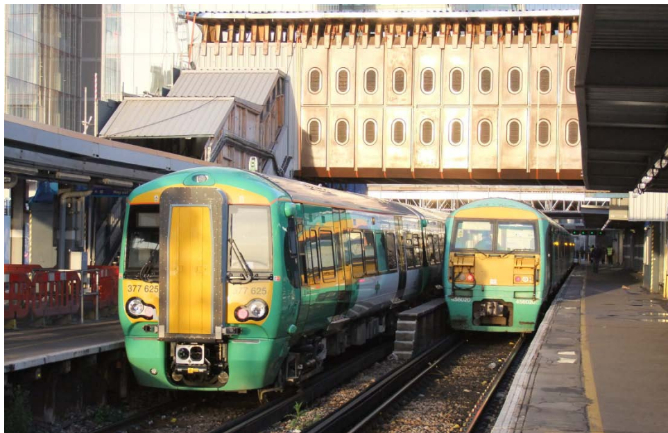
new & 'old' in the early morning sunshine, 456020 + 456013 sit alongside one of the very units introduced to replace them 377625, London Bridge, 08.43 14 th December 2013

Alas there was nothing organised to mark the humble 456s withdrawal from Southern services. I personally will miss them as I have grown affectionate of these slightly odd, unloved trains. They're not sexy, not remarkable and not even that comfortable to ride on but as no one seems to care for them, I and my colleagues have become our own unofficial 456 fan club!