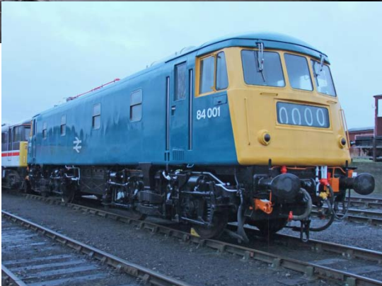
Not so much a new livery as a repaint for tatty 84001 Barrow Hill 15 th December 2013