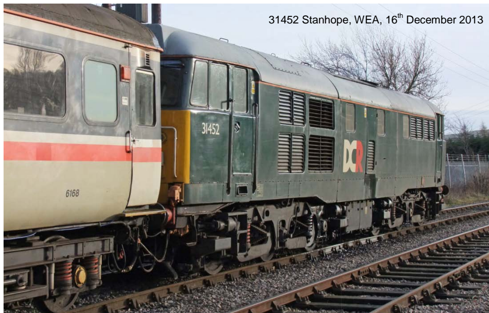
31452 Stanhope, WEA, 16 th December 2013