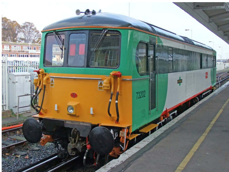
from one unique livery to another the Cl.73s still throw up a galaxy of liveries for such a small operational fleet 73202 in newly applied Southern livery with Gatwick Express branding Eastbourne 10 th December 2013 (see former Gatwick Express livery in Sep 2011 issue)