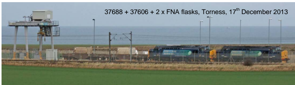
37688 + 37606 + 2 x FNA flasks, Torness, 17 th December 2013