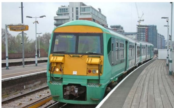
a suitable view of 456016 on a South London Line service stopping at platform 1 Battersea Park, 18 th April 2008 not only has the service stopped, but the track too (see INFRASTRUCTURE NEWS )

The Class 456 2-car EMUs disappeared from Southern services during December. All 24 units are to be transferred to South West Trains. In week commencing the 9 th December, there are 12 booked diagrams for 456s, which dropped to 8 on the 16 th and then 4 from the 17 th until Christmas Eve. The last Southern 456 working was the 20.59 Dorking to Sutton on Christmas Eve. I believe 12 of the units will go directly to South West Trains and the other 12 will go to Wolverton. They are to be transferred by road, due to the lack of suitable translator vehicles to move them by rail.