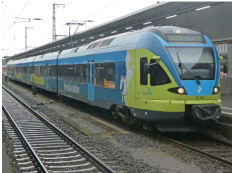
private operator, Westfalenbahn ET019 5 car unit (DB computer numbers 429005 / 829605 / 829305 / 829505 / 429505) Munster 18 th April 2013

April 18 th 2012: I flew to Dusseldorf the day before I was to meet John. I took a ride to Munster which is a fairly busy station. I spent a couple of hours there, some cops, then back to Dusseldorf for some station time. This is a busy station although I find it hard to cop anything there. Outside the station there is a steady flow of trams and underneath there is the underground. I pushed the boat out that night and bought some sandwiches and went underground to eat them and watch the U-Bahn! How sad!