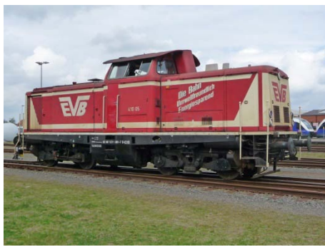
EVB ex-DB 211061 Bremervorde Depot, 21 st April 2013