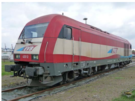
EVB 420 12 DB computer 223032 Bremerhaven Docks, 21 st April 2013