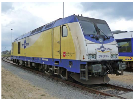
Metronom operate some services in Northeast Germany with electric and diesel locos, here is diesel 246009 Bremervode Depot, 21 st April 2013

There was a good mixture of locomotives and units from several private companies. Well worth the visit!