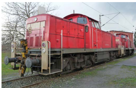
295004 Emden Depot, 20 th April 2013