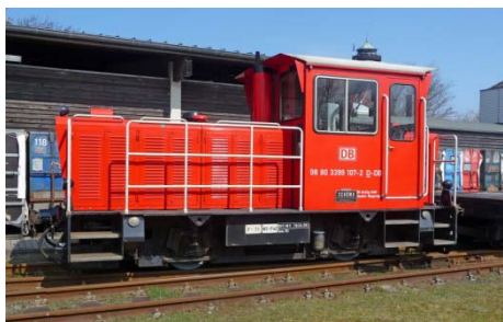
our cabbng loco C 399107 Westanleger, 20 th April 2013

locomotive, 1929 built 0-6-0 99211 outside a church. A coffee and cake then back to the station with a couple of hours still to kill. Our train was in so we took photos and wandered around. Eventually we got on the train then the guard (at the time we did not know he was) came and told us to come with him! He took us to the cab and told us to get in, so cabbng 399107 back to the harbour. Our thanks go to him and the driver. Arrival back on the mainland was about 1600. We drove to Emden depot before returning to Bremen for a repeat of last night.