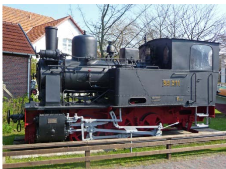
plinthed outside a church in Wangerooge was 0-6-OT 99 211, 20 th April 2013

As we left 399107 was waiting outside to bring passengers to catch the return sailing. At Wangerooge the depot was adjacent to the station and inside was 399106 partly dismantled. That's it, the island cleared and only a 4 hour wait before we could get the ferry back. How can we kill 4 hours? The town is so small so we went looking for a café to pass some of the time. Luckily we found a plinthed steam