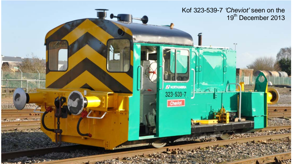
Kof 323-539-7 ' Cheviot ' seen on the 19 th December 2013

Kof 539-7 has been painted into Arlington green and named 'Cheviot'.