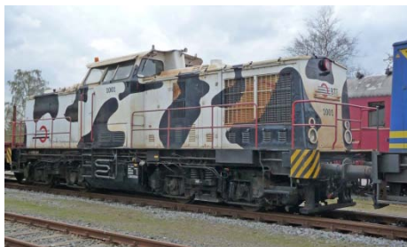
BTEs (Bremen-Thedinghauser Eisenbahn GmbH) only locomotive 1001 DB computer 293002 Bremervorde Depot, 21 st April 2013