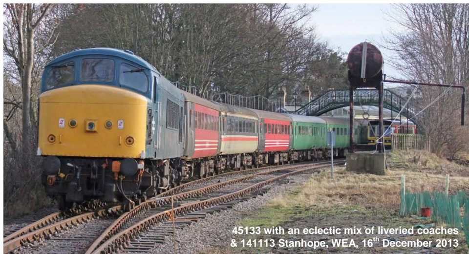
45133 with an eclectic mix of liveried coaches & 141113 Stanhope, WEA, 16 th December 2013

As per last year the Weardale Railway ran its Polar Express trains. Apparently these have proved highly popular with over 40,000 tickets being sold over the season. The Dartmoor Railway also ran similar services. The services start from Stanhope and run east to the 'North Pole'. On the day I visited the 16 th December 2013, DCR 31452 was the east facing loco with 45133 on the 'rear' hired in from Midland Railway Butterley. A rake of 10 Mk2 coaches was used with 7 hired in from Eastern Rail Services (ERS) in a variety of liveries, Virgin, BR Blue/grey and Intercity to supplement the 3 resident* (green) coaches. The rake was made up as (45133 to 31452) 6059, 5906, 5960, 9492*, 3402*, 3425*, 3521, 9497, 5866, 6168. Due to the failure of its resident Cl.141, 141113 was also present having been hired in from MRB and was shuttling staff to and from Stanhope.