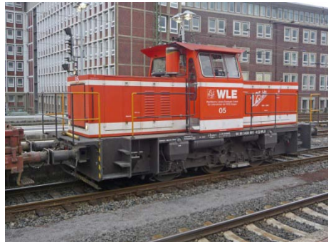
private operator WLE (Westfälische Landes Eisenbahn GmbH) 05 DB computer number 420 001 Munster 18 th April 2013