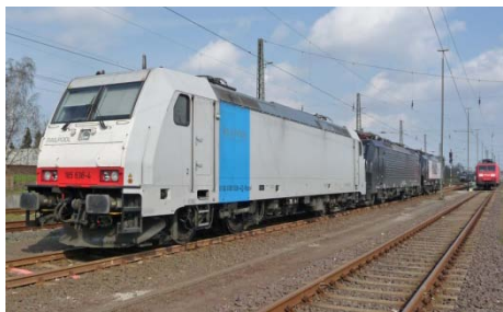
private operator Railpool's CI.185638 Bremerhaven shed, 21 st April 2013

Next depot was Bremerhaven. As this was a Saturday there was no one to ask at the depot so we wandered around and noted 38, mainly locomotives, a few units and even an Austrian 1116. Next stop was the docks. Scattered around were 12 locomotives, 6 DB class 295s including my last one (Osnabruck allocated) 295083 and 6 private EVB locomotives.