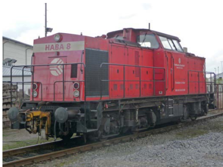
HABA (?) 8, DB computer number 203116 stands outside Oberhausen Hafen Depot 19 th April 2013

The next call was Osnabrück main depot. My last class 295 lives here. Disappointment! The shed only had 14 scattered about. Nothing like it used to be. No 295s at all. So on to Bremen and our hotel. Once checked in it was off to the station to see the passenger trains and freight. In Germany a lot of freight starts in the evening as passenger trains tail off. Here was no exception. A McDonalds on the platform and plenty of action.