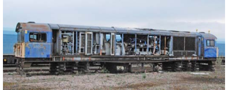
58002 (above) & 58037 (below) minus bogies Eastleigh Depot as seen from Southampton Airport car park 14 th April 2012