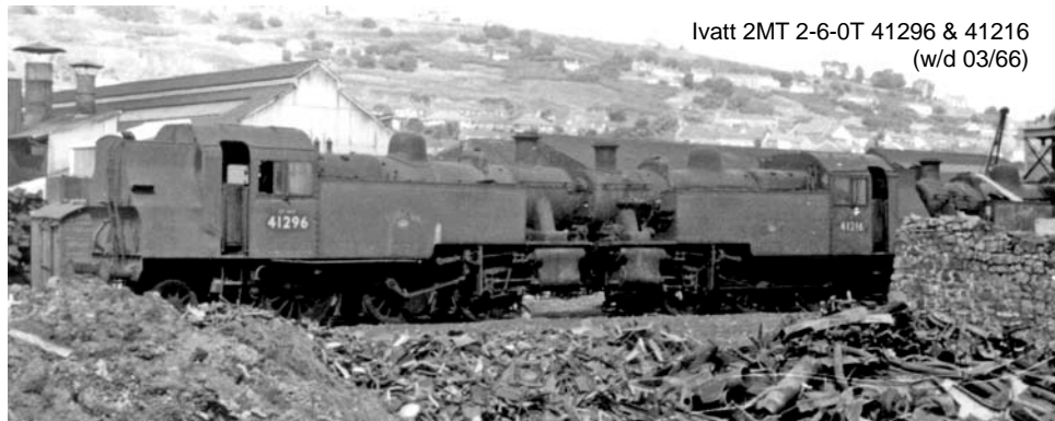
Ivatt 2MT 2-6-0T 41296 & 41216 (w/d 03/66)

Midland terminus. Being in the right place at the right time is important and although we researched all this beforehand you can never be certain with freights. It worked on this occasion and we had a ride with D3828 back up the line we did yesterday to the washery at Ynysgedwyn. From there we went up to the Neath and Brecon line at Abercrave and walked to Colbren Junction where D6909 and D6921 were on hand to take us back to Abercrave, rare track indeed. I cannot recall a special on this branch although I expect there was one once. Then D6921 on its own headed the 16:00 coal train to Swansea Eastern Depot going up to Colbren and reversing down the N&B main line. We stopped at Onllwyn and spent time chatting to the signal man in the box that emulated a greenhouse with the number of plants he had growing in there, before continuing south. This line is of course still open to Onllwyn and has many specials running on it over the years. On arrival in the docks we walked part of the GW Wynd Street line before returning to our B&B