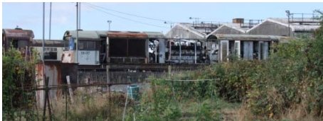
58017 virtually demolished Eastleigh Depot, 7 th September 2013