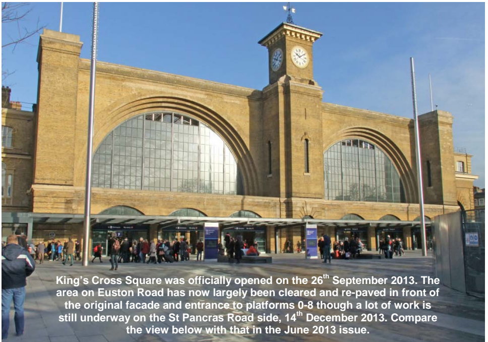
King's Cross Square was officially opened on the 26 th September 2013. The area on Euston Road has now largely been cleared and re-paved in front of the original facade and entrance to platforms 0-8 though a lot of work is still underway on the St Pancras Road side, 14 th December 2013. Compare the view below with that in the June 2013 issue.