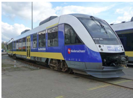
Oberhausen Hafen is a depot for private operator's DMU as with Eurobahn 648182 19 th April 2013