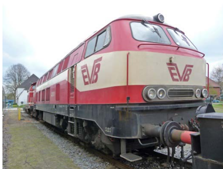
EVB 420 01 was an interesting locomotive stabled on Bremervode Depot DB computer number 219001 but the class 219s did not look like this (see later in article) it looks more like a 215/6/7/8, 21 st April 2013

Kiel was next. I needed 4 class 143s and 2 class 112s from Germany. One of each is allocated here. We drove into the depot, it was a Saturday and all of the doors to the offices were locked. No one to ask, so we wandered around. Classes 112 and 143 were on shed. Not mine. More DMUs than last visit! Lubeck was next. I have done this depot a few times. It was one of the strongholds for 'rabbits' class 218s, but they had all gone! A few DMUs scattered about in the yard of a once great depot. However, success at the station as my Kiel 112 was there.