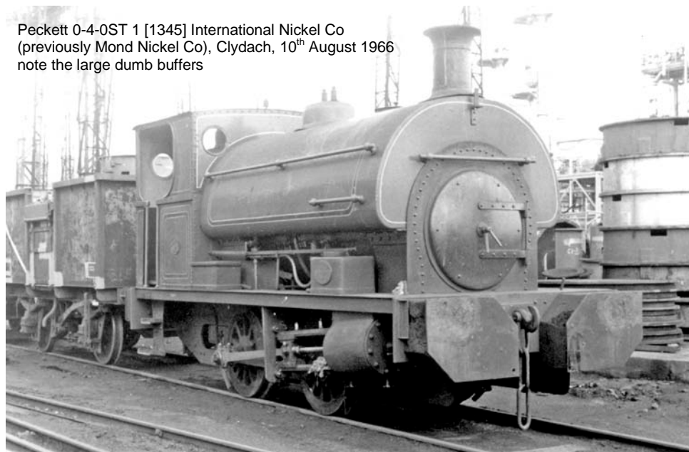
Peckett 0-4-0ST 1 [1345] International Nickel Co (previously Mond Nickel Co), Clydach, 10 th August 1966 note the large dumb buffers

Monds is the present terminus of the GW Clydach on Tawe line and we watched the train set back off the down main line to access the branch then we joined it. Life was amazing in those days as we arrived in the reception sidings and freely walked unchallenged round the factory site chatting to staff and photographing the industrial shunter. I've since been told official requests to visit the industrials were always turned down but that day we got away with it.