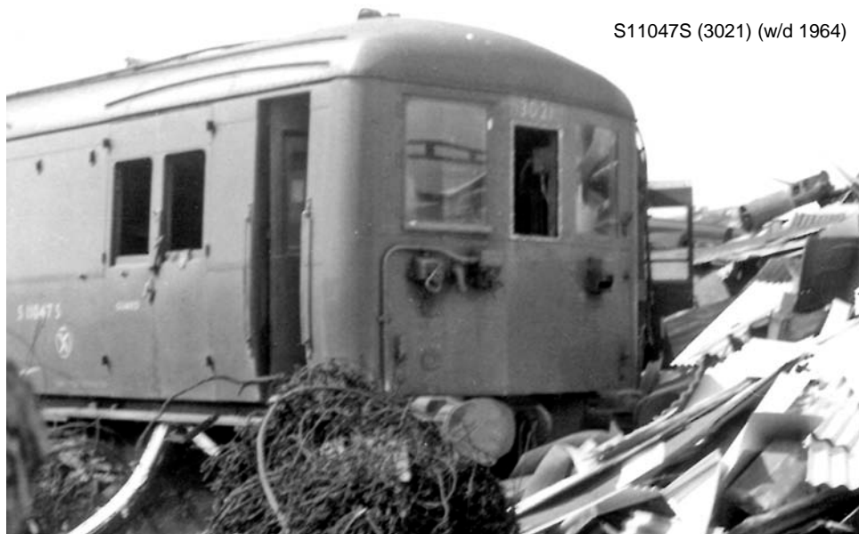
S11047S (3021) (w/d 1964)

Wednesday the 10th was our last day together and we got a bus to Morriston and inspected East (Midland) station. Cohens scrap yard was off this line and apart from three Ivatt 2MT 2-6-0Ts (see photo above), of interest and more unusual was 6PAN EMU 3021 (see photo below) and SR shunter 15201.