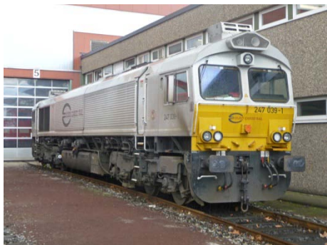
Cl.66. DB 247039 (ex-266439 Euro Cargo Rail 7703) Oberhausen Depot 19 th April 2013