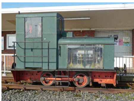
plinthed in the car park is this unidentified narrow gauge shunter Westanleger, 20 th April 2013