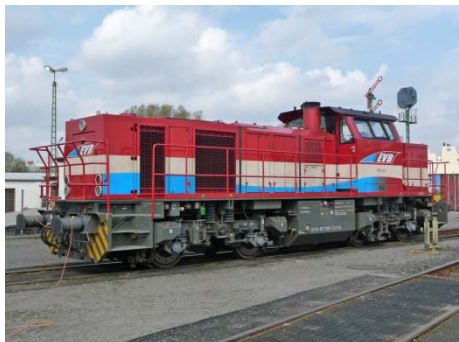
EVB (Eisenbahnen und Verkehrsbetriebe Elbe-Weser GmbH) 411 51 DB computer 271019, Vossloh 5001565 Bremerhaven Docks, 21 st April 2013

Bremervorde was next. This depot is for private companies and is adjacent to the station. The gates for the road entrance were closed but the walkway from the station gave us access. Not a soul to be seen so no one to ask!