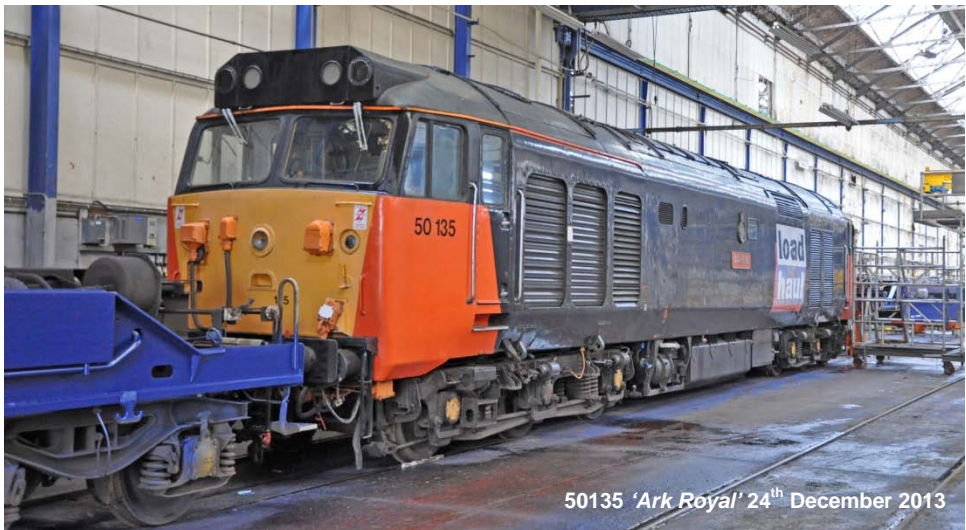
50135 ' Ark Royal ' 24 th December 2013

56312 arrived with 50026, 50031 and 50135 on the 16 th . The 56 departed light immediately after.