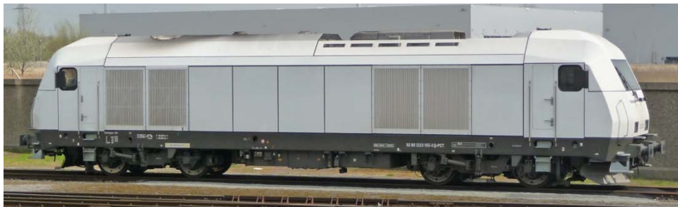
in plain white livery with no clue as to ownership 223 155, Bremerhaven Docks, 21 st April 2013