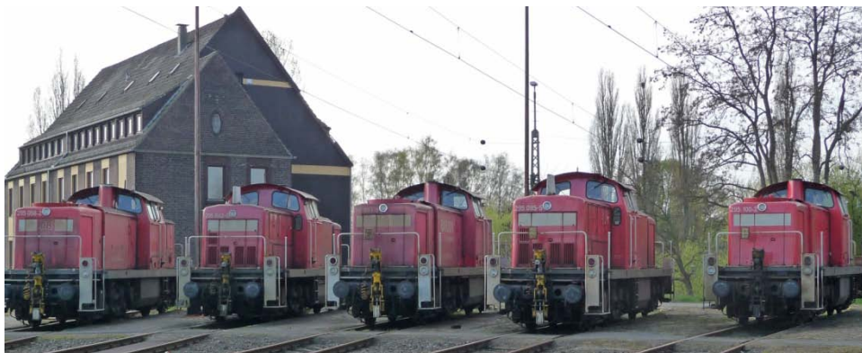
CI.295s once would have been 2 or 3 to each track, sadly now only one, Bremen RBF (freight depot) left to right 295058/042/093/085/100, 21 st April 2013

Next depot was Bremerhaven. As this was a Saturday there was no one to ask at the depot so we wandered around and noted 38, mainly locomotives, a few units and even an Austrian 1116. Next stop was the docks. Scattered around were 12 locomotives, 6 DB class 295s including my last one (Osnabruck allocated) 295083 and 6 private EVB locomotives.