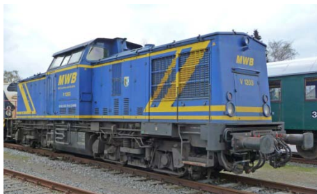
ex-DR Cl.202725 now MWB (Mittelweserbahn GmbH) V1203 Bremervorde Depot, 21 st April 2013