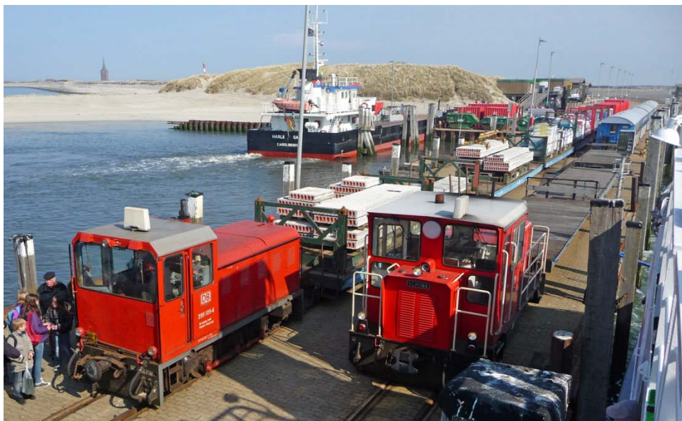
photographed from the ferry on the docks at Westanleger are C 399105 and C 399108 the latter was to haul us to Wangerooge, 20 th April 2013

emergency services. However, it is also the home of the only DB metre gauge railway which runs from the harbour at Harlesiel to Wangerooge. This line conveys the passengers and cargo that arrive by sea. There are only 4 locomotives allocated there. 1989 built C (six wheel) 399105/6 are used on freight trains only and 1999 built C 399107/8 haul the mixed trains. There are only 2 ferries a day so we got our return tickets and the ferry Harlingerland took about an hour to get us to the island. 399105 was on the docks at Westanleger along with 399108 that was to haul us to Wangerooge.