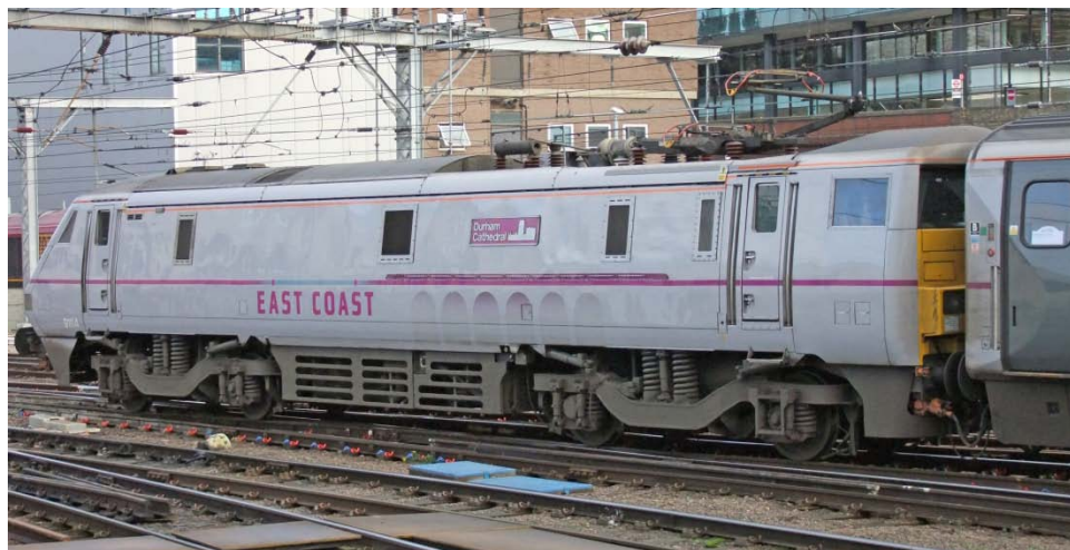
further to the photo in August 2013 issue, 91114 'Durham Cathedral' has lost its Lindisfarne Gospel advertising vinyls, King's Cross 14 th December 2013