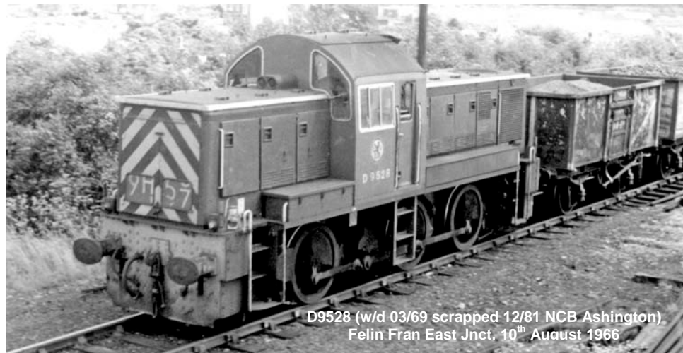
D9528 (w/d 03/69 scrapped 12/81 NCB Ashington) Felin Fran East Jnct. 10 th August 1966

We crossed to Copper Pit Platform on the GW Morrision West line and walked to Felin Fran where we visited both West Junction and East Junction signal boxes and waited in the latter for the 12.00 Jersey Marine to the International Nickel factory at Monds freight which arrived behind D9528, rare haulage on a rare line.