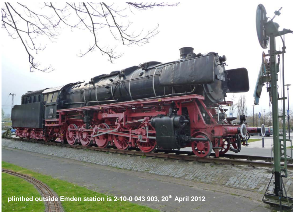
plinthed outside Emden station is 2-10-0 043 903, 20 th April 2012

April 21 st 2012: Initially we had written for permits for Bremen works which did not get a reply so this morning we caught a train to Verdon which passes the works yard. We saw quite a bit including a German Warship class 221117. As we arrived at Verdon a return train was in the platform so no time was lost. The car was parked at the now closed Hbf depot so we went to the Rangierbahnhof (freight) depot. Like many depots, only a shadow of its former self but still a good selection was seen.