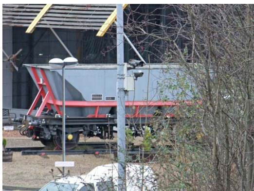
merry go round HAA hopper 350002 now 'preserved' at Knottingley Depot as seen from Spawd Bone Lane which crosses the triangle of lines south of the depot 16 th December 2013