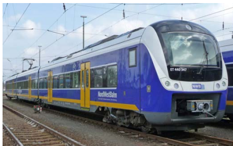
DB CI. 440 EMUs originally were used on s-bahn services in the Augsburg / Munich area but private operators like North West Bahn now use them as well. Here ET440 347 is stabled at Bremerhaven. NB. this unit only carries a DB class number, 21 st April 2013