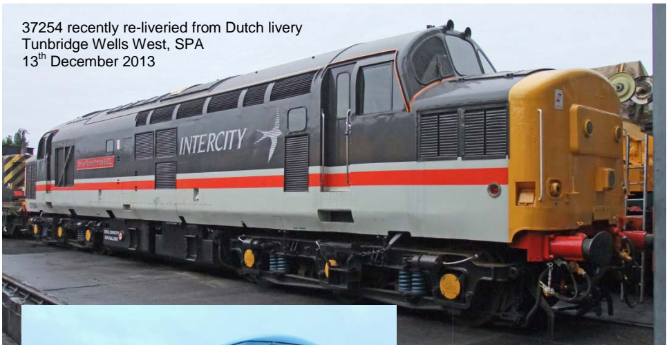
37254 recently re-liveried from Dutch livery Tunbridge Wells West, SPA 13 th December 2013