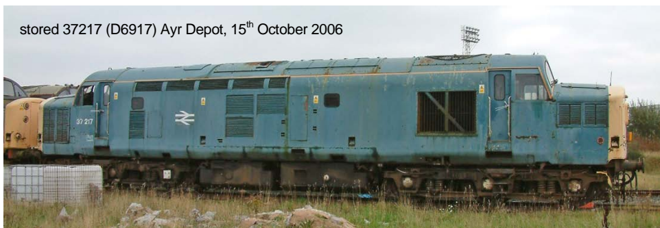
stored 37217 (D6917) Ayr Depot, 15 th October 2006