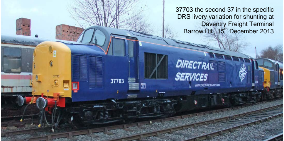
37703 the second 37 in the specific DRS livery variation for shunting at Daventry Freight Terminal Barrow Hill, 15 th December 2013