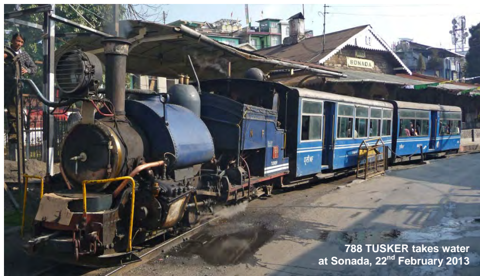
788 TUSKER takes water at Sonada, 22 nd February 2013

February 22 nd 2013: Another charter, this time to Darjeeling and hauled by 788 TUSKER. We departed through the bazaar, passing inches from the shops. The train hit a 4 X 4 and damaged the rear end. The consensus was that the vehicle should not have been there so it was its own fault! We arrived in Darjeeling at dusk.