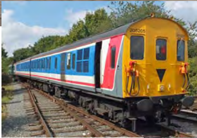
above recently repainted 205205 in NSE livery, North Weald, Epping & Ongar Railway 12 th September 2014