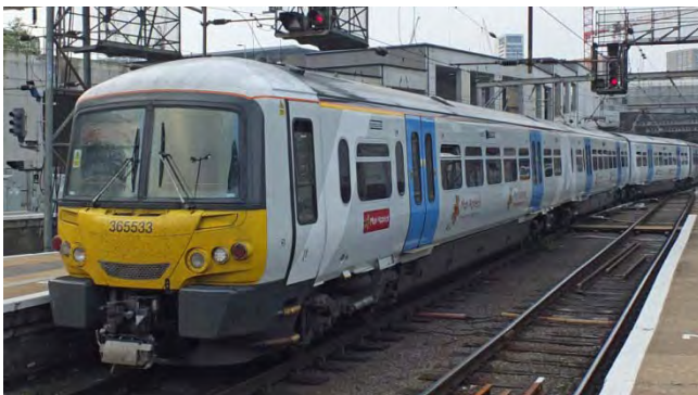
left 365533 'Max Appeal' with branding throughout, King's Cross 6 th September 2014