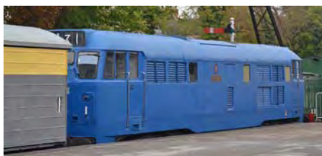
31289 'Phoenix' is now at the Rushden Transport Museum with a nice new coat of blue paint, having moved earlier this year from the Northampton & Lamport Railway 19 th September 2014