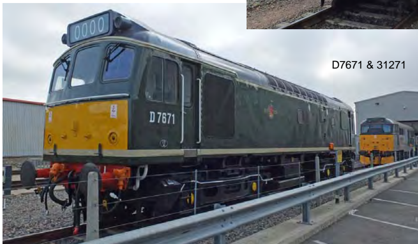
D7671 & 31271