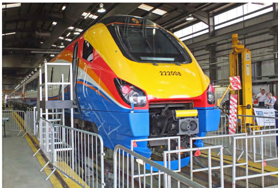
below 222008 with our stand to the right and the team tucking into breakfast... before the hordes arrived at 10.00