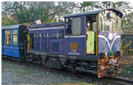
class NDM6, B, locomotive 604 MAVERICK shunts stock inside the depot Siliguri Junction 21 st February 2013

February 20 th 2013 (cont): Upon arrival at New Jalpaiguri, which is a junction with the main system we had plenty of time to photograph our charter and locomotives in the main station. Of note, there is no such thing as trespass on the railways. Locals walk along, and cross the tracks which allows us to do the same. We had photography permits and being sensible we were able to go as we pleased.