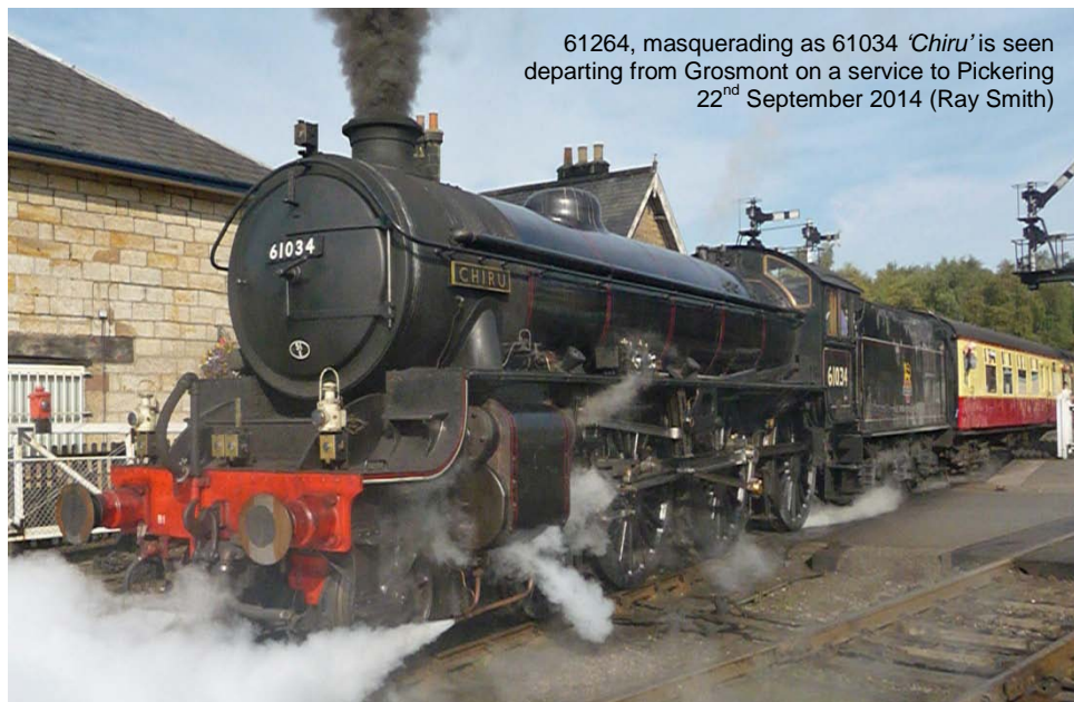
61264, masquerading as 61034 'Chiru' is seen departing from Grosmont on a service to Pickering 22 nd September 2014 (Ray Smith)