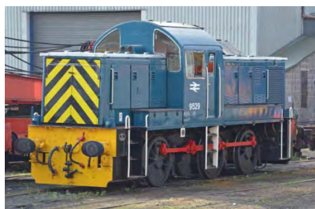
9529 Wansford, Nene Valley Railway 28 th September 2014 (Colin Pottle)