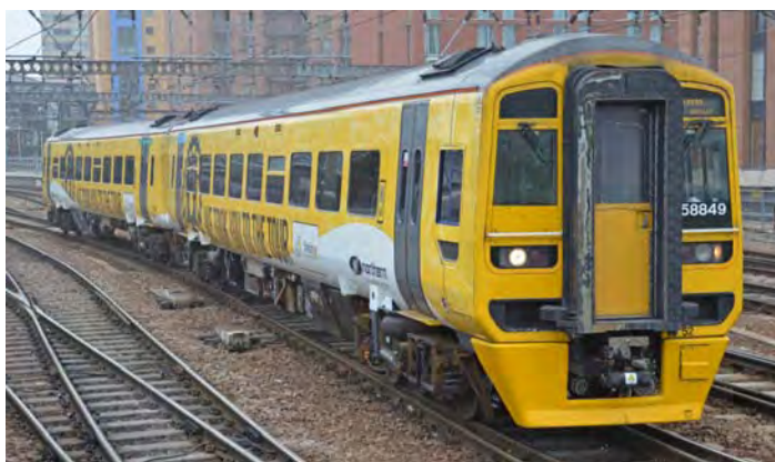
left 158849 in revised Tour de France livery it now says WE TOOK YOU TO THE TOUR (see p.60 August 2014 issue for original wording of TAKING YOU TO THE TOUR), departs Leeds for Nottingham at 10.06 16 th September 2014