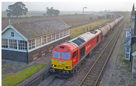
60063 on 6E46 Kingsbury - Lindsey empty tanks passed Ulceby at 09.17.