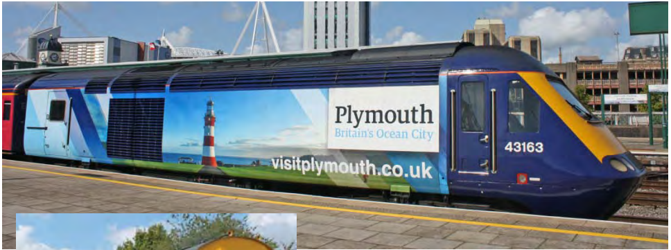
above 43163 in advertising livery to promote Plymouth, Cardiff (14.22) 28 th August 2014

This section will endeavour to show all new liveries / variations or those existing ones where not carried on the stock before. Liveries that become 'extinct' will also be covered. As with names, it may take a while after the livery application before a photo is sourced from members.