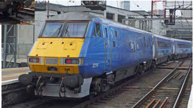
above 82216 + Mk4 set in Sky advertising livery, King's Cross, 6 th September 2014