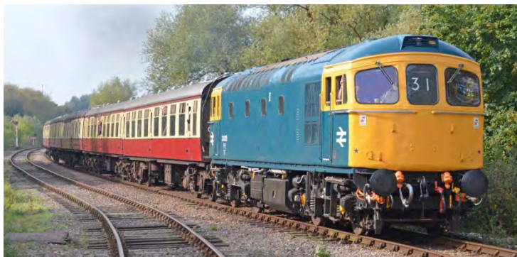
left 33035 heading east at Longueville Jct with Fletton Loop branch on the left