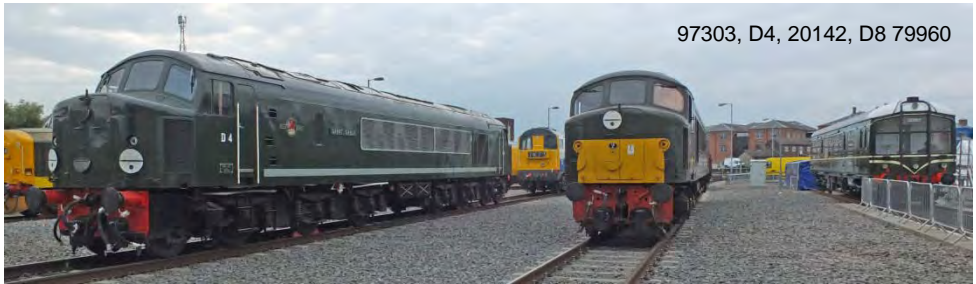
97303, D4, 20142, D8 79960

On Saturday 13 th September East Midland Trains (EMT) opened the doors to its Etches Park Depot for the first time to celebrate the 175 th Anniversary of railways in Derby. This was part of other civic events that had taken place throughout 2014.