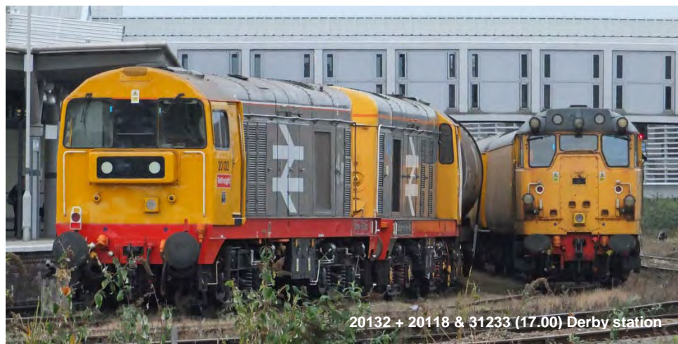
20132 + 20118 & 31233 (17.00) Derby station

Even before the event started there was the added attraction from Friday night of 6 CI.20s in 4 different liveries stabled to the east of platform 5 in Derby station with 4 barrier tanks. The line up from north to south was, KBA 85936 + 85933 + 20905 + 20131 + 20096 + 20107 + KBA 85943 + 85937 + 20118 'Saltburn-by-the-Sea' + 20132 'Barrow Hill Depot'. So ignoring any passing HST cars there were 17 diesel locos and 3 DBSOs plus at least 10 test coaches (I am not sure I recorded them all) on view beyond the confines of the event.