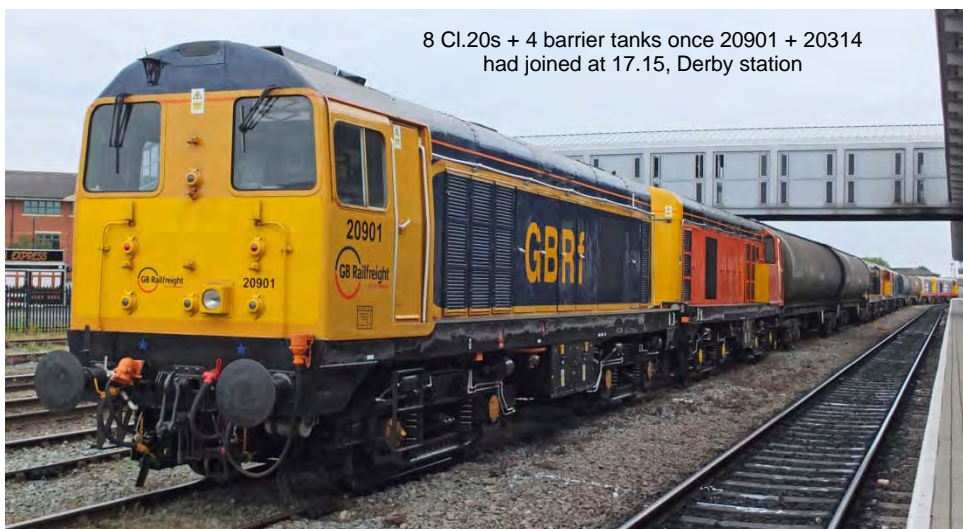
8 Cl.20s + 4 barrier tanks once 20901 + 20314 had joined at 17.15, Derby station

We had a limited view out of the shed past 158770 but it was only about a 30 yard 'walk' if something caught our eye. This was a particularly good spot for those interested in test vehicles as the day was a bonanza as not only were there various stored vehicles but 3 test trains arrived. In order these were 73201 + 9523 + 999602 + ? + 73119, 37609 + 6264 + 999606 + 997983 + 9703 + 37608 and 31233 + 977986 + 977985 + 62384 + 9708. The NR yellow 08417 was pottering about early on and dragged the 73s test train away. As mentioned the 37s test train stopped with 37609 alongside 37670.