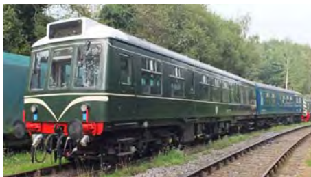
NRMs Cl.108 DMU hybrid liveried 51922 + 51562 has moved from the East Lancs Railway to the East Kent Railway, Shepherdswell, 7 th September 2014