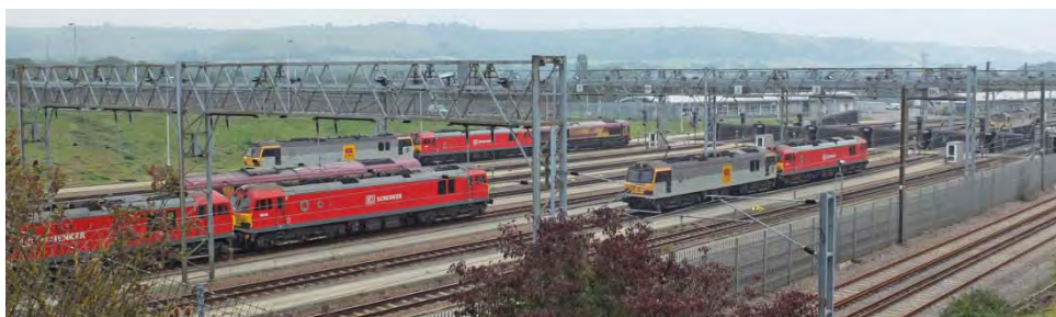
front left to right, 92016 + 92042 with 66188 behind, 92037 + 92015 with 92005 far right, rear, 92002 + 92031 + 66035 Dollands Moor Yard, 7 th September 2014