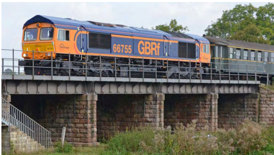
below 66755 crossing the River Nene approaching Wansford