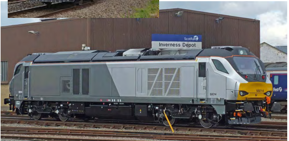
68014 has just re-fuelled, Inverness Depot, 24 th September 2014 can't be that long before the Chiltern liveried Cl.68s are not seen this far north