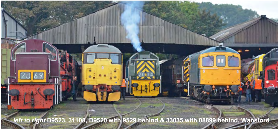
left to right D9523, 31108, D9520 with 9529 behind & 33035 with 08899 behind, Wansford

I attended on Sunday 28 th , but I think this gala was a bit of a struggle for the NVR as they were let down at the last minute by a few visiting locos, so had to rely on the resident ones. Don't get me wrong, still great to see them all running, but I think it suffered from the "seen it all before" camp. However there were 6 visiting locos, 3 from preserved lines and 3 from TOCs. There were not the crowds I have seen here before when there has been something different booked to run. That being said, it was very professionally run although the timetable had changed from the Thursday when I downloaded it! Good to see that GBRF also supported the gala, supplying brand new 66755 for the day.