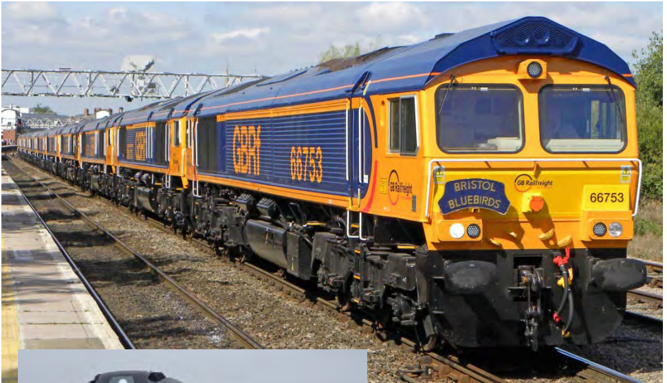
above 66753 hauling new 66757/58/65/59/60/62/61/64/63 Gloucester, 6 th September 2014