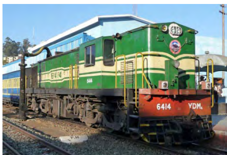
YDM-4 6414 appears to be taking water at Ooty. in fact the water crane is stuck in that position but looks good for the photograph! 27 th February 2013