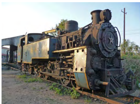
37384 and 37391 rest at Mettupalayam shed, 27 th February 2013

We continued, by coach to Coonoor, The depot, One steam locomotive was plinthed outside the station, 3 steam were on shed and 4 class YDM-4 diesels. So on to our hotel in Ooty.