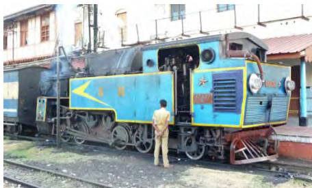
37397 takes water before propelling its packed train to Udagamandalam (Ooty) 27 th February 2013