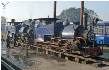
B class locomotives 780 WANDERER and 792 HAWKEYE being prepared for the day's work Siliguri Junction, 21 st February 2013