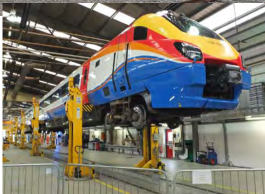
right 222104 up on the jacks