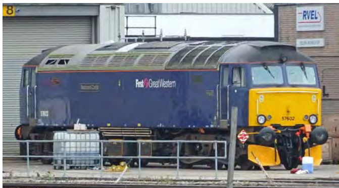
left 57602 'Restormel Castle'

We had a limited view out of the shed past 158770 but it was only about a 30 yard 'walk' if something caught our eye. This was a particularly good spot for those interested in test vehicles as the day was a bonanza as not only were there various stored vehicles but 3 test trains arrived. In order these were 73201 + 9523 + 999602 + ? + 73119, 37609 + 6264 + 999606 + 997983 + 9703 + 37608 and 31233 + 977986 + 977985 + 62384 + 9708. The NR yellow 08417 was pottering about early on and dragged the 73s test train away. As mentioned the 37s test train stopped with 37609 alongside 37670.