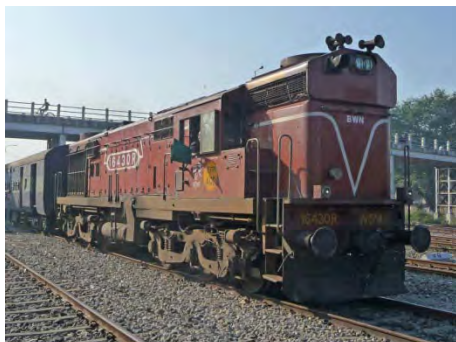
class WDM-2 16430 departs from Siliguri Jct with a passenger train, 21 st February 2013