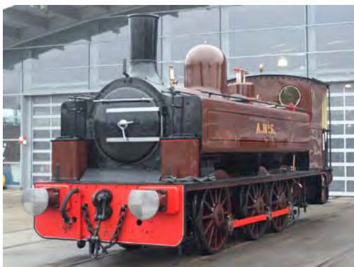
A.No.5 0-6-0PT NRS 18 th September 2014

Apart from the usual exhibits several local locos had been brought in for the Gala. These were the replica 'Rocket' from NRM York (which had yet to arrive), 2 [2859] 0-4-0ST RW Hawthorn & Leslie built 1911 from the Tanfield Railway, recently overhauled A.No.5 [2509] 0-6-0PT Kitson built 1881 from the Stephenson Railway Museum, 'Bellerophon' 0-6-0WT Haydock Foundry built 1874 and 20 [1435] 0-4-0 originally Sharp Stuart built 1863 for the Furnace Railway.