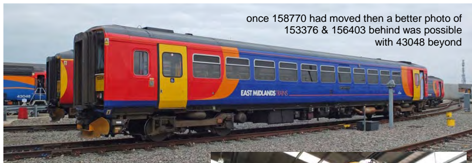
once 158770 had moved then a better photo of 153376 & 156403 behind was possible with 43048 beyond