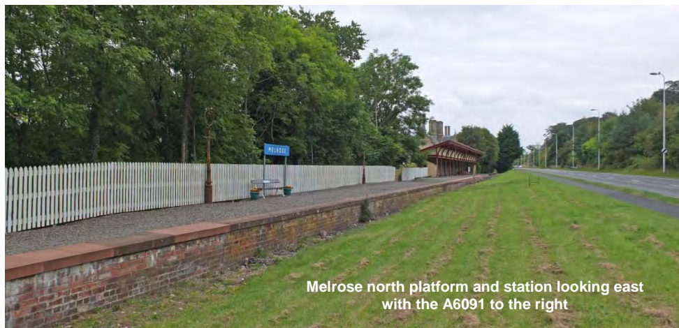
Melrose north platform and station looking east with the A6091 to the right

One interesting postscript however is that just beyond the terminus of Tweedbank, which is a new station on a new site east of Galashiels is Melrose station, which closed on 6 th January 1969 but largely survives. It is 1 ½ miles east of Galashiels and was one of the few stations that managed to stay intact until listed category A in 1981. Unfortunately it was too late to save the south platform, goods shed and yard which were demolished by the building of the A6091 Melrose bypass finished in 1987. The bypass runs parallel to the Waverley trackbed from Tweedbank to Melrose and on part of it further east. Restoration of the station building finished in 1986 and is used by various small businesses. The north platform remains and in 2010 a group was set up to bring trains back to the station as an extension the Borders Railway beyond Tweedbank. They repaired the platform and installed replica signs and a bench. The next aim is to lay a short section of track, funds permitting.