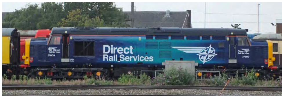
37609 in the CI.68 revised DRS corporate livery

There were two namings associated with the event. Prior to the day, 08899 had been painted in Midland crimson lake maroon and named 'Midland Counties Railway 1839-2014'. On the day meridian 222008 was named 'Derby Etches Park'. 08899 was positioned nicely to photograph the nameplate, but that on 222008 was a bit high (see STOCK CHANGES ).