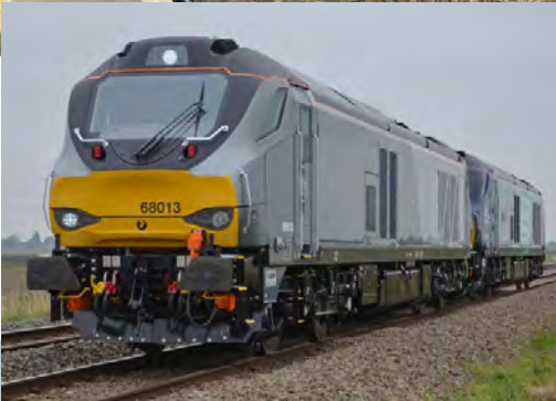
left 68013 + 68009 Turves LX, 17 th September 2014 (Colin Pottle)