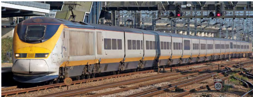
bottom 60059 Winwick 8 th September 2014 (Roger Taylor)