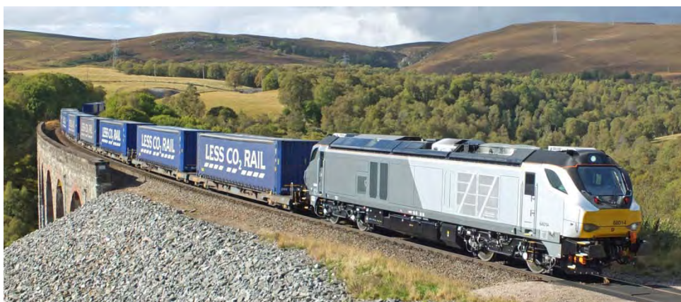
68014 southbound over Slochd Viaduct 24 th September 2014