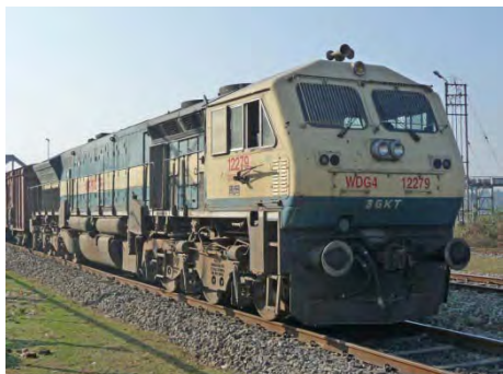
WDG-4 12279 is at the head of a freight passing Siliguri Junction, 21 st February 2013