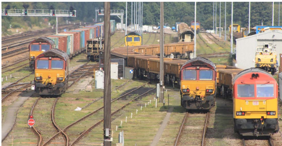
a busy Eastleigh East Yard with 66187 on a Wakefield – Southampton liner passing 66140, 66519, 66106 & 60091 plus a further DBS Cl.66 in the background, 12 th September 2014