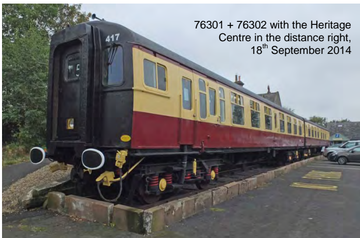
76301 + 76302 with the Heritage Centre in the distance right, 18 th September 2014

The Heritage Centre relocated to the site in 2000 with the building constructed to the east of the yard. All that remains is the station house and the north platform alongside which in 2010 two CI.438/491 4-TC DTSO vehicles from set 417 (8017) 76301 and 76302 were placed on a section of track. Both have been painted in BR carmine and cream and retain the set number 417 on each end. Car 76302 is now in use as Carriages Tea Room accessed from the platform and 76301 is part of the Heritage Centre Museum accessible only from through the tea room and for which there is a charge. The museum does include a display on the BCR.