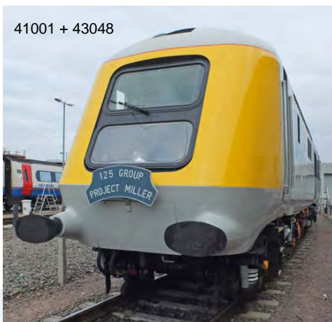
41001 + 43048