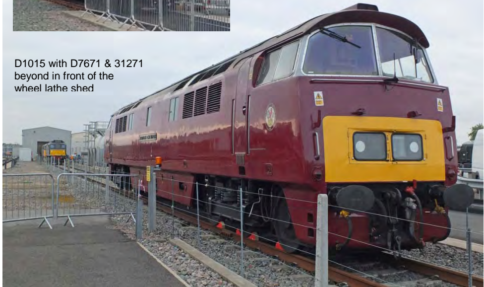
D1015 with D7671 & 31271 beyond in front of the wheel lathe shed