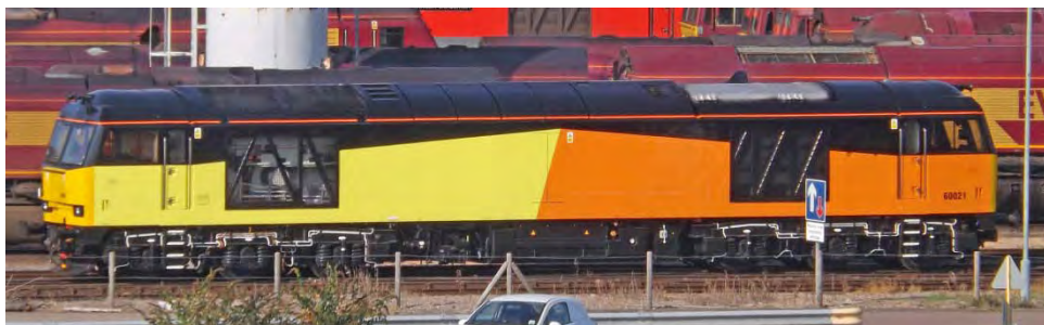
Colas Rail Freight livery continues to spread with 60021 ( above ) the second CI.60 so adorned, prior to decals being applied, Toton, 21 st September and ( below ) 37175 + 56096 + 37219 Water Orton, 8 th September 2014