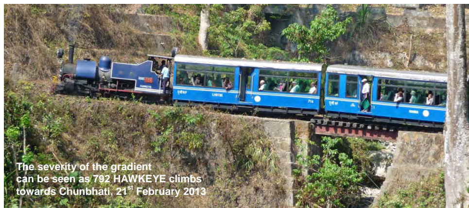
The severity of the gradient can be seen as 792 HAWKEYE climbs towards Chunbhati, 21 st February 2013

February 21 st 2013: Before returning to the station for our charter to Chunbhati, which is as far as we can go due to the line being severed, we visited the DHR loco depot. 2 diesels and 3 steam were present. 2 of the steam were in steam including 792 HAWKEYE which once again was to be our haul. We had time to photograph trains on the main line passing through Siliguri Junction before departing.