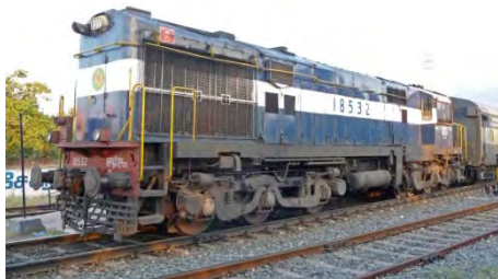
WDM-2. 18532 having arrived at Mettupalayam Junction waits to split and shunt its train into the sidings before the return working to Chennai 27 th February 2013