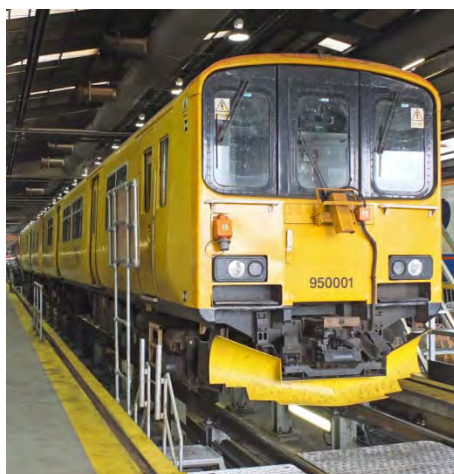
50044 and 950001 inside the main shed