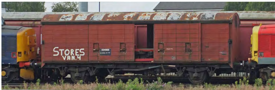
above internal user ZRA 024988