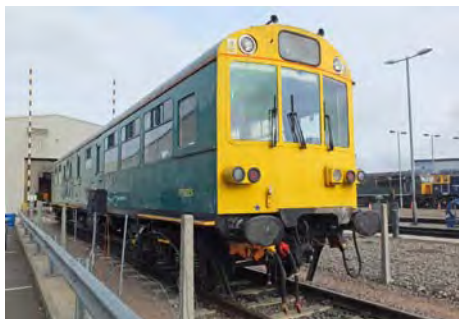
975025 'Caroline' in front of the wheel lathe shed with 47843 & 56312 behind