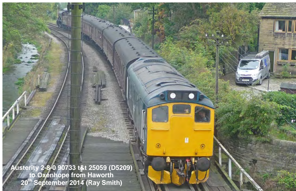
Austerity 2-8-0 90733 t&t 25059 (D5209) to Oxenhope from Haworth 20 th September 2014