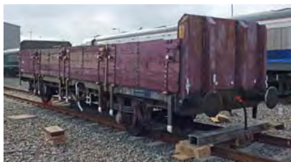
below OBS 110443 with one axle derailed