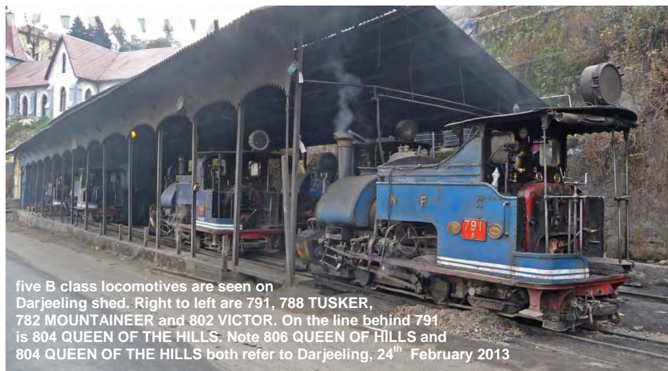
five B class locomotives are seen on Darjeeling shed. Right to left are 791, 788 TUSKER, 782 MOUNTAINEER and 802 VICTOR. On the line behind 791 is 804 QUEEN OF THE HILLS. Note 806 QUEEN OF HILLS and 804 QUEEN OF THE HILLS both refer to Darjeeling, 24 th February 2013

A trip to the station saw diesel 602 and in the shed on the other side of the road were B class 782 MOUNTAINEER, 788 TUSKER, 791, 802 VICTOR and 804 QUEEN OF THE HILLS.