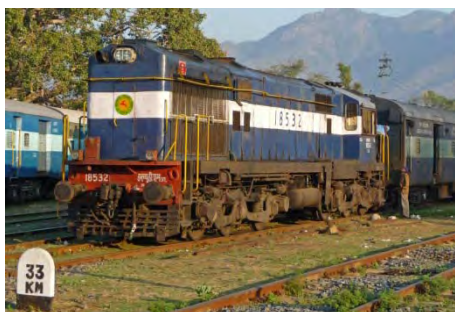
18532 completes shunting its stock into the carriage sidings at Mettupalayam Junction 27 th February 2013