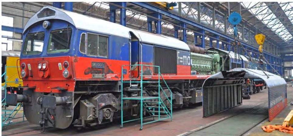
37688 stabled with the UTU2 Test Train (6262, 62287, 9702) on the 16 th (see photo below left).

HN orange 20311 + 20314 arrived from Barrow Hill on the evening of 13 th with 59003 which had come from Germany via Immingham. 59003 is to be returned to UK spec and repainted into GBRF livery and by the 15 th was inside (see photo below). The 20s stabled in the holding sidings at the station overnight and returned to Barrow Hill the following morning.