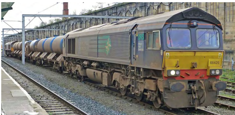
having run from Carlisle to Preston then back up the S&C, 66426 t&t 66434 arrived in Carlisle at 13.08 on the 8 th October 2014 with FEAs 642008/021/034 to allow TransPennine 350404 to pass with a Manchester Airport to Glasgow working at 13.10 (Gordon Kirkby) FEA 642021 is shown in more detail opposite top