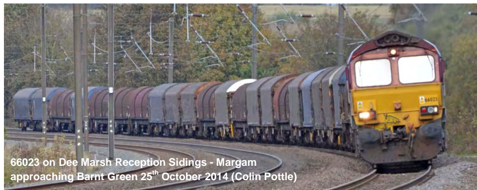
66023 on Dee Marsh Reception Sidings - Margam approaching Barnt Green 25 th October 2014