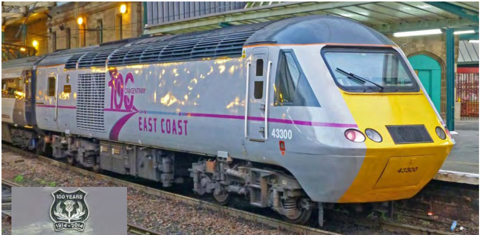
above 43300 has received embellishments to celebrate 100 years of Craigentiny Depot including a new crest above the nameplate (see inset), seen on ECML diversion Edinburgh to Newcastle, Carlisle, 07.36 28 th August 2014

This section will endeavour to show all new liveries / variations or those existing ones where not carried on the stock before. Liveries that become 'extinct' will also be covered. As with names, it may take a while after the livery application before a photo is sourced from members.