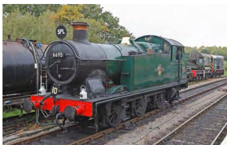
0-6-2T 6695 between turns at Norden (12.59)

Hunslet Engine Company loco 0-4-0 'Cloister' originally built for the Dinorwic State Quarry at Llanberis and now owned by the Hampshire Narrow Gauge Railway trust was in use on the Purbeck Mineral and Mining Museum track adjacent to Norden station and was providing Driver Experience opportunities throughout the weekend (see photo right)