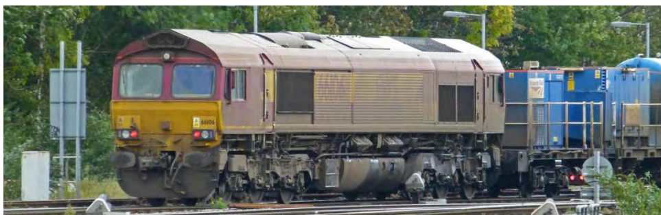
66106 on the rear of RHTT (66135 leading) returning to Barton Hill, Bristol Temple Meads 23 rd October 2014