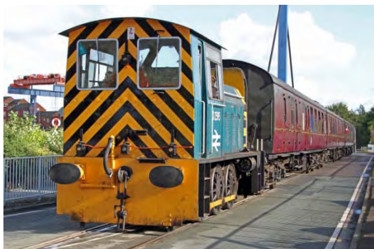
trains running over the Ashton Swing Bridge

Just across the road from Strand Road is the boundary between The Ribble Steam Railway and Network Rail. The line runs for a further half a mile where it then joins the main network at Preston South Jct.