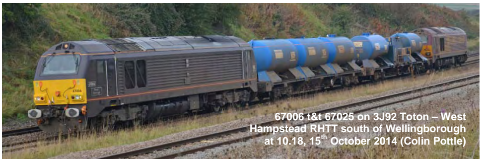
67006 t&t 67025 on 3J92 Toton – West Hampstead RHTT south of Wellingborough at 10.18, 15 th October 2014 (Colin Pottle)