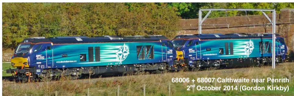
68006 + 68007 Calthwaite near Penrith 2 nd October 2014 (Gordon Kirkby)