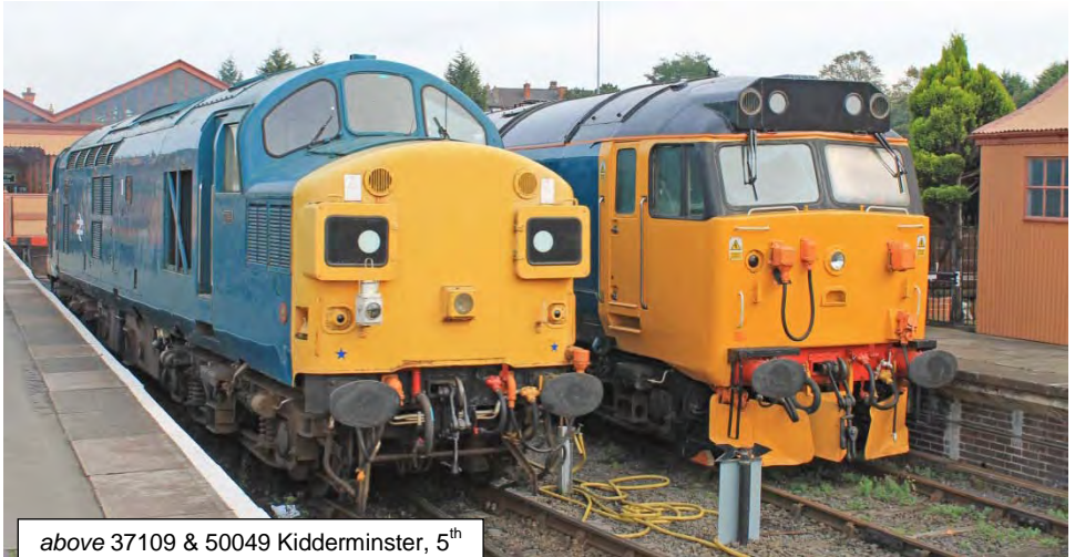
above 37109 & 50049 Kidderminster, 5 th October 2014 below 40106 Bridgnorth, 4 th October 2014

This was the first time I had visited the Severn Valley Railway. Due to work constraints I went on the Friday and it was probably just as well because the weather was due to change on Saturday. It turned out to be a reasonable day with the sun occasionally making an appearance. What really struck me was the amount of people there. All the trains were full, just trying to get photographs from the station platforms became a full time job, jostling for position! The price of £21 for an 'all day' rover was reasonable enough and in line with all the other galas I've visited this year.