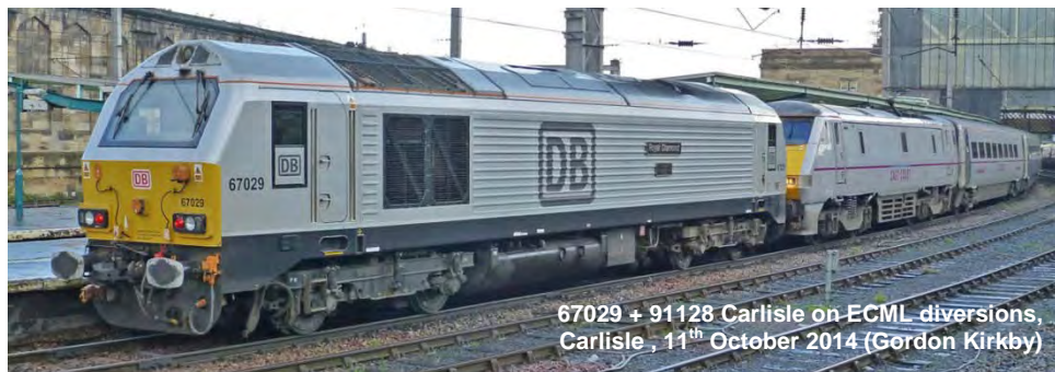
67029 + 91128 Carlisle on ECML diversions, Carlisle, 11 th October 2014