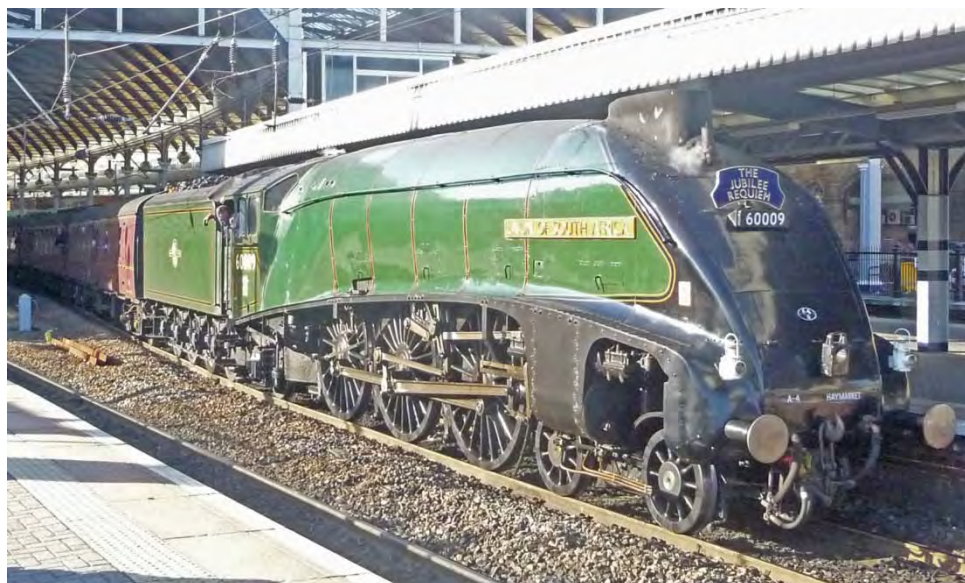
60009 'Union of South Africa' arrived into Newcastle Central with 1Z82 The Jubilee Requiem from King's Cross at 14.40, 25 th October 2014 (Ray Smith)