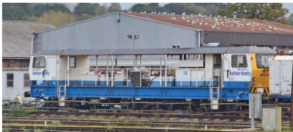
above DR 72213 Eastleigh, 24 th October 2014