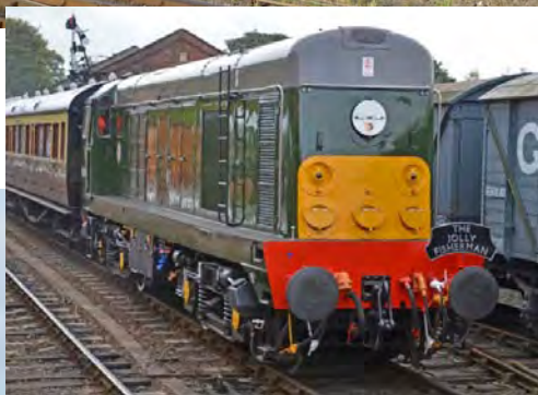
left D8059 with the 11.16 arrival from Kidderminster, Bewdley, 3 rd October 2014)