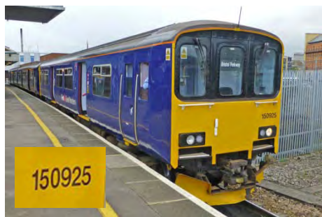
above 150925 (52125) & opp top 150926 (57126) Bristol Temple Meads 23 rd October 2014

DEMU: 220007 is formed with 60885 from set 221135 in place of fire damaged 60207