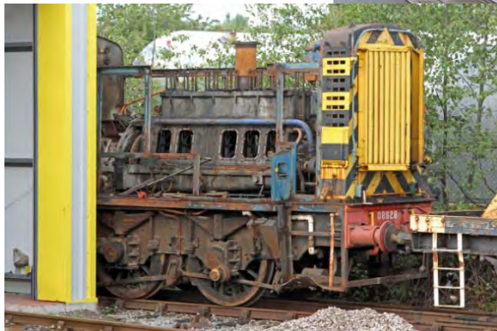
left 08628 which arrived in 2011 much the worse for wear...and doesn't look much better now !!