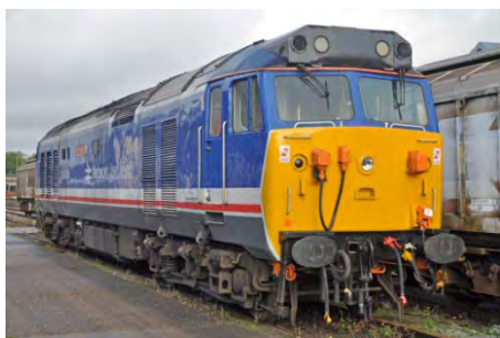
56301 arrived with 50026 from SVR on the 15 th , the 56 departing later the same evening (see photo of 50026 above right taken on the 16 th ).