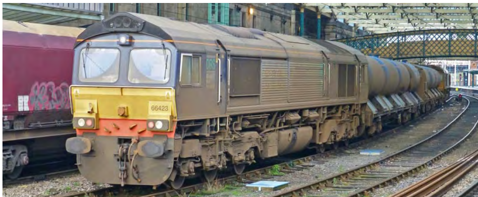
66428 t&t 66423 awaiting a path to Kingmoor Depot at 09.23, 18 th October 2014