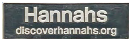
43017 Bristol Temple Meads, 23 rd October 2014 (as reported in July 2014 issue)

Nameplates Not Previously Illustrated (applied since 2013):