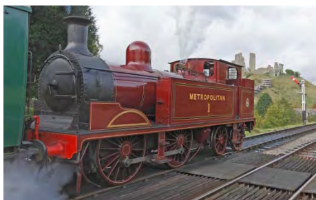
0-4-4TNo1 awaits departure from Corfe Castle with the 10.30 from Swanage to Norden (11.04)