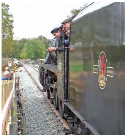
45337 at Corwen, 28 th October 2014

behind 45337 which arrived at Corwen at 11.30 with the 10.50 service from Llangollen. It only remained at Corwen for 7 minutes, then the train was propelled back by the Black 5 to Carrog where it then ran round before returning to Llangollen. Corwen Station is just east of the village between the River Dee and the A5 and at the moment has just a basic scaffold framed platform with no run round facilities. Further services will operate on the 8/9 th November and at Christmas with a formal opening ceremony on the 1 st March 2015 prior to a full operating season.