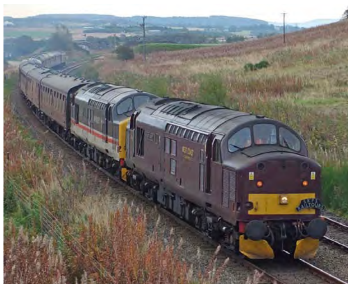
left 37516 + 37518 t&t 57313 on an SRPS railtour approaching Keith, 5 th October 2014