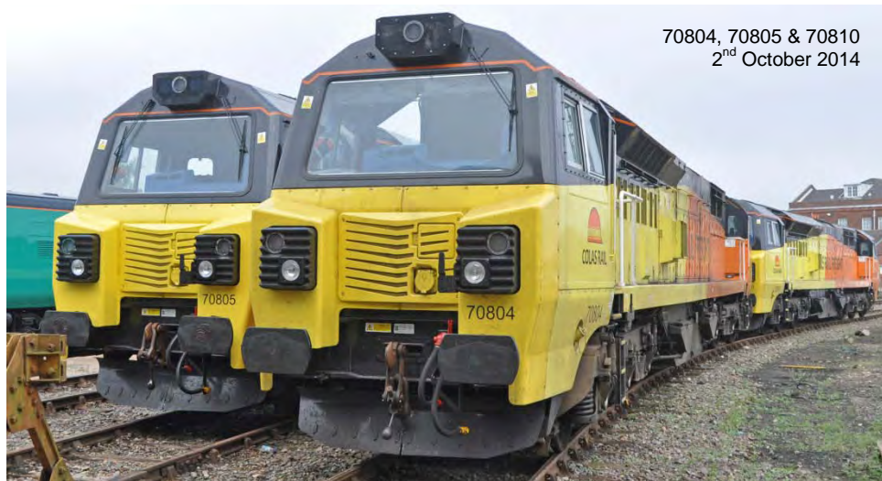
70804, 70805 & 70810 2 nd October 2014

General: The Diesel Running Shed has had its new roller shutter door installed and has been in regular use with 66850, 70801, 70804, 70805, 70810, 73212 and 73213 all visiting during the month.