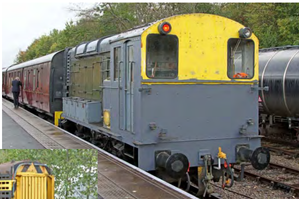
right Dutch 663 [2160] EE 0-6-0DE formerly named 'Annette', Riverside Station