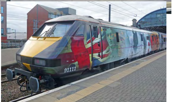
right Newcastle 24 th October 2014

91111 has received a commemorative livery to honour those who fought in WWI and named 'For the Fallen'