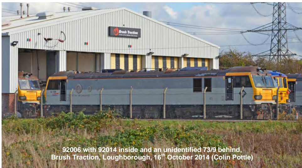
92006 with 92014 inside and an unidentified 73/9 behind, Brush Traction, Loughborough, 16 th October 2014 (Colin Pottle)

The Norwich – Lowestoft loco hauled set has been out of use for about a month due to a loco hauled restriction on Acle bridge east of Norwich. However, it was reintroduced in the third week of October due to the serious shortage of units as apparently 10 of the NC sets were out of use at one time. The set locos were 47813 and 47853 on the 15 th but this was changed by the 20 th to 47805 and 47828 when 47805 failed on the set and was replaced by 47818 which had arrived on the 24 th with a replacement coach. There is now an Anglia liveried Mk2 in the middle of the set. Whilst Acle bridge is of limits, the loco hauled set has been diverted via Reedham with the Acle portions taken over by road coaches.