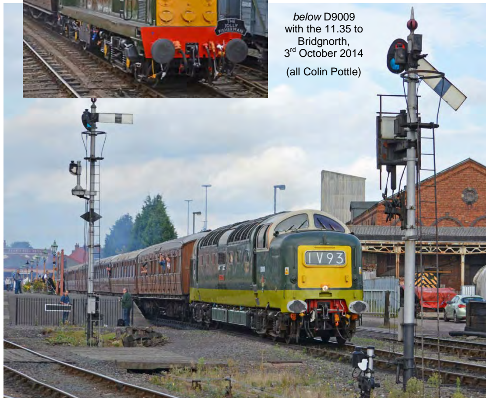
below D9009 with the 11.35 to Bridgnorth, 3 rd October 2014