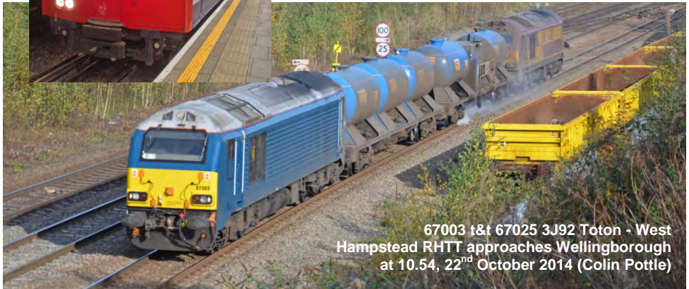
67003 t&t 67025 3J92 Toton - West Hampstead RHTT approaches Wellingborough at 10.54, 22 nd October 2014