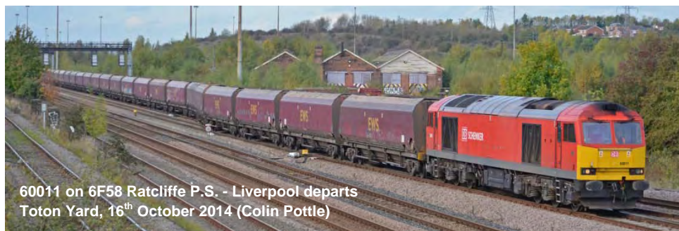
60011 on 6F58 Ratcliffe P.S. - Liverpool departs Toton Yard, 16 th October 2014 (Colin Pottle)