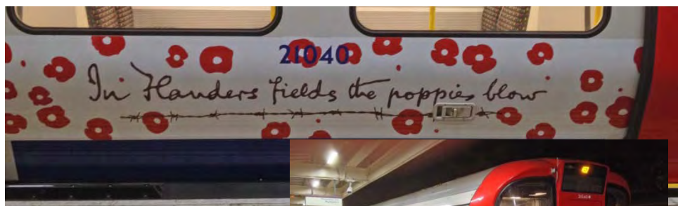
above & right LU 'S' stock 21040 with a commemorative poppy livery to mark WWI, Watford 20 th October 2014 (Colin Pottle)