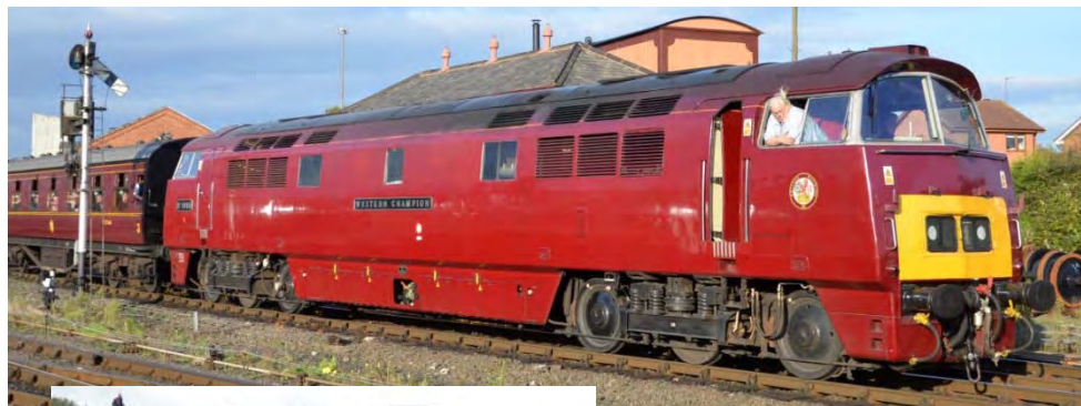
above D1015 with the 17.01 to Bridgnorth, Kidderminster, 3 rd October 2014)

The home fleet consisted of D3201, 12099, D8059, D1062 and a CI.108 DMU 50933 + 52064 with 50049 on display at Kidderminster. The visiting locos were 37109, 40106, 50015, 50026, D1015 D9009 & 55019. This made for an impressive line up of varied traction. Also impressive was the timetable which started just before 09.00 and continued through until after 22.00.