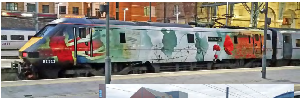
above King's Cross 25 th October 2014

91111 has received a commemorative livery to honour those who fought in WWI and named 'For the Fallen'