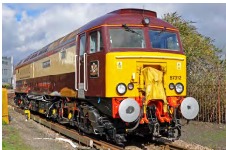
57312, repainted in Northern Belle livery last month, departed on the 20 th following completion of engine repairs (see photo above right with nameplate & crest compared to photo in Oct issue).