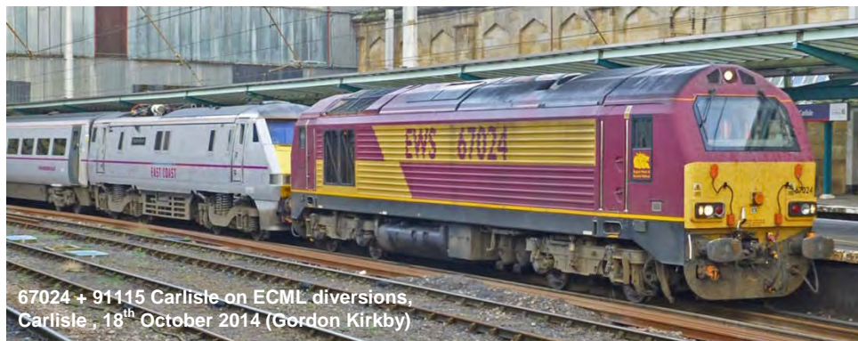
67024 + 91115 Carlisle on ECML diversions, Carlisle, 18 th October 2014