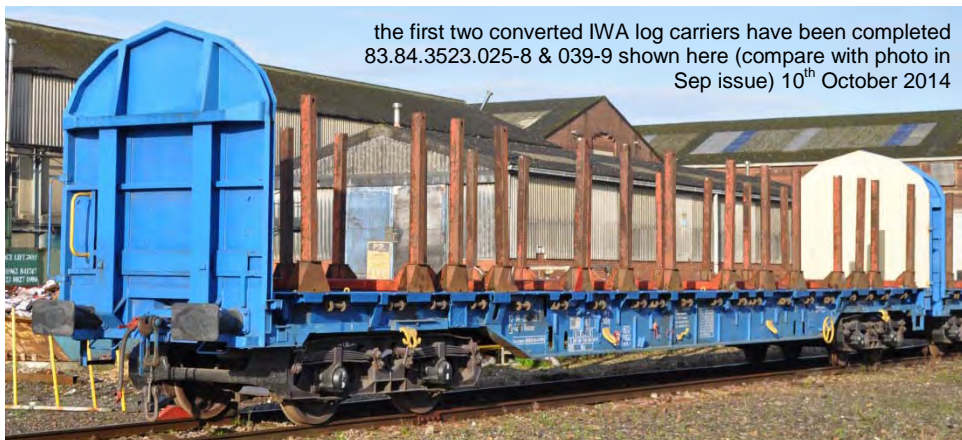
the first two converted IWA log carriers have been completed 83.84.3523.025-8 & 039-9 shown here (compare with photo in Sep issue) 10 th October 2014

66956 was Maritime trip loco on 22 nd , arriving with 608069, 608032, 640127, 640128, 608025, 608026, 608184, 608183, 608282, 608542.