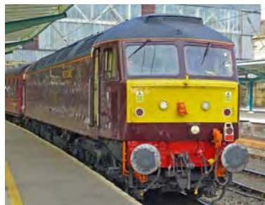
above left 66434 having lost its unique former Malcolm Logistics livery has received a simplified livery similar to 90034, Carlisle, 8 th October 2014 above right following transfer from DRS, 47832 was quickly repaired by WCR and had its Northern Belle livery replaced in favour of standard WCR maroon livery, Carlisle, 18 th October 2014