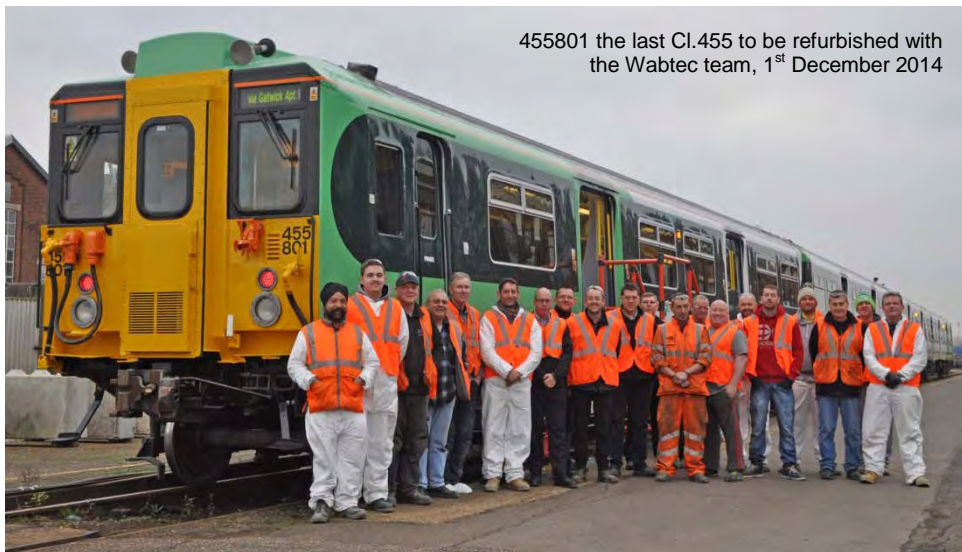
455801 the last CI.455 to be refurbished with the Wabtec team, 1 st December 2014