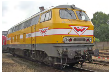
right Wiebe ex DB class 216 Bremen Works, 14 th June 2014

Frequent freight services from Bremerhaven docks also pass through the station and, that evening, an eclectic mix of DB, SBB (Swiss) and privately owned locomotives were present, including one of the very new Siemens Vectrons, a first for me.