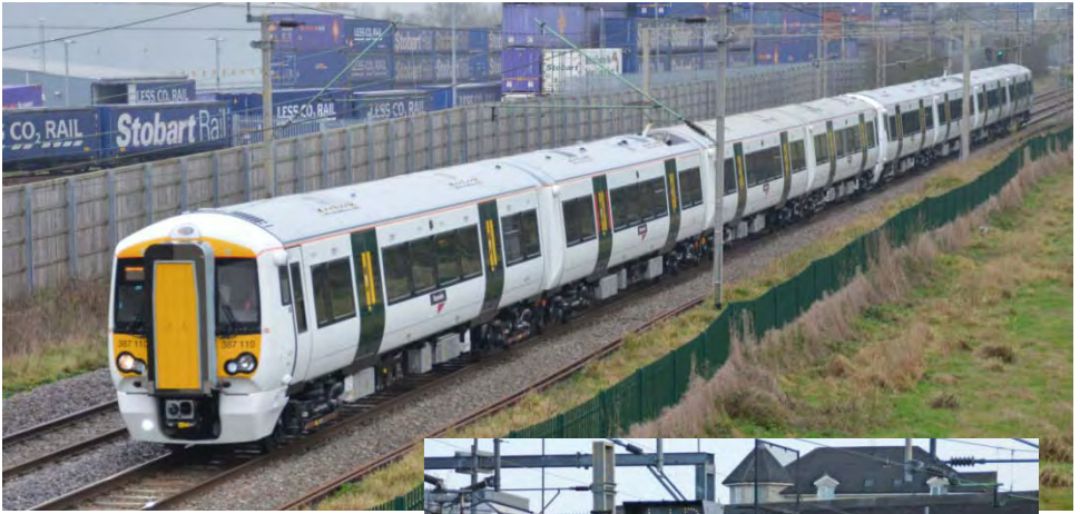
CI.387s in interim Thameslink livery have been on test along the WCML right 387105 + 387107 + 387106 passing Nuneaton at 14.45 on 10 th November 2014 above 387110 + 387111 passing Daventry Railfreight Terminal at 11.36 on 18 th November 2014