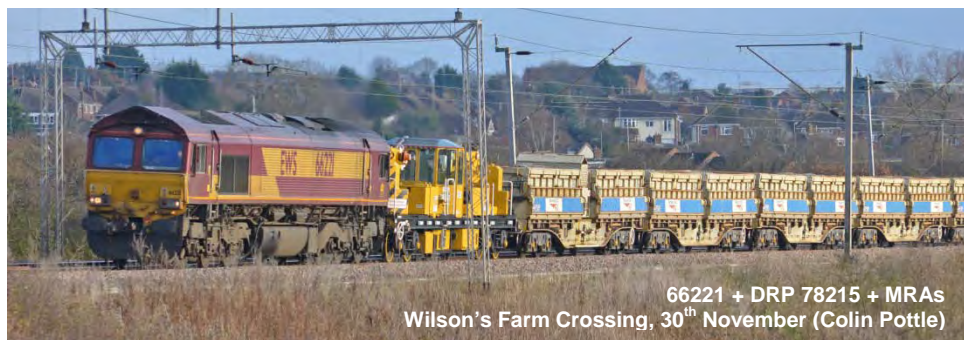
66221 + DRP 78215 + MRAs Wilson's Farm Crossing, 30 th November