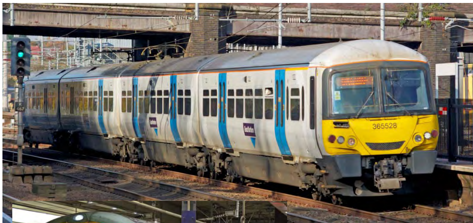
above 365528 in the interim white TS&GN livery, on 11.30 Cambridge – King's Cross, 18 th November 2014 Alexandra Palace

Following the start of the TS&GN franchise all ex-FCC rolling stock is being re-branded with either Great Northern as with 365528 on the interim white TS&GN livery or Thameslink as on 377208, which was transferred from Southern so still in that livery and 319373 again on interim white livery.