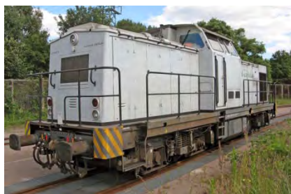
Oak Capital 203007, ex DR 202718, Hamburg Waltershof, 16 th June 2014