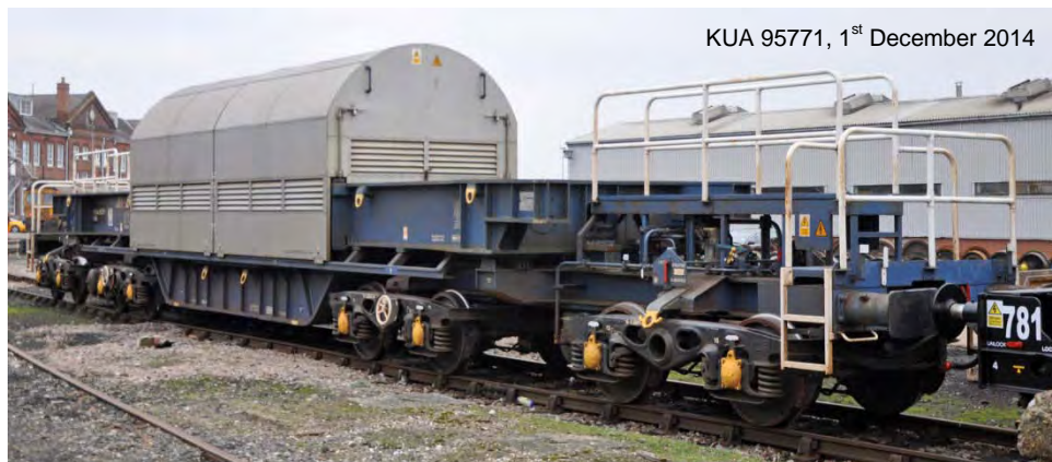
KUA 95771, 1 st December 2014

Wagons: 70803 arrived on the 11 th with KHA wagons from France 33.87.4908.605-8/603-3/623-1/611-6/604-1/612-4/625-6/628-0/615-7 and 632-2. These wagons are on hire to STVA and are here for conversion to car carriers by the addition of special frames fitted on top of the wagons.