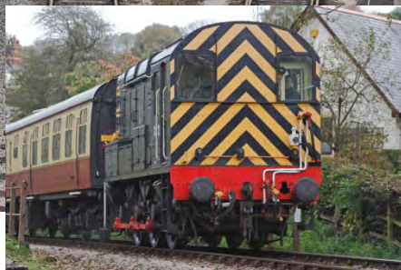
above D3721 arriving at Buckfastleigh at 14.15 left D7535 'Mercury' (see nameplate below) departing Buckfastleigh at 14.25