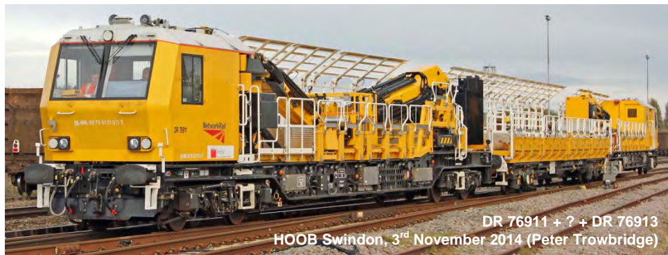
DR 76911 + ? + DR 76913 HOOB Swindon, 3 rd November 2014