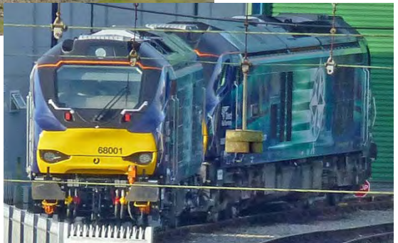
right out in the sun 68001 along with 68007 was seen outside DRS Carlisle Kingmoor Depot 7 th November 2014 (Gordon Kirkby)