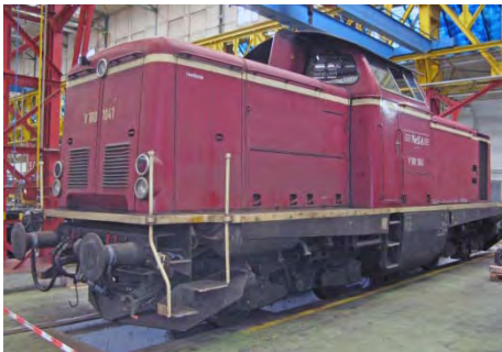
NeSA V100 ex DB 211 041 Bremen Works, 14 th June 2014

Some calls en route were planned and the first was at Bad Bentheim where our arrival was greeted by a colourful Bentheimer Eisenbahn D20 (see above) slowly pulling a long line of containers through the old station, one of which promptly split a set of points and derailed amid clouds of dust! (see above) Perhaps there is something in this Friday 13 th superstition after all! After the ritual taking of photographs we left the staff wondering how to resolve the problem and headed for Emden then Bremen to find our hotel next to the Hauptbahnhof.