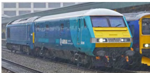
left the one remaining converted ex-Virgin DVT not so far illustrated is 82306 in ATW livery as seen in the pouring rain at Cardiff with 67002 24 th October 2014