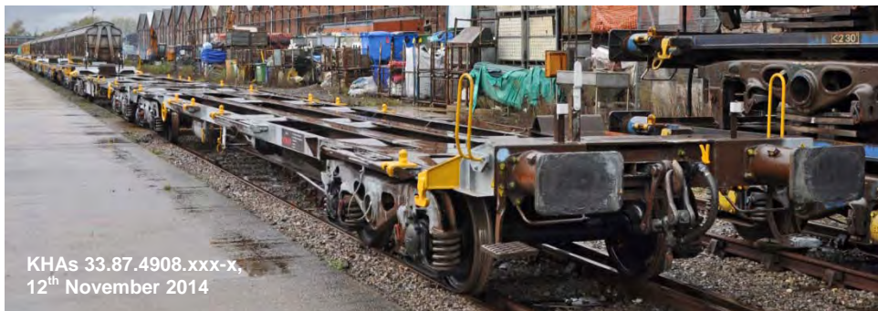
KHAs 33.87.4908.xxx-x, 12 th November 2014