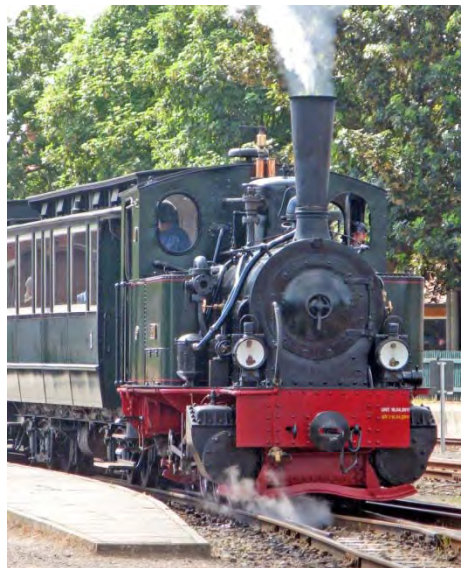
right DEV Hoya, Hannomag 3341 built 1899 departing Bruchhausen Vilsen for Asendorf, 14 th June 2014

Saturday 14 th June: Given the late morning start to the open day, we first of all headed via Bremen Bbf to the docks at Bremerhaven where several more SBB Cargo and Vectron locos were seen. It was time then to get to the works for a much anticipated visit that did not disappoint. It specialises in diesel loco maintenance, including complete rebuilding of engines for both locos and railcars, for both DB and the private sector. Rebuilding / refurbishment of complete locos for private owners is also carried out and many were present in various stages of work. As it was a public day, several demonstrations were being given outside as were rides in an old track trolley and a class 218 diesel.