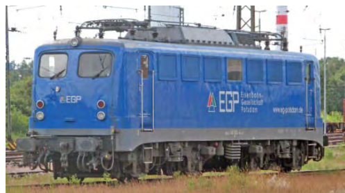
140824, now EGP, Hamburg Waltershof 16 th June 2014

Sunday 16 th June: The morning brought another sunny day and our first call was at the EVB depot in Bremervorde. This company still uses ex DB railbuses for local services and, although access was not possible, several were seen together with 15 of their freight locos. Maschen was next and we were given full access to the depot and storage area. The 130 plus locos on shed included several Danish locos from Green Cargo, two Polish and some from MEG (effectively a DB subsidiary) The storage area had many more, mainly classes 290/295, a heavy shunter, some class 363 shunters and several class 140, a medium powered freight loco from the 1960s which is now being phased out of service. A number of road closures complicated our subsequent drive around the various stabling points in the docks area where Altenwerder had the most variety with more Swiss, Austrian and Polish locos present alongside others from several private owners. [p11 & 12] The final call for the day was at the museum based in the former shed at Ahmühle. An open day was also in progress here and some of the narrow gauge exhibits were in use. Our hotel for the evening was near Altona station so we were able to see the variety of locos used by NordOstseeBahn, including one of the 12 MaK Co Co's built for Danish Railways but now owned, maintained and hired out by the builder.