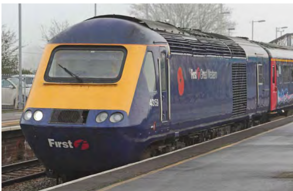
left 100 FGW HST power cars received large poppies to commemorative Armistice Day and 100 years since the start of WWI as with 43159 at Severn Tunnel Jnct on 1Z05 Paddington - Cardiff 15 th November 2014