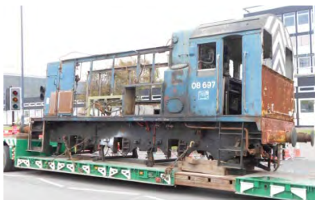
the shell of 08697 seen outside Derby RVEL 28 th October 2014

CF Booths, Rotherham 37696 Wards Recycling, Ilkeston 08697