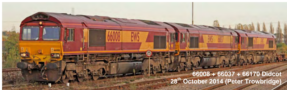
66008 + 66037 + 66170 Didcot 28 th October 2014