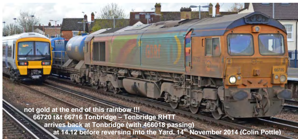
not gold at the end of this rainbow !!! 66720 t&t 66716 Tonbridge – Tonbridge RHTT arrives back at Tonbridge (with 466018 passing) at 14.12 before reversing into the Yard, 14 th November 2014 (Colin Pottle)