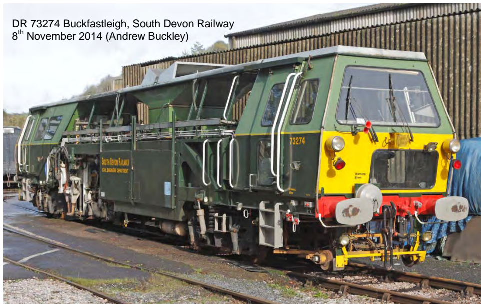
DR 73274 Buckfastleigh, South Devon Railway 8 th November 2014