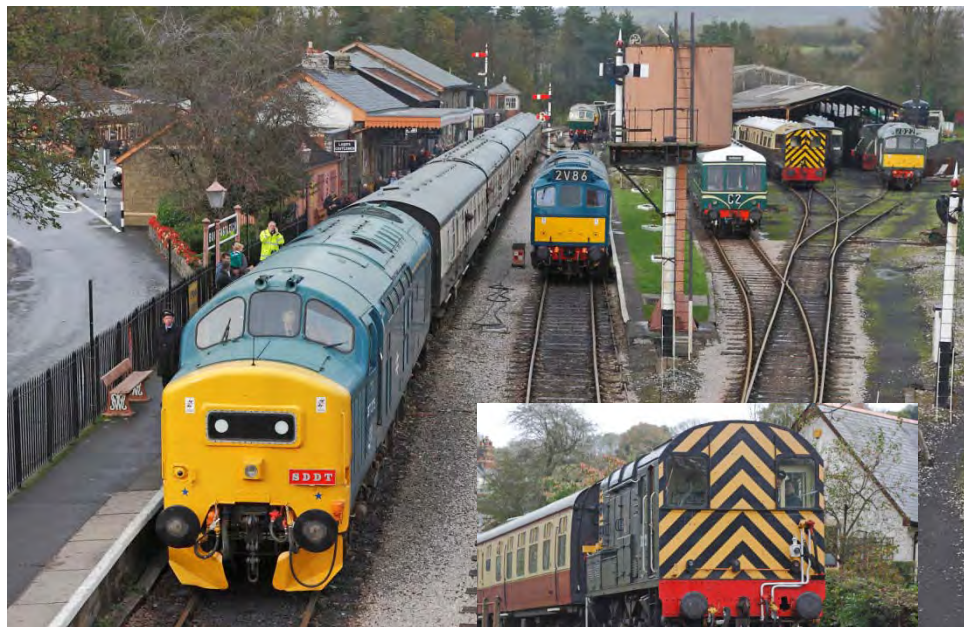
above the scene at Buckfastleigh at 13.35 with (left to right) 37275, D7535 with D6501 beyond, 55001, D2246 & D7612

The South Devon Railway Autumn Diesel Gala took place over the weekend of Friday 7 th – Sunday 9 th November 2014. I attended on the Saturday and had hoped to arrive in time for the 10.52 departure from Totnes. However my connecting HST service at Bath was delayed by 22 minutes because of what was announced on board as being 'problems getting the train off the depot' !!! On balance and given yet another atrocious weather forecast, the late arrival meant the quickly moving weather front had largely passed over. Though squally all was relatively calm along the seawall at Dawlish.