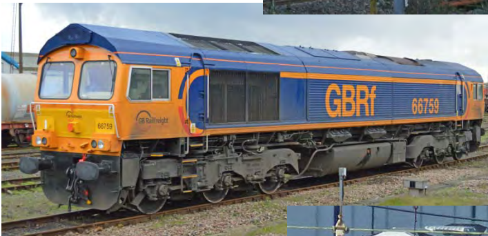
left 66759 Eastleigh, 18 th November 2014