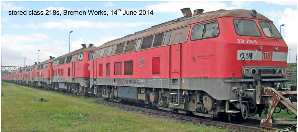
stored class 218s, Bremen Works, 14 th June 2014

Local passenger services around Bremen are mainly provided by two private companies, Metronom, using class 146 locos in push pull mode with double deck stock, and NordWestBahn, who purchased a number of new class 440 units when they won the franchise.