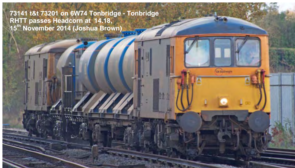
73141 t&t 73201 on 6W74 Tonbridge - Tonbridge RHTT passes Headcorn at 14.18, 15 th November 2014 (Joshua Brown)