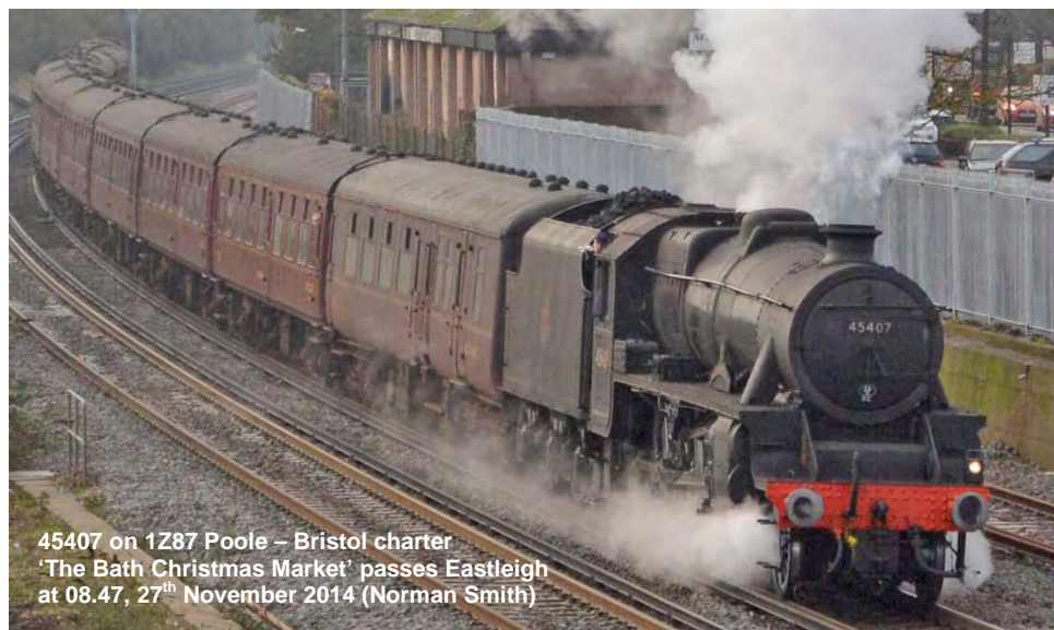
45407 on 1Z87 Poole – Bristol charter 'The Bath Christmas Market' passes Eastleigh at 08.47, 27 th November 2014