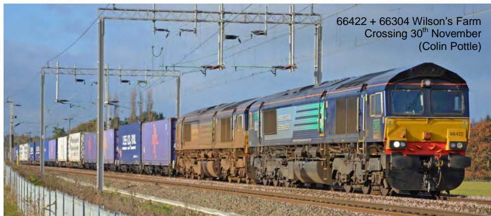
66422 + 66304 Wilson's Farm Crossing 30 th November (Colin Pottle)