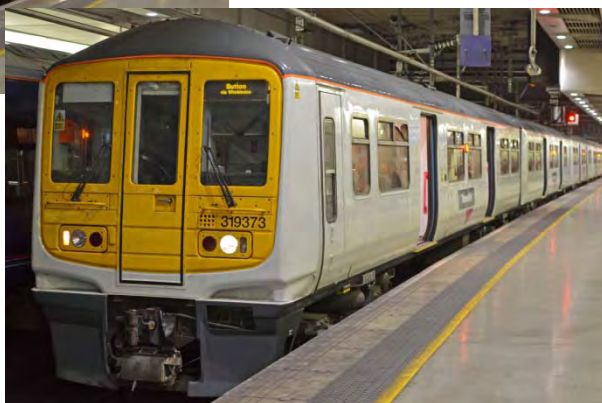
right 319373 St Pancras International 14 th November 2014