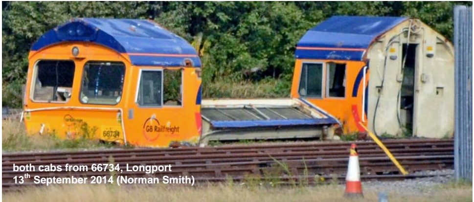
both cabs from 66734, Longport 13 th September 2014 (Norman Smith)

The following photos show the current stored remains of two rail accidents, the Lambrigg derailment of Pendolino 390033 on the 23 rd February 2007 and the Loch Treig derailment of 66734 on the 28 th June 2012.