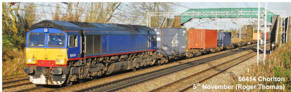
66414 Chorlton 5 th November