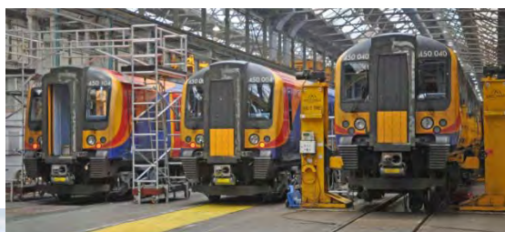
Units: Siemens have attended to 450041, 450082, 450099 and 450004 with 450104 and 450040 on site on the 1 st December.