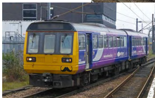
above & left 158792 & 142041 Doncaster, 29 th November 2014