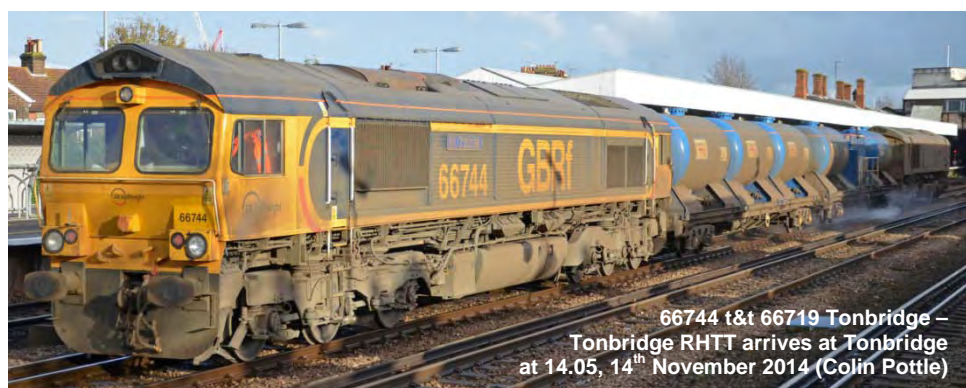
66744 t&t 66719 Tonbridge – Tonbridge RHTT arrives at Tonbridge at 14.05, 14 th November 2014