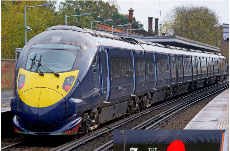
above 395014 on 1Z03 Victoria - Faversham 'The Victoria Cross' UK rail tour with leading car 39141 carrying its new name 'THE VICTORIA CROSS MMVIX' (inset right) and poppy decals on the nose valences Chislehurst, 15 th November 2014

This section will endeavour to show all new liveries / variations or those existing ones where not carried on the stock before. Liveries that become 'extinct' will also be covered. As with names, it may take a while after the livery application before a photo is sourced from members.