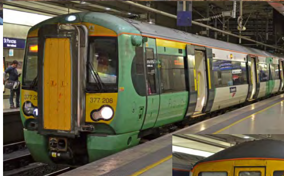
above 377208 St Pancras International 14 th November 2014 (Colin Pottle)