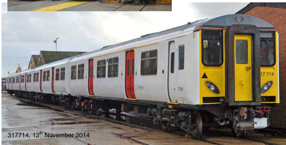
317714, 12 th November 2014

455821 was completed by Wabtec on the 12 th , departing on the 13 th and replaced on the 14 th by the last unit of this program, 455801 which was completed and on test on the 1 st December, with a planned departure that evening bringing to a close the 2 ½ year program (see photo above). 317714 arrived from Ilford on the 11 th behind 66703 and Translator set T7. This joins the other two 317s in warm storage.