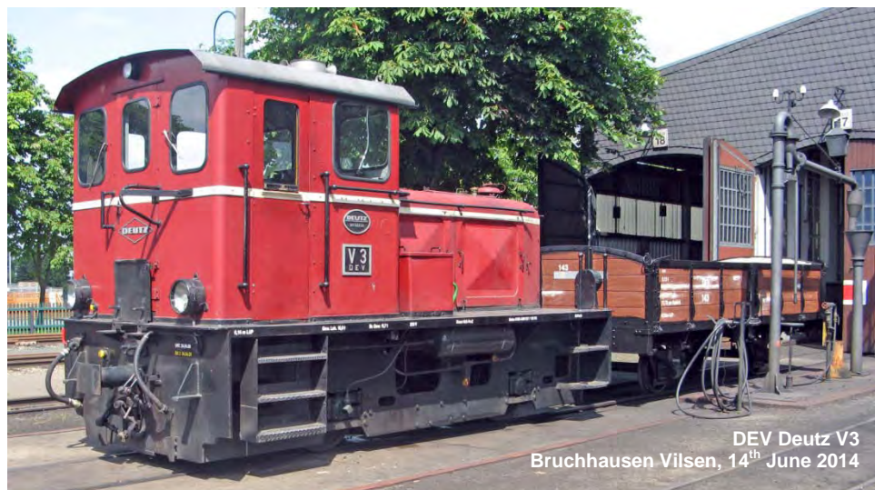
DEV Deutz V3 Bruchhausen Vilsen, 14 th June 2014

A few hours in the sunshine quickly went by, then it was ice cream time and off to Bruchhausen Vilsen to see the metre gauge steam operated line in action. This was one of the first preservation projects in Germany and it shows in the appearance of the locomotives, rolling stock and infrastructure.