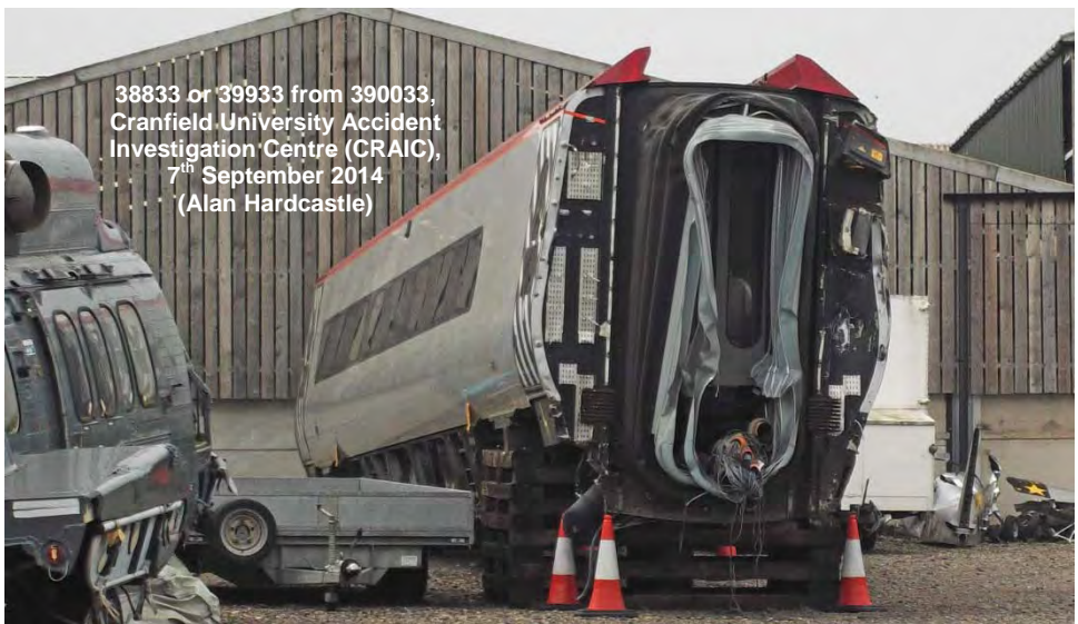
38833 or 39933 from 390033, Cranfield University Accident Investigation Centre (CRAIC), 7 th September 2014 (Alan Hardcastle)