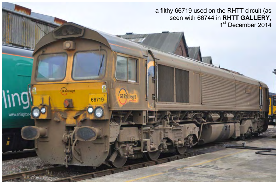
a filthy 66719 used on the RHTT circuit (as seen with 66744 in RHTT GALLERY , 1 st December 2014