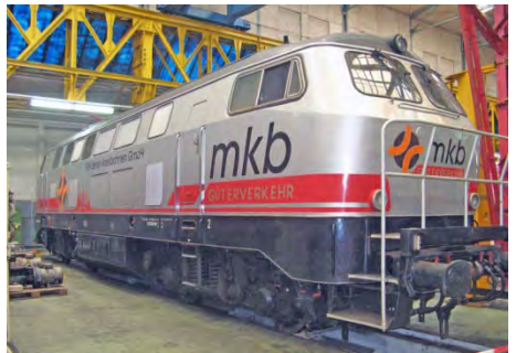
Mindener Kreisbahn V6, ex DB 216014 Bremen Works, 14 th June 2014