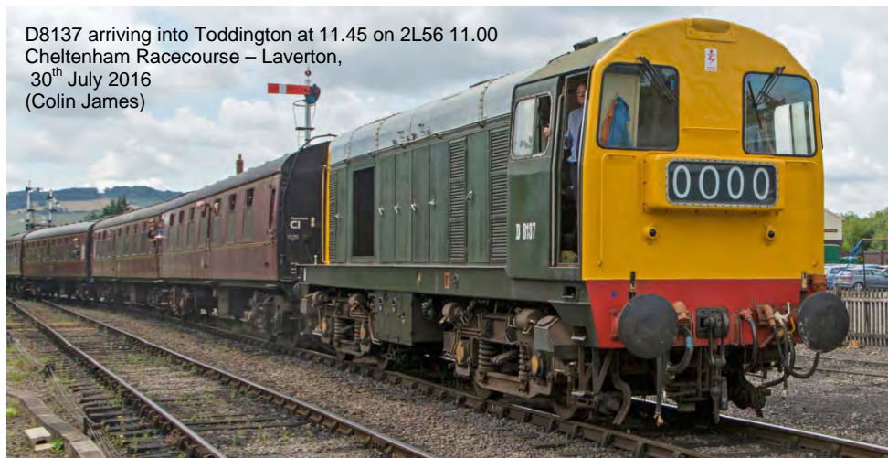
D8137 arriving into Toddington at 11.45 on 2L56 11.00 Cheltenham Racecourse – Laverton, 30 th July 2016

The home fleet consisting of D8137, 5081, D5343, 37215, D6948, 45149, 47376 and E6036 were joined by visiting D6575 (33057), courtesy of the D&EPG at the West Somerset Railway. Also in service was 3 car CI.117 DMU 51405 + 59510 + 51363 (L425).