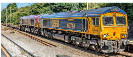
66714 + 66148 Wakefield Europort – Doncaster Belmont Yd (10.51)