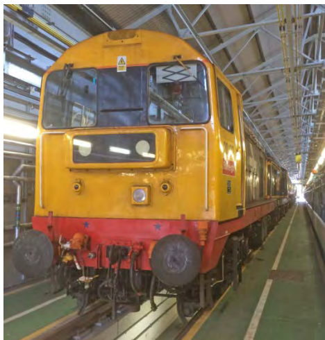
20132 + 20905 were seen inside Neasden Depot at 13.29.