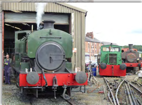
right 6 outside the shed at the start of the day with [3953] Hibberd 4wDM & u/d steam loco