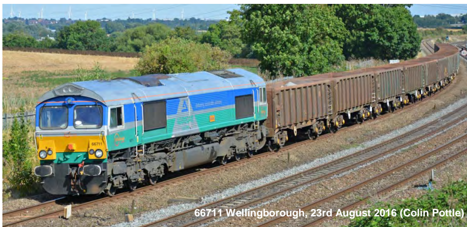
66711 Wellingborough, 23rd August 2016 (Colin Pottle)