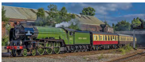
A rare but welcome visitor to the West Country, former LMS Princess Coronation pacific 4-6-2