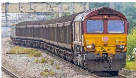
60031 Dollands Moor – Dittons Foundry & 66524 Bredbury – Runcorn waiting behind (11.55)