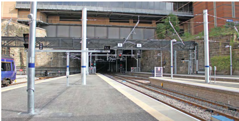
above looking north towards the tunnel, below looking south towards the concourse

Glasgow Queen Street re-opened on the 7 th August 2016 with extended platforms and electrification masts in place. The photos below were taken on the 30 th August by Iain Gardiner.