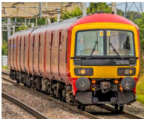
325001 Crewe – Warrington (15.55)