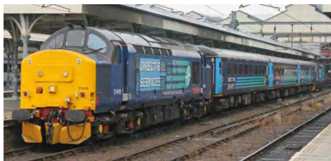
DR98014 + DR98012 + DR98013 passed Leamington Spa at 11.00.