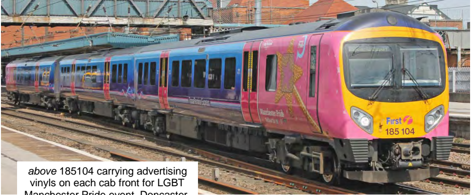
above 185104 carrying advertising vinyls on each cab front for LGBT Manchester Pride event, Doncaster, 23rd August 2016

This section will endeavour to show all new liveries / variations or those existing ones where not carried on the stock before. Liveries that become 'extinct' will also be covered. As with names, it may take a while after the livery application before a photo is sourced from members. New liveries may also be shown in other articles: D6948 in PRESERVATION GALAS & 47815, 66425 in EASTLEIGH WORKS REPORT .