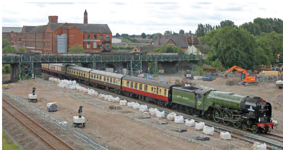
below looking south from near Millership Way towards Coronation Way road bridge with 60163 heading north at 12.25 13 th August 2016 (Rod Johnson)