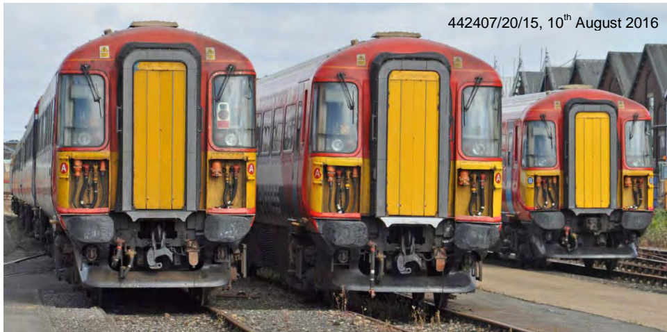
442407/20/15, 10 th August 2016

12/8 in 442403 from Stewarts Lane 37884 17/8 out 442423 Ely Papworth Sidings 47812 t&t 37884 (see TRAFFIC & TRACTION NEWS ) 31/8 out 442420 Ely Papworth Sidings 47815 (see photo at end)