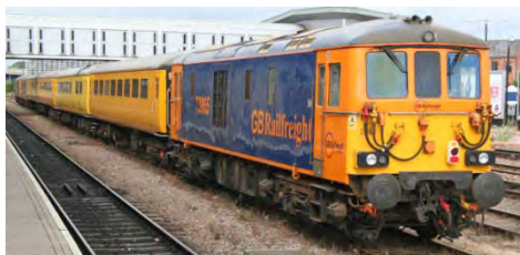
57603 + 17175 + 10225 + 12161 + 17173 was seen at Totnes at 14.05 on GWR summer Saturday's 2E75 1335 Plymouth - Exeter St David's.