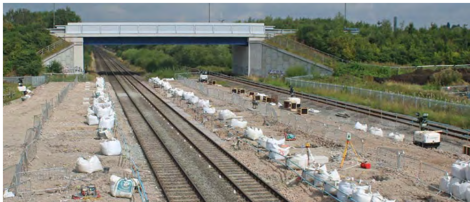
above looking north from Coronation Way, the road bridge is Millership Way which lies on the route (to the left) of former branch to Ilkeston Town, the site of which is occupied by a roundabout and Tesco superstore, 17 th August 2016

Therefore a new station is being constructed on the site of the former Ilkeston Jct & Cossall Station 1½ miles north of Trowell Jct and 3 miles south of Langley Mill. Planned to open in 2014 the construction has been plagued by problems, re-homing great crested newts, flood protection work and the stabilisation of old mine workings. Consequently opening has been delayed until autumn 2016. A service is initially planned to be operated by Northern.