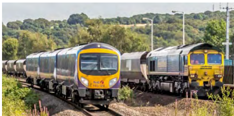
185128 Middlesborough – Manchester Airport & 66603 Ferrybridge PS – Fiddlers Ferry PS (14.05)