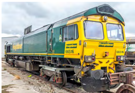
66516 on accommodation bogies (14.29)

08401, 47830, 66503/514/516/525/567/594/596 66603/616/617, 70003/004/014, 90041, 144004 158842