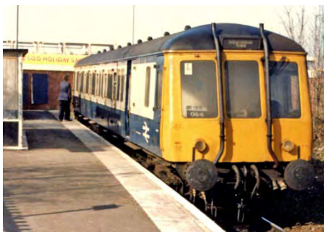
above CI.122 bubblecar 55004 Stourbridge Town 24 th February 1986

The southern access into Birmingham New Street was blocked on the 24 th February and I went up to Lifford Curve to photo the diversions via the Camp Hill line, a wonderful mix of CI.31 and 47 locos, sprinters and heritage DMUs of CIs.101,108, 116 and 117.