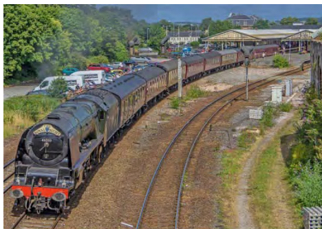
46233 'Duchess of Sutherland' was seen coasting through Newton Abbot at the head of 1Z37 08.48 Bristol TM to Par, "The Royal Duchy".