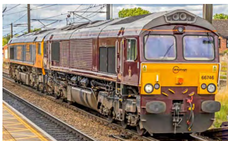
66746 + 66704 Tyne Coal Terminal – Doncaster ex-Royal Mail Terminal (14.13)