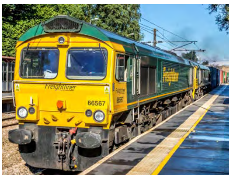
66567 + 66533 Leeds – Felixstowe North (09.25)

43207/208/238/277/302/303/317/319/366/384 66088/148/503/515/567/620/714, 70001, 91105/09 91110/22/25/27, 142023/24/71/96, 144001/08 153328, 158901, 180101, 220010/16/34, 221132 221134/35/37/39, 322481/82, DVTs 82206/13/14 82218/27/30