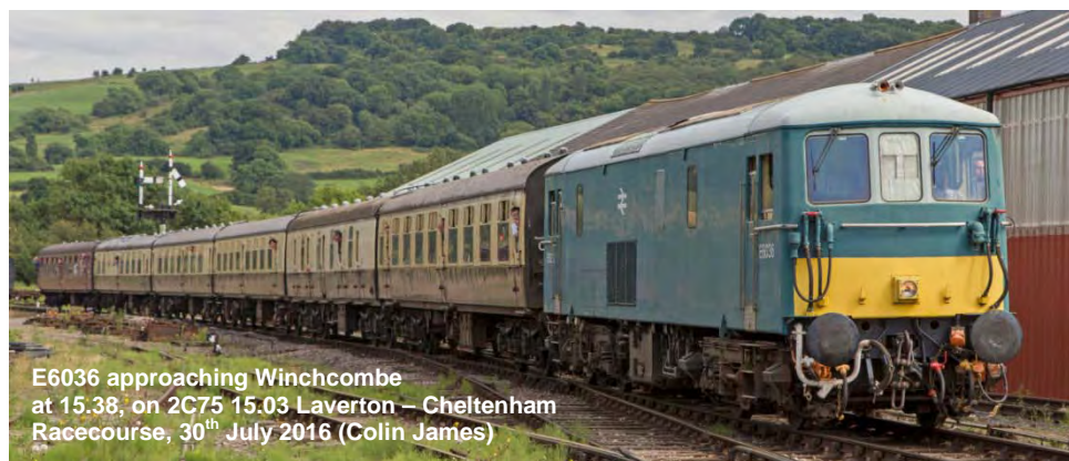
E6036 approaching Winchcombe at 15.38, on 2C75 15.03 Laverton – Cheltenham Racecourse, 30 th July 2016 (Colin James)