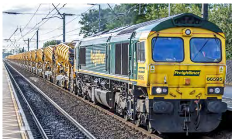
66595 t&t 66549 Colton North Jct – Tyne Yard (09.38)