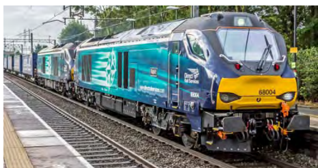
68004 + 68017 Daventry – Mossend (08.26)