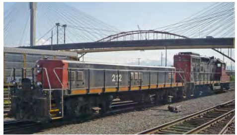
Alstom built Bo-Bo's class GP9U, 7280 and Slug 212, both Canadian National stand outside Thornton Junction shed, 30 th May 2014