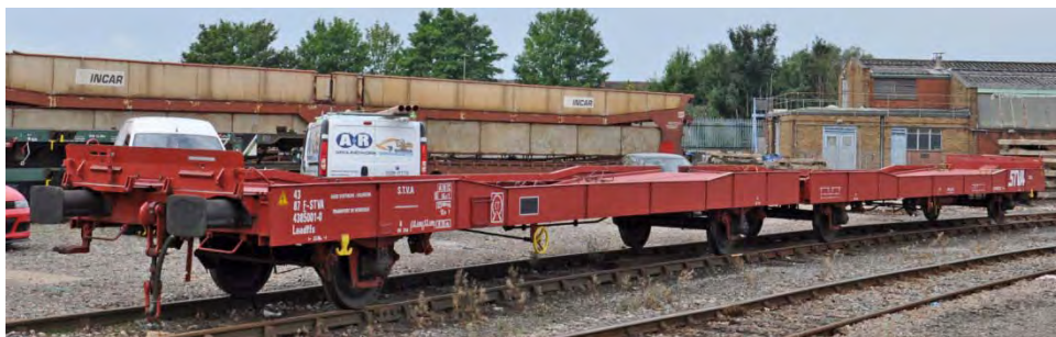
above 43.87.4385.001-0 Eastleigh Works, 25 th August 2016

Further to the report last month on the IPA 4w Car Flats , two have arrived at Eastleigh Works (see photo opposite top). There are two more to add 43.87.4385.002-8/005-1 making six and they are rebuilds from 1982 built wagons originally numbered 43.87.4334.261-2/264-6/267-9/281-0/282-8/283-6, a series never featured in our book.