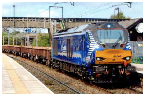
68006 passed Bescot at 13.22 on 12.22 Crewe - Bescot.