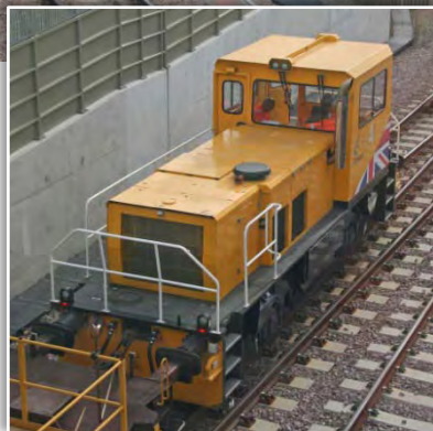
Clayton 4wDH shunters left 5 & 2, above 4