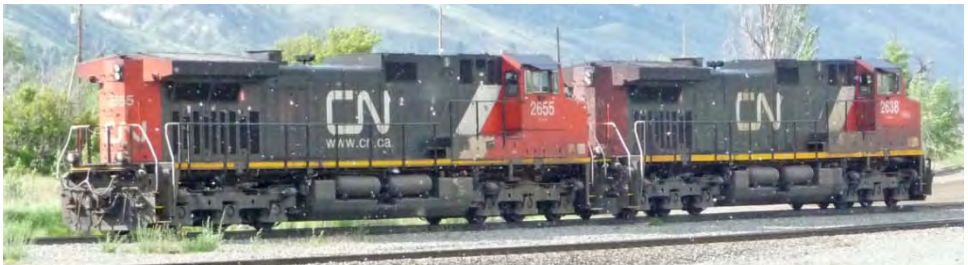
Approaching Kamloops we passed two General Electric built, Canadian National, Co-Co's class C449W 2655 and 2638, 30 th May 2014