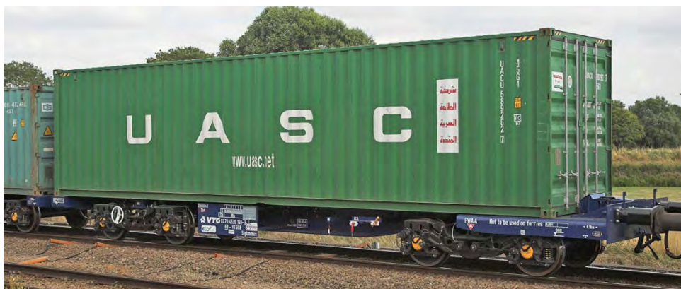
the first of the new Ecofret Triple Container Flats above outer FWA 83.70.4520.168-3, below centre FWA 83.70.4521.020-5 in the consist of 4Z26 13.13 Felixstowe North – Masborough, Ely, (15.43) 16 th August 2016

FWA Ecofret Triple Container Flat seven sets have been delivered, outers 83.70.4520.168 to 181 & centres 83.70.4521.020 to 026.