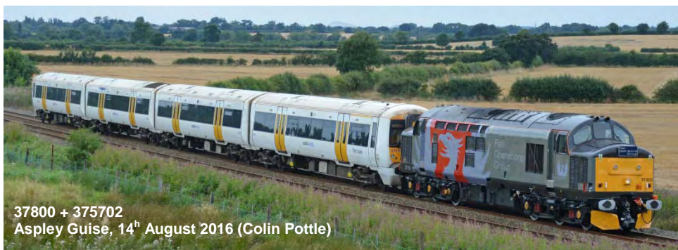
37800 + 375702 Aspley Guise, 14 th August 2016 (Colin Pottle)