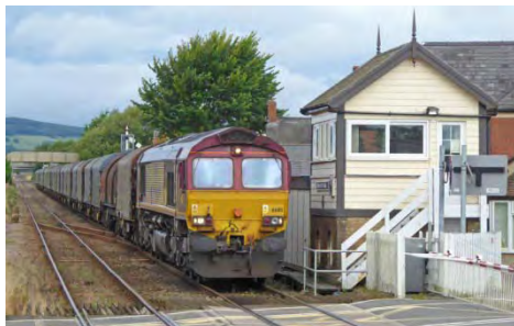
66623 passed Walsall at 14.20 on 6G65 Hope Earles Sdgs - Walsall Freight Terminal.