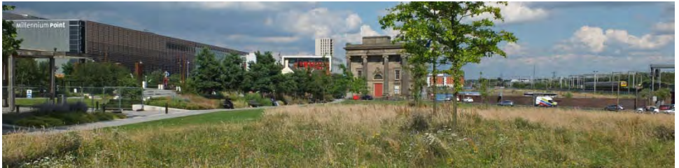
above looking east across Eastside City Park with Millennium Point on the left, the Woodman PH (hiding behind the trees), Curzon Street Station in the centre, vacant former railway land and location of the planned HS2 terminus and the mainline on the right with a passing CI.323

The Birmingham Science Museum was originally based on Newhall Street but moved in 2001 to new premises on Curzon Street inside Millennium Point adjacent the former listed Curzon Street Station (see RAILWAY OUTPOSTS ). Originally opened in 1951 as the Birmingham Museum of Science and Industry it was based in the former Elkington Silver Electroplating Works. This building was falling into disrepair and closed in 1997 re-opening in a newly built structure on the 29 th September 2001. The Museum shares Millennium Point with Birmingham University. There is a multi storey car park adjacent Millennium Point but is only a 10 min walk from Moor Street Station and is 100m from the mainline just south of New Street Station. So whilst sitting in the newly created 'pedestrianised' Eastside City Park, the 6.75 acre open area to the south opened in 2012, you can view the busy railway scene into and out of New Street.