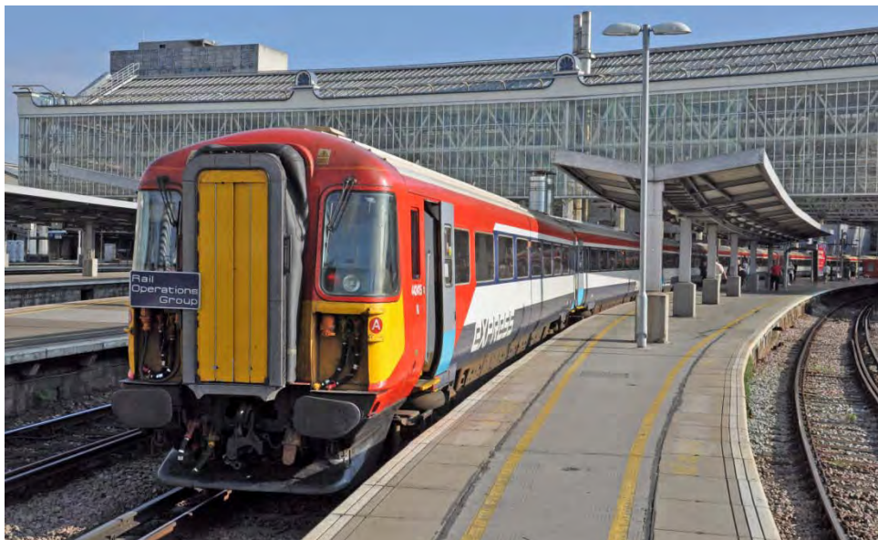
above 442415 + 442418 awaits departure from Waterloo on the outward leg (08.49) 29 th August 2016