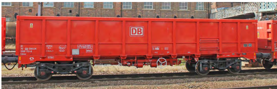
above a clearer view of the new DBC box wagon, MMA 81.70.5500.153-8 Doncaster, 23 rd August 2016

FWA Ecofret Triple Container Flat seven sets have been delivered, outers 83.70.4520.168 to 181 & centres 83.70.4521.020 to 026.