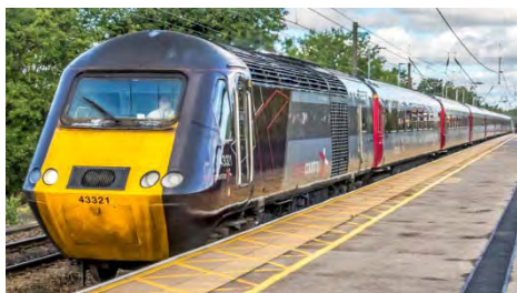
43321 t&t 43357 Edinburgh – Plymouth (11.31)