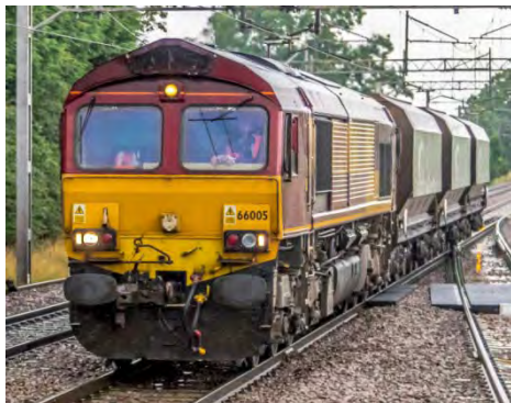
66005 Warrington Arpley – Stoke Marcroft (10.14)