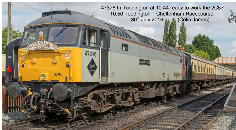
47376 In Toddington at 10.44 ready to work the 2C57 10.50 Toddington – Cheltenham Racecourse, 30 th July 2016 (Colin James)

A four train service was timetabled with 3 of the trains made up of 6 or 7 coach BR Mk1s operating between Cheltenham Racecourse and Toddington, with some services extended beyond Toddington to Laverton on the northern extension in top and tail mode. The fourth train was the Cl.117 DMU operating a Laverton – Toddington – Winchcombe shuttle. The timetable was well observed, with only a couple of late starting trains around lunch time, with all trains up to late afternoon well loaded.