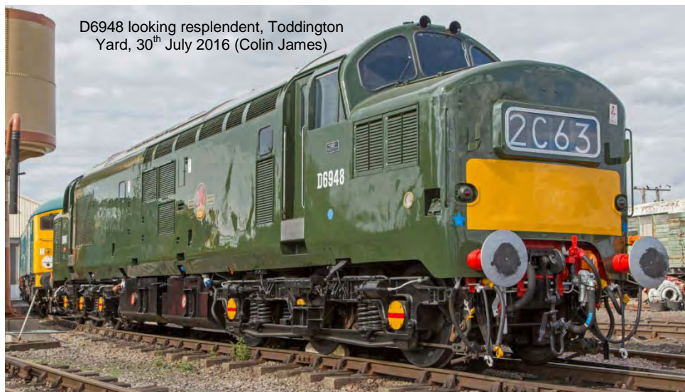
D6948 looking resplendent, Toddington Yard, 30 th July 2016

It has been a good few years since my last visit to the Gloucester & Warwickshire Railway, but the chance to see 37248 returned to original condition as D6948, plus D5343 (26043) and 45149, not yet seen working could not be missed. Coupled with a convenient gap in my shift rota, a trip was made down to Toddington on the 30 th the Saturday of the Diesel Gala.