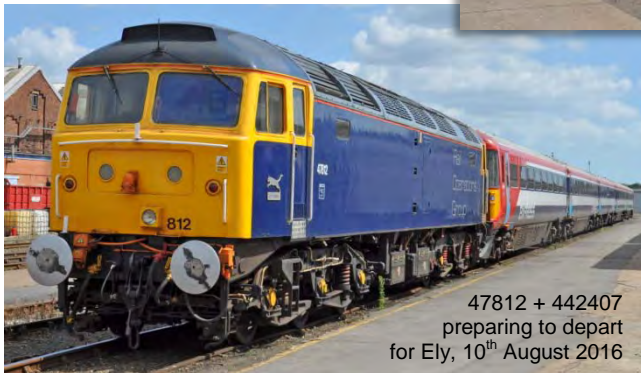
47812 + 442407 preparing to depart for Ely, 10 th August 2016

73961 and 73963 arrived with a test train in the early hours of the 30 th departing later that afternoon.