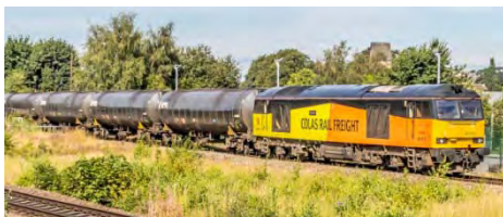
60076 Ribble Steam Railway - Lindsey (11.14)

185107-11/16/18/20/22/24/27/28/33-35/45/47/50