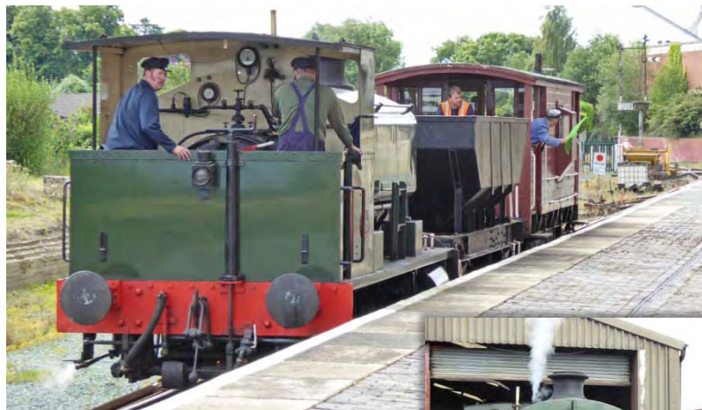
above 6 + dogfish + brake van 732435 passing through the station on the way to Middleton Road bridge

Cambrian Railway Trust, Oswestry (CRT): On 13th August the Cambrian Heritage Railway welcomed a new steam locomotive to Oswestry in the form of Barclay 0-4-0ST 6 [2261] built 1949 on loan from the Ribble Steam Railway, Preston. It is expected to stay for 12 months and the following pictures show the first engine in steam this season at Oswestry. Departures were due to commence at 11.00 but were delayed until 11.30 and continued until 15.30.