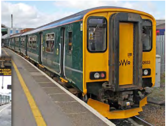
right & below newly formed and re-liveried 150933 formed of 52233 (right) + 57233 + 52248 (below), Bristol Temple Meads, 13 th August 2016