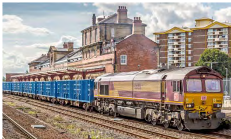
66156 Knowsley – Wilton binliner (15.45)

66156, 142036/71/78, 144013/15/16, 158784/787 158796/850/859, 180105