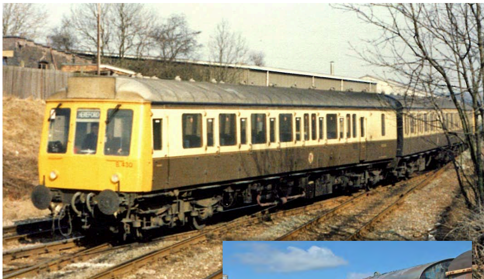
above GWR 150 th Anniversary livery