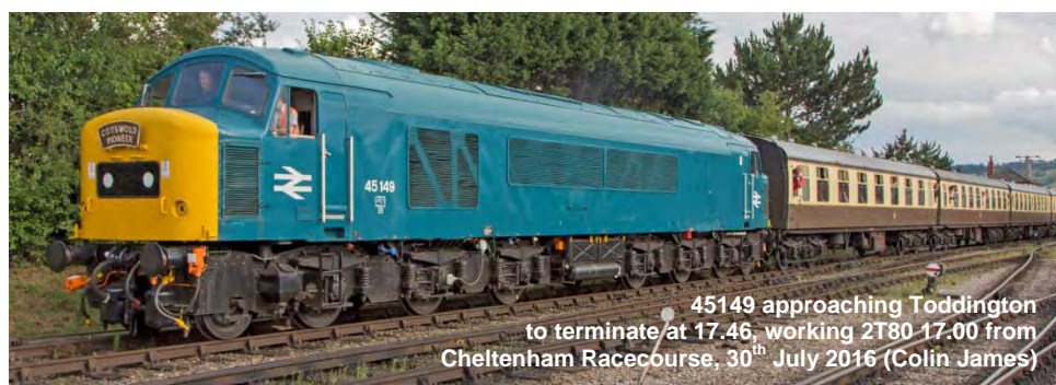
45149 approaching Toddington to terminate at 17.46, working 2T80 17.00 from Cheltenham Racecourse, 30 th July 2016

The Diesel shed at Toddington was open, with trade stands and model railways inside, as well as 47105, DMU Cl.117 51360 under restoration and 2001 (20035) recently transferred from CVR for component recovery and eventual scrapping (photo in last months issue).