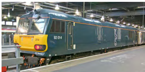
73965 + 72612 + 977974 + 72639 + 9701 + 73962 + 73963 was seen at Derby at 14.48 on a NR test train.