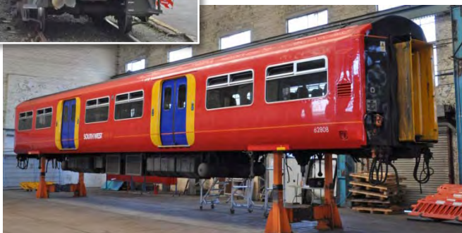
above MSO 62808 from 455726, 26 th August 2016

Traincare Depot next door. With the arrival here of 5726 on 25 th (see photo right in the company of 442403) the program has switched to the Works with Vossloh taking up residence in the van shop and part of the test shed, moving out of the Depot next door as they complete the units already there for modification.