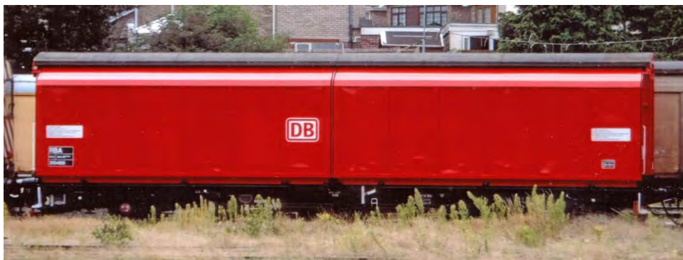
above RBA 210493 in new DBC red (as is 210614), Bescot 11 th August 2016

Re-numbered: ICA Bogie Tank 33.87.7898 109-6 to 37.80.7898 109-9 and 33.87.7898 113-8 to 37.80.7898 113-1