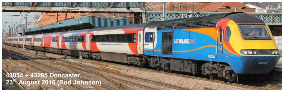
43054 + 43295 Doncaster, 23 rd August 2016