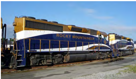
The Rocky Mountaineer was hauled by 2 Bo-Bo class GP40 locomotives 8019 and 8012, 30 th May 2014

The Rocky Mountaineer. This is a two day journey through the Rocky Mountains. Wonderful scenery and food. The train overnights in Kamloops and we spend the night in a hotel. Kamloops station is on a loop off the main line so it's not worth spending time there. The train itself has plenty of open balconies to view the mountains and other trains. However, apart from Kamloops it does not stop anywhere. We arrived at Vancouver station in the morning and the train was already in the platform. Before boarding, a piper entertained bus. There were two GP40s up front. Not long after leaving Vancouver we passed Thornton Junction shed. About 30 locomotives were seen there and nearby. The rest of the day was spent dining and looking out from the balconies.