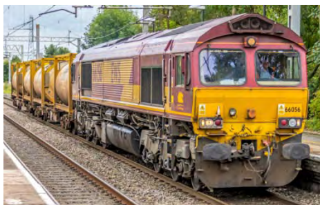
66056 Runcorn – Warrington Arpley (15.41)