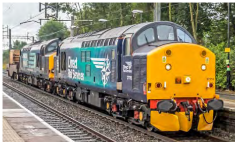
37716 + 37612 Crewe – Sellafeld flasks (06.54)

350239/244/251/368/374, 390002/005/006/040 390044-046/104/107/114/117/123/128/134/137 390141/151-154/156