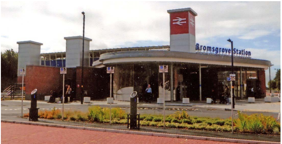
above front entrance, below the station layout from platform 3 with unusually 172342 in platform 2 (normally Cl.153/170s) Bromsgrove Station, 20 th August 2016 (David Spencer)

Bromsgrove station is over a mile from Bromsgrove at Aston Fields and until this year the station was at the foot of the Lickey bank. The original station had the down (southbound) platform on a loop with the depot off the end of this platform and the wagon works alongside that. They all disappeared bit by bit, first the wagon works, then the depot and finally the platform leaving just the up platform to deal with all trains. When the Cardiff services joined the Hereford services in stopping, a new footbridge and platform were constructed, now these have gone as well. The new station is about one quarter of a mile further south and whilst it can be accessed by the old station approach, a new road has been cut through. There is a small drop off, although still larger than at the old station and bus stop in front of the station building which contains ticket office and bicycle shed, it is vast compared with the facilities Bromsgrove had before. A covered footbridge leads to two island platforms with four faces but currently the two outer platforms 1 & 4 are not in public use. Beyond the station building is a huge car park which on my visit was totally bereft of cars. All this space used to be a yard and the loop where all trains stopped to collect the bankers and the far right corner looking south was where the bankers were stabled whilst awaiting their next task.