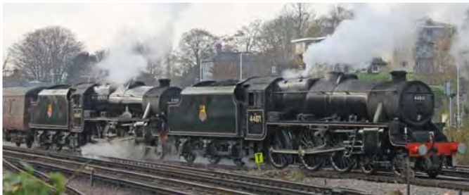
above middle 33207 hauling Black 5 4-6-0s 44871 + 45407 were seen at Reading at 13.40 on a Bristol - Southall move, 21 st November 2016