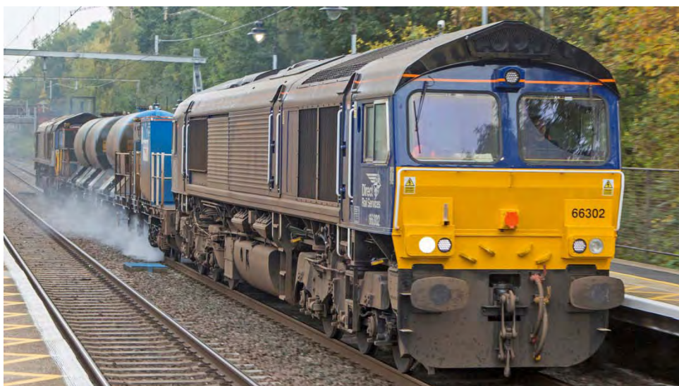
66302 t&t 66430 passing westbound through Ingatestone at 10.30 on 08.43 Stowmarket DGL – Shenfield leg of the 3S60 08.43 Stowmarket DGL – Stowmarket DGL RHTT, 27 th November 2016

below 56105 t&t 56087 on Shrewsbury Coleham Yd - Shrewsbury Coleham Yd RHTT, Crewe (09.06) 19 th November 2016