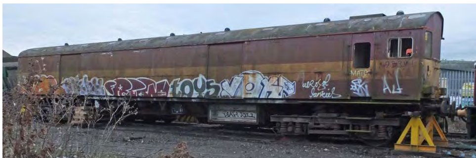
above 95301 ex CI.307 EMU DTSO 75102 converted to PCV in 1993 for mail 13 th November 2016