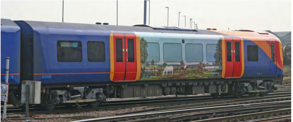
unveiled by SWT on the 15 th November 2016, vinyls have been applied to 450112 & 450118 depicting scenes from the New Forest and Durdle Door, Dorset above 63908 of 450118 showing the New Forest, Eastleigh 23 rd November 2016

This section will endeavour to show all new liveries / variations or those existing ones where not carried on the stock before. Liveries that become 'extinct' will also be covered. As with names, it may take a while after the livery application before a photo is sourced from members. New liveries may also be shown in other articles: 57304 in EASTLEIGH WORKS REPORT .