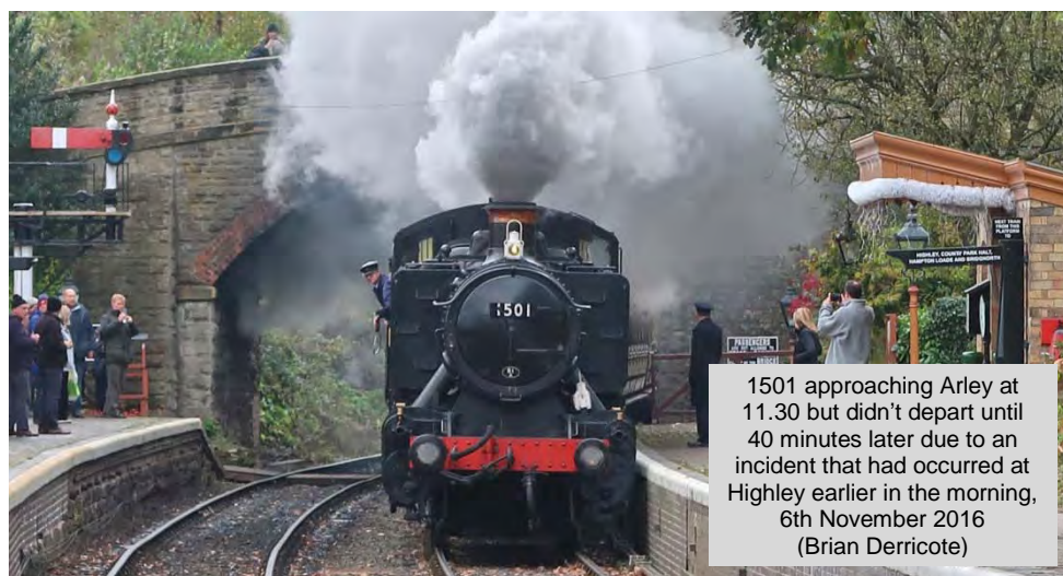
1501 approaching Arley at 11.30 but didn't depart until 40 minutes later due to an incident that had occurred at Highley earlier in the morning, 6 th November 2016 (Brian Derricote)