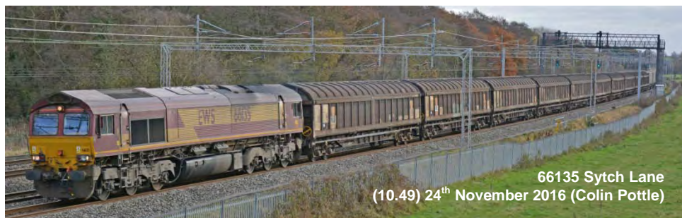
66135 Sytch Lane (10.49) 24 th November 2016