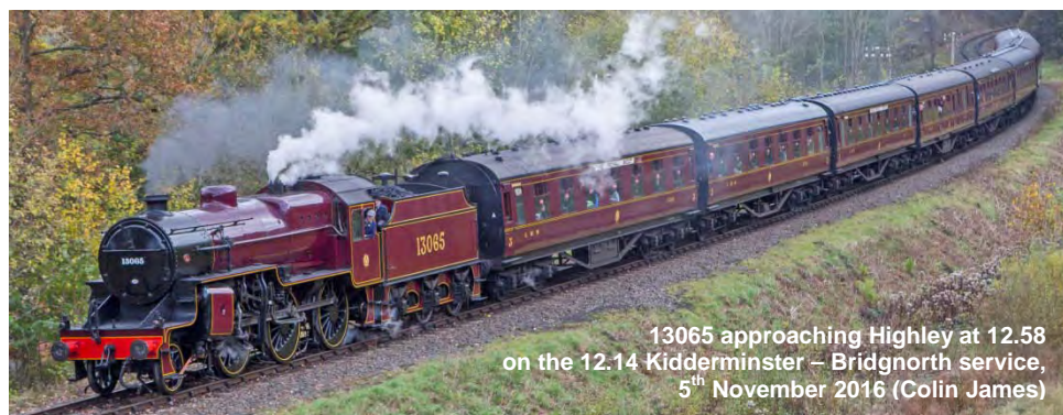
13065 approaching Highley at 12.58 on the 12.14 Kidderminster – Bridgnorth service, 5 th November 2016

All trains seen were well laden, with most full & standing and the timetable on both days was well observed. Being late in the year, the co-operation of the weather was welcome, with good spells of sunshine highlighting the autumnal colours, but with a chill wind hinting at the winter to come.