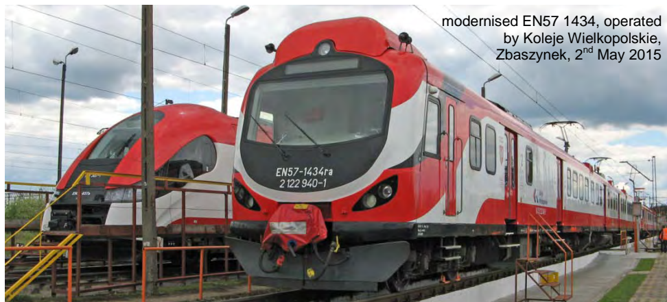
modernised EN57 1434, operated by Koleje Wielkopolskie, Zbaszynek, 2 nd May 2015