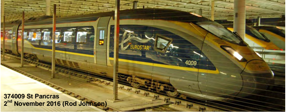
374009 St Pancras 2 nd November 2016 (Rod Johnson)