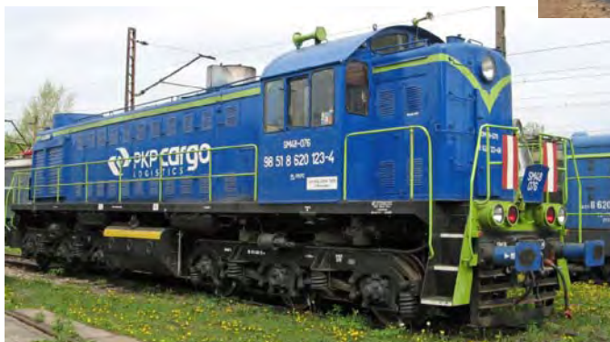
left PKP Cargo SM48 076