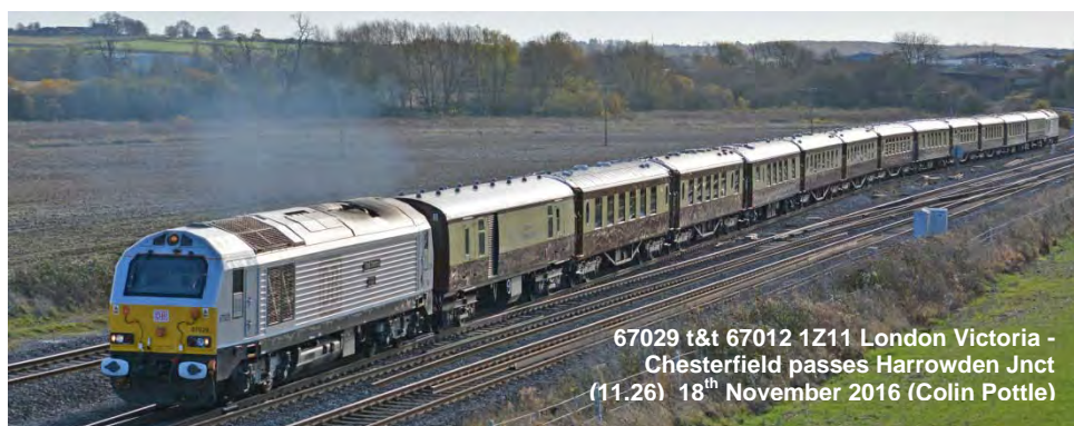
67029 t&t 67012 1Z11 London Victoria - Chesterfield passes Harrowden Jnct (11.26) 18 th November 2016