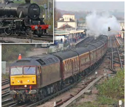
47802 t&t Black 5 4-6-0s 45407 + 44871 on a Southall - Swanage move, 23 rd November 2016 passed Basingstoke above at 14.00 (Paul Sumpter) & Eastleigh left at 14.32 (Derek Everson)