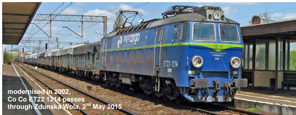
modernised in 2002, Co Co ET22 1214 passes through Zdunska Wola, 2 nd May 2015