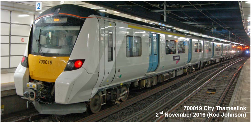
700019 City Thameslink 2 nd November 2016 (Rod Johnson)