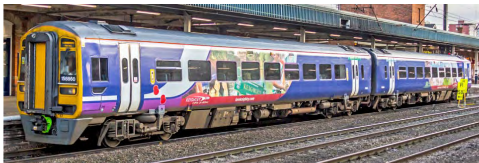
above NR 158860 with Keighley capital of Airedale vinyls, different on each car below 57860 & bottom 52860, Doncaster, 19 th November 2016