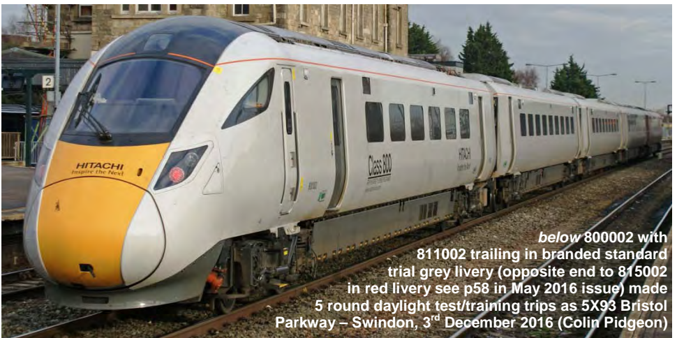
below 800002 with 811002 trailing in branded standard trial grey livery (opposite end to 815002 in red livery see p58 in May 2016 issue) made 5 round daylight test/training trips as 5X93 Bristol Parkway – Swindon, 3 rd December 2016 (Colin Pidgeon)