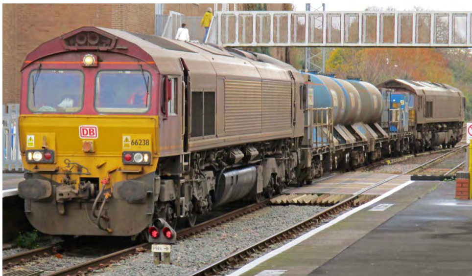
below 66238 t&t 66160 on 3J13 RHTT, Paignton North (12.50) 22 nd November 2016