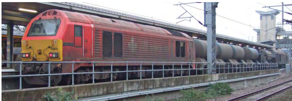
above & below 67018 + 67024 (new livery !!) RHTT Nuneaton, 2 nd December 2016 (Andrew Turnidge)