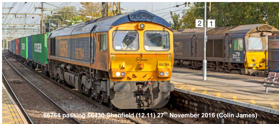
66764 passing 66430 Shenfield (12.11) 27 th November 2016