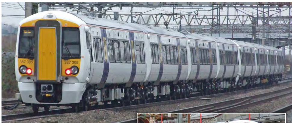
387305 + 387306 on test above Nuneaton 2 nd December 2016 (Andrew Turnidge) right Crewe, 21 st November 2016 (Roy Hitchin)