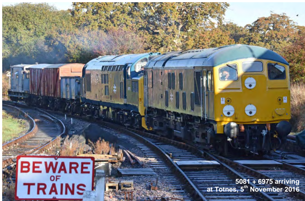
5081 + 6975 arriving at Totnes, 5 th November 2016

Over the weekend there was an intensive timetable running with the Friday being a dedicated Sulzer day with the Cls.24, 25 & 33. On Saturday and Sunday there was a varied timetable including two full round trips of the line for the Cl.04 & 09 as a pair, and the use of the bubblecar for one round trip each morning. At Buckfastleigh on both days in between trains there was the opportunity for 'Driver for a Fiver' utilising both shunters. All the locos operated on both passenger and goods workings either on their own or double heading.