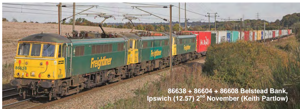
86638 + 86604 + 86608 Belstead Bank, Ipswich (12.57) 2 nd November (Keith Partlow)