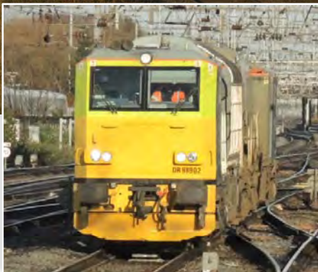
left MPV DR98902 + DR98952 on Wigan - Crewe RHTT is seen arriving at Crewe at 09.32 on the 19 th November 2016