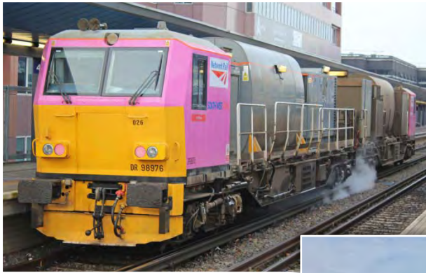
left DR 98926 + DR 98976 platform 4, Reading (09.25), the MPV stayed at the buffer stops for an hour then headed south, 3 rd November 2016