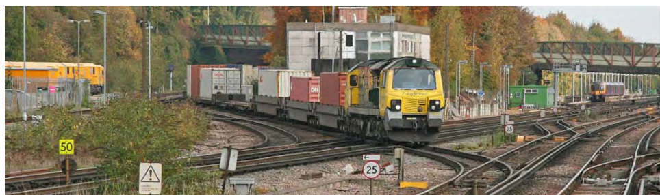
66622 Belstead Bank, Ipswich (11.33) 30 th November 2016