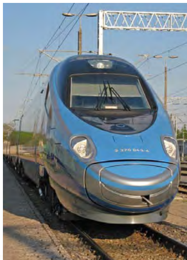
above ED 250 007, Warszawa Grochowska, 3 rd May 2015

At nearby Karsnice there is a large privately preserved collection where access was not possible but, in the nearby depot, was CTL Logistics ST 43 R0006 (see photo above). We also visited the 750mm system at Rogow, at 49km the longest still operating in Poland. We had however just missed a train so contented ourselves with a look around the collection on view.