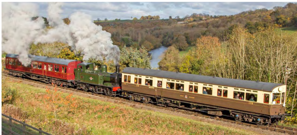
above 78 + 1450 + 238 departing Highley at 12.36 on the 12.35 Highley – Kidderminster local service, 5 th November 2016

Services on the Friday were disrupted by a signalling cable fault on the northern (Bridgnorth) end of the line resulting in pilotman working and a much amended timetable. This change, combined with not being rostered to work on Saturday, meant 43106 not being seen at all. Also, the un-fitted goods trains were cancelled on the Friday, leaving 2857 spare to work light engine footplate experience runs around the Bewdley station limits. The signalling cable fault was fixed on Friday, so the advertised timetable was in use for the rest of the weekend.