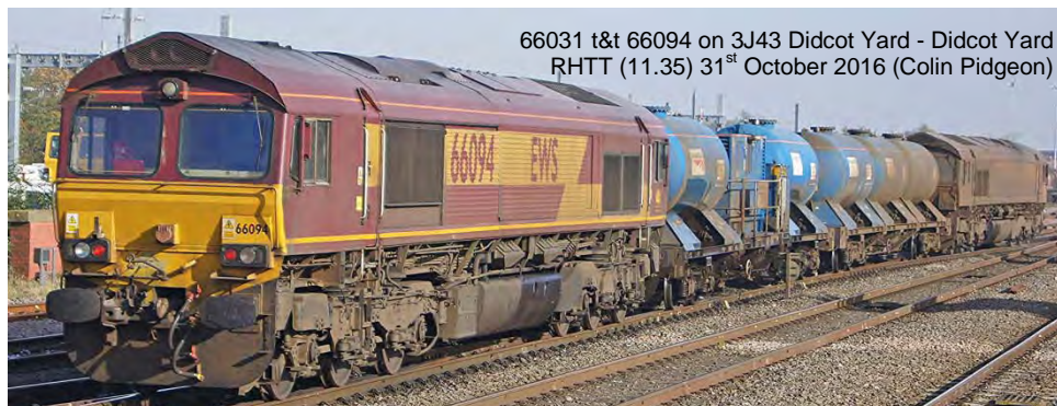
66031 t&t 66094 on 3J43 Didcot Yard - Didcot Yard RHTT (11.35) 31 st October 2016