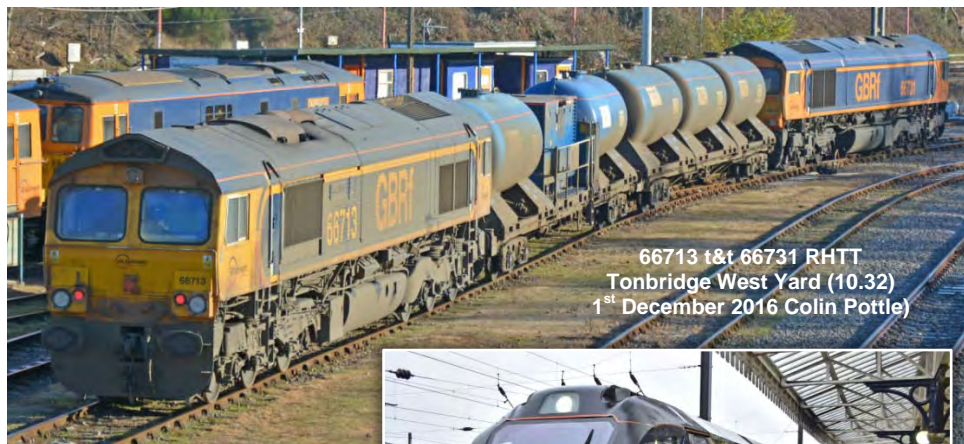
66713 t&t 66731 RHTT Tonbridge West Yard (10.32) 1 st December 2016 Colin Pottle)