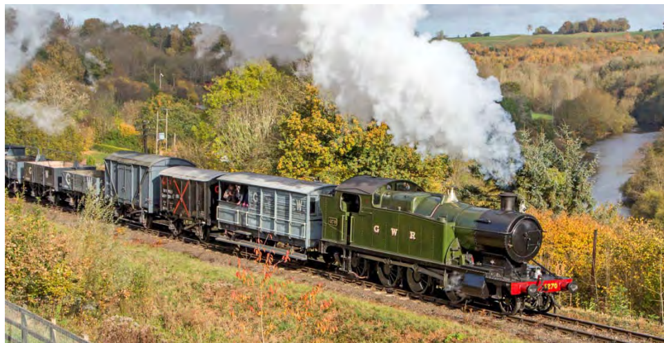
above 4270 departing Highley at 11.05 on the 10.35 Bridgnorth – Kidderminster unfitted freight train, 5 th November 2016 (Colin James)

Other steam locomotives viewed were SR WC 4-6-2 34027 'Taw Valley' at Bewdley and on display at the Highley Engine House were WD 2-10-0 600 'Gordon', 2-6-0 No. 7325, Stanier Black 5 4-6-0 45110, Ivatt 2MT 2-6-0 46443, 8F 2-8-0 48773, 3F Jinty 0-6-0T 47383, BR Std 4MT 2-6-4T 80079 & Hunslet 0-6-0T 686 'The Lady Armaghdale'.