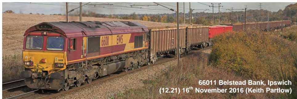
66011 Belstead Bank, Ipswich (12.21) 16 th November 2016