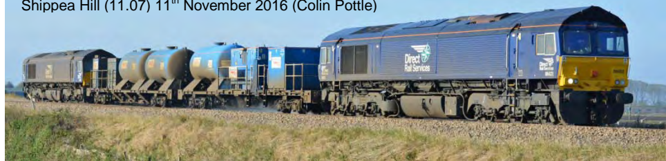
66422 t&t 66433 3S01 Stowmarket - Cromer RHTT approaches Shippea Hill (11.07) 11 th November 2016