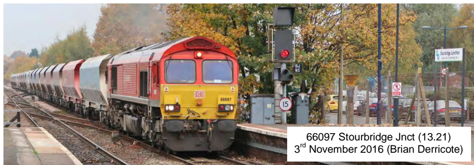
66097 Stourbridge Jnct (13.21) 3 rd November 2016 (Brian Derricote)