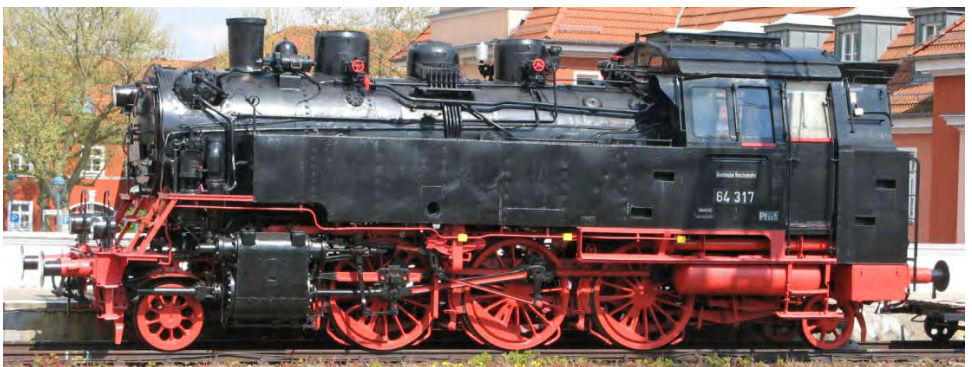
above 2-6-2T 64 317, Krupp number 1320 of 1934, Frankfurt (Oder), 1 st May 2015

I then walked on to the depot, where 23 1019, belonging to the Lausitzer Dampfloklub, was receiving attention, later returning to the station for the service to Frankfurt (Oder). Shortly after leaving Cottbus, the line passes the large Vattenfall opencast mine and some of their odd looking locomotives were visible. I then passed a little time on the platforms in the sunshine before heading back to Berlin to meet the other members of the party.