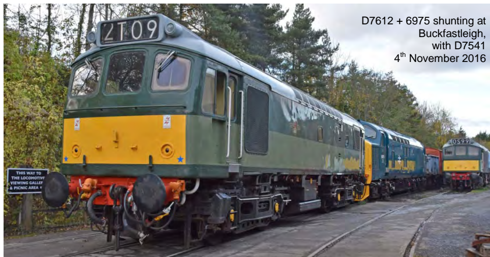
D7612 + 6975 shunting at Buckfastleigh, with D7541 4 th November 2016