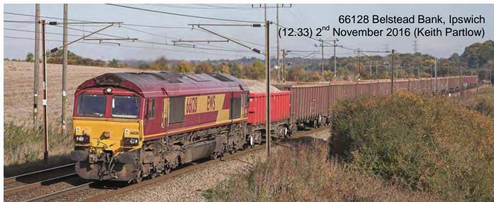
66128 Belstead Bank, Ipswich (12.33) 2 nd November 2016 (Keith Partlow)