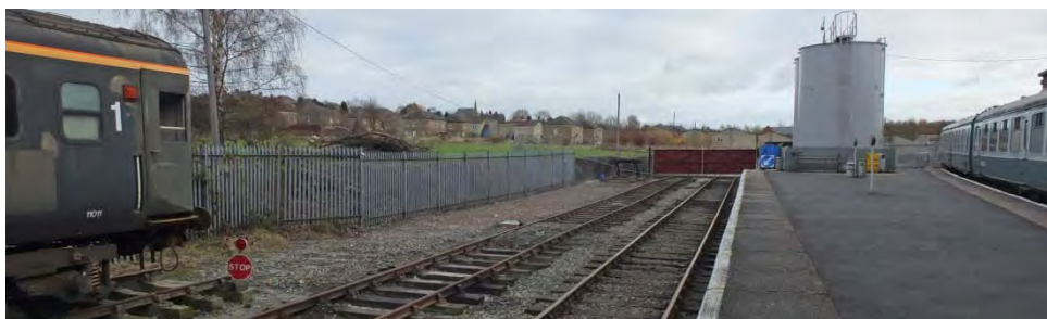
above & below Roundhouse Halt, adjacent sidings and unloading access (note the gap in the far track) with just 20301 + 20304 + warflat WGF 8041 plus a handful of coaches