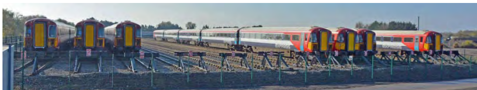
above looking southwest 442412/424/404/415/422/403/420, 11 th November 2016

Ely Papworth Sidings: The Potters Logistics Ely Freight Terminal, 1½ miles north of Ely station adjacent Ely North Jnct, has created an additional 13 sidings on 10 acres of land to the southeast between the main line and the River Great Ouse. The photo below shows the new sidings created to hold stored stock, currently CI.442 EMUs