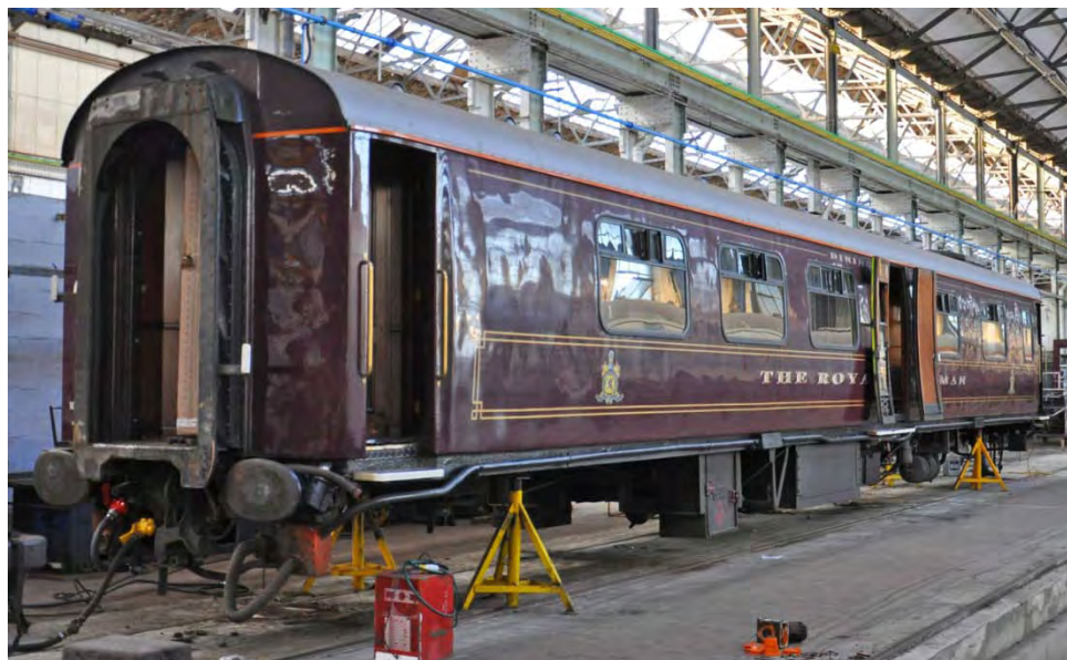
above with the Royal Scotsman coaches now stabled over winter in Eastleigh Works, Dining Car 1 99967 (317) is seen receiving attention on the 25 th