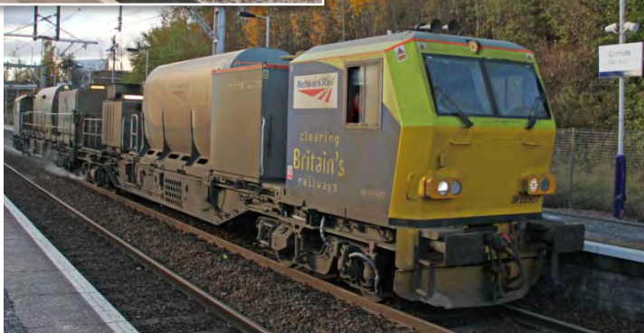
right DR 98907 + 98957 10.16 Girvan - Mossend Down Yard RHTT, Carmyle (14.27) 7 th November 2016