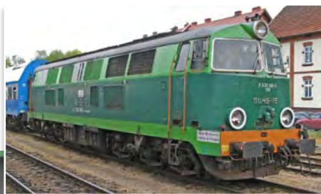
left PKP SU45 115

below OI 49 69 passing other steam locos clearly being used as vantage points for spectators...a different approach to Health and Safety !!!