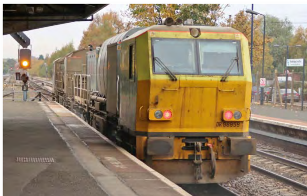
left DR 98959 + DR 98909 RHTT Stourbridge Jnct (12.44) 3 rd November 2016

More images from the RHTT season with several diagrams covered by members.