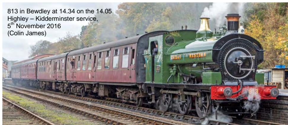
813 in Bewdley at 14.34 on the 14.05 Highley – Kidderminster service, 5 th November 2016

All trains seen were well laden, with most full & standing and the timetable on both days was well observed. Being late in the year, the co-operation of the weather was welcome, with good spells of sunshine highlighting the autumnal colours, but with a chill wind hinting at the winter to come.