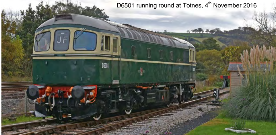
D6501 running round at Totnes, 4 th November 2016

Over the weekend there was an intensive timetable running with the Friday being a dedicated Sulzer day with the Cls.24, 25 & 33. On Saturday and Sunday there was a varied timetable including two full round trips of the line for the Cl.04 & 09 as a pair, and the use of the bubblecar for one round trip each morning. At Buckfastleigh on both days in between trains there was the opportunity for 'Driver for a Fiver' utilising both shunters. All the locos operated on both passenger and goods workings either on their own or double heading.