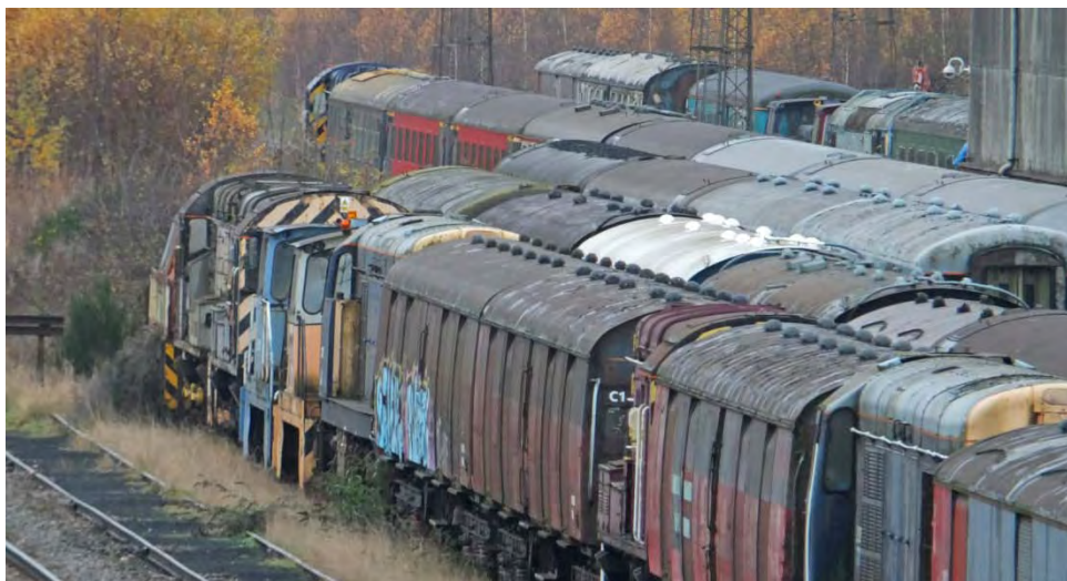
above the southern end of the sidings and shed

On the other tracks from east to west were: Mk1 15931 + 9 coaches, 10 coaches, 13 coaches + 47488 (one coach from northern end) + 08704 (southern end). On the eastern shed track were 3 coaches, Mk1 5027 + 2 Mk2s to the north and to the south (see photo below) coach + D5217 (25067) + Hun 0-6-0DH 1 [7041] + Hun 0-6-0DH [8805] + Mk2 coach + Mk1 coach + ex-Mk1 CCT 977241 (94291) (far southern end).