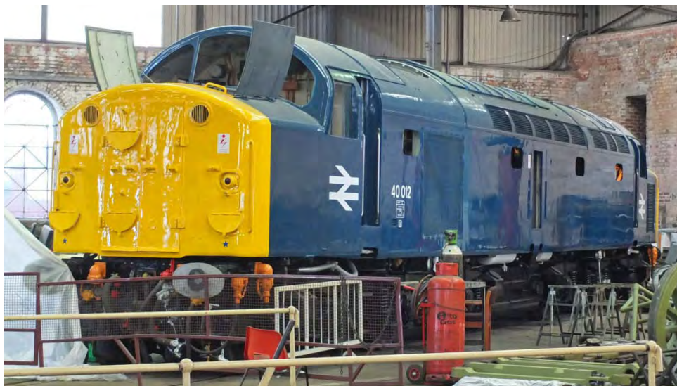
above inside the Roundhouse 40012 was in the final stages of repair, having been re-numbered from D212 and repainted into BR blue from BR green (compare with photo on p47 August 2016)

Barrow Hill Roundhouse: With the imminent closure for refurbishment and the provision of a new visitor centre including a new entrance, cafe and shop, I made a last visit on the 27 th November 2016. Nearly all the artefacts in the display area had been removed to storage. It was probably the most empty I have seen the yard with the sidings alongside Roundhouse Halt almost empty.