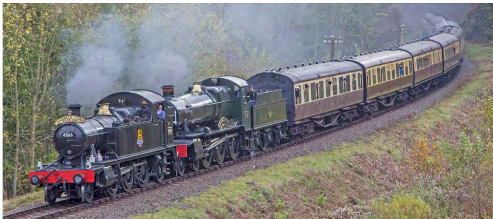
above 4566 + 7812 approaching Highley at 11.28 on the 10.44 Kidderminster – Bridgnorth service, 5 th November 2016

Viewed at various times around the Kidderminster Diesel depot were D3022, D8059, D8188, D1062, 50031, 50035 & 12099. D4100 was the carriage works shunter.