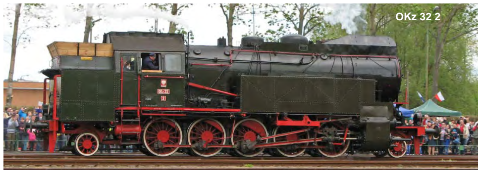
OKz 32 2