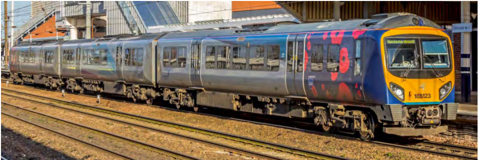
above & below TPE 185123 with poppy vinyls applied to the cabs covering the new livery, Doncaster, 19 th November 2016 (Mike Brook)