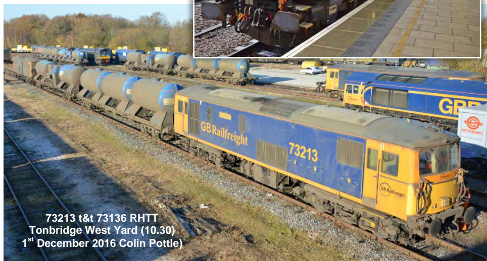
73213 t&t 73136 RHTT Tonbridge West Yard (10.30) 1 st December 2016 Colin Pottle)