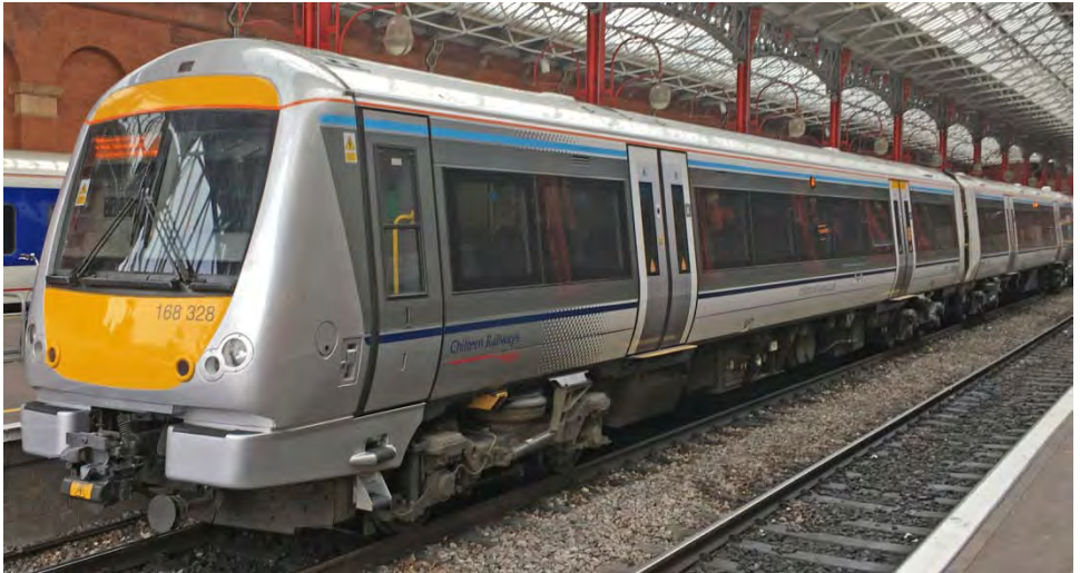
above 168328 (ex-170308) Marylebone, 4 th November 2016

right 96604 stored 96604 in FGW Motorail livery, Eastleigh Works, 15 th March 2012