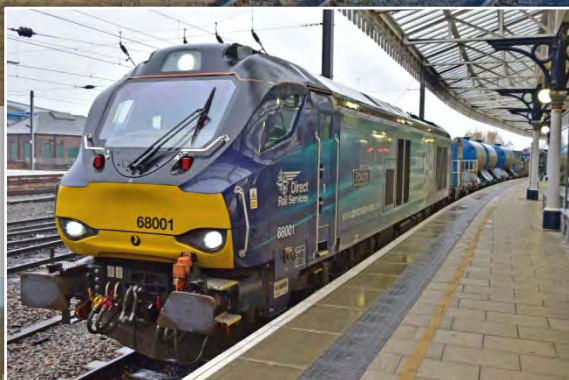
right 68001 3S26 05.52 Harrogate - York Thrall Europa, York RHTT (09.21) 12 th November 2016