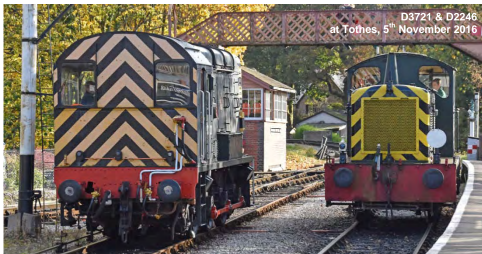
D3721 & D2246 at Tothes, 5 th November 2016