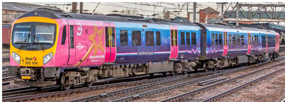
above TPE 185104 with Manchester Pride vinyls, showing the opposite end to that shown on p61 in the September 2016 issue, Doncaster, 19 th November 2016