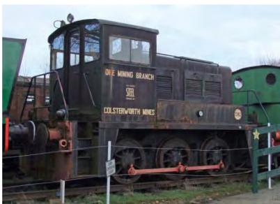
above [1382] 27 th November 2016