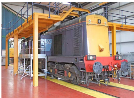
20312 inside with engine bonnet doors open for inspection