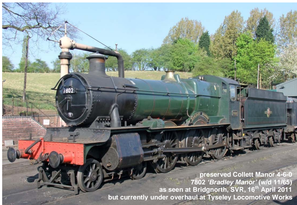
preserved Collett Manor 4-6-0 7802 'Bradley Manor' (w/d 11/65) as seen at Bridgnorth, SVR, 16 th April 2011 but currently under overhaul at Tyseley Locomotive Works

On my next rest day, the 23 rd I returned to familiar territory, although neither one was to remain familiar for long. First D34 took me to Gloucester and a quick trip to Cashes Green Halt with 1453 out and 9453 back . It was the Hereford line I went for and had 4144 to Holme Lacy, 6935 on to Ross on Wye and 7320 back to Gloucester. I then spent time taking photos both on the station and in both sheds with the prize perhaps being 31868 on Barnwood shed.