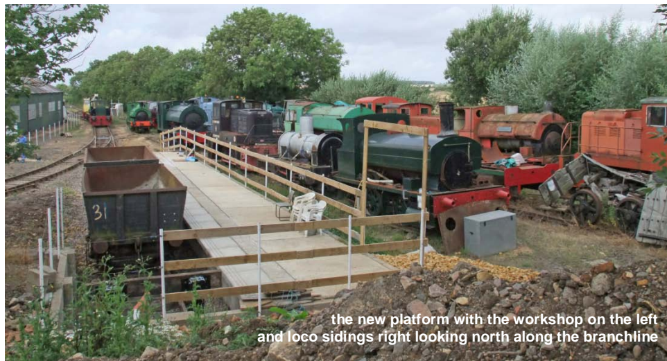
the new platform with the workshop on the left and loco sidings right looking north along the branchline

The Rutland Railway Museum (RRM) as was, was one railway I have been meaning to visit for some time and finally realised how easy it was to find. Wanting a pit stop on our trip south prior to the DRS Crewe Open Day, we turned off the A1 onto the A668 intending to stop at Rutland Water, but firstly followed the signs to RRM, which then slightly confused us by becoming Rocks by Rail signs in the village of Cottesmore, then back to RRM \frac{3}{4} mile west at the site entrance off Ashwell Road. Apparently Rocks by Rails is the new name the RRM is to be known by. As I mentioned above it is actually fairly easy to find with numerous brown signs and is less than five miles from the A1 north of Rutland Water.