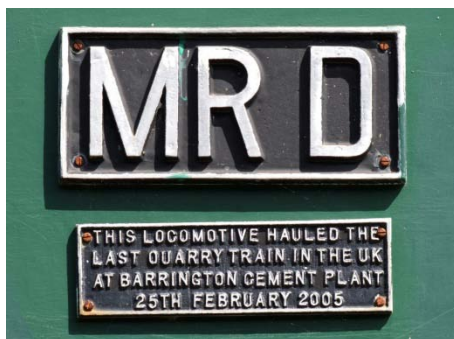
operational [177] Thomas 4wDH 'Mr D' built 1967, the plaque says it all