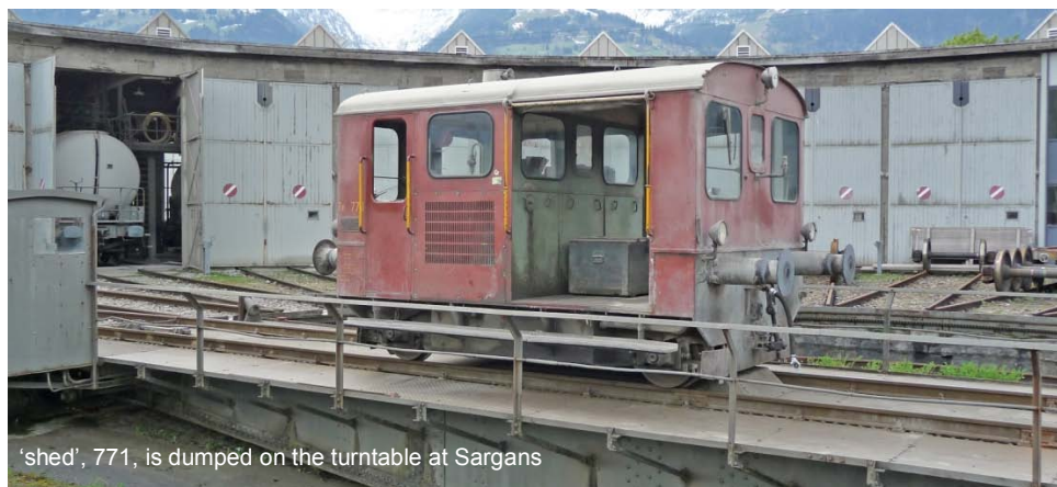
'shed', 771, is dumped on the turntable at Sargans