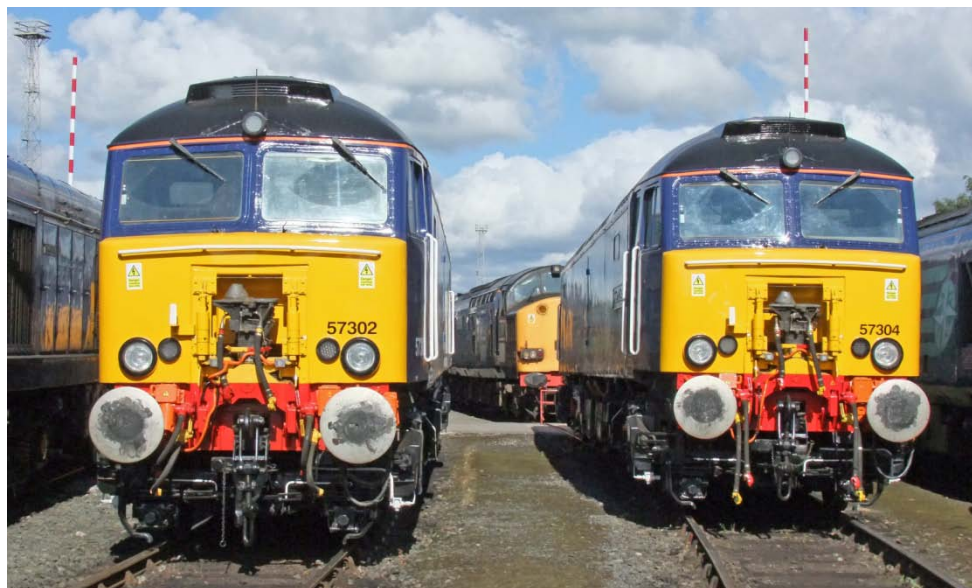
ex VWC Thunderbirds 57302 57304 'Pride of Cheshire' gleaming in the late afternoon sunshine