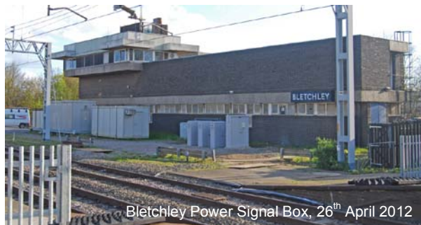
Bletchley Power Signal Box, 26 th April 2012

Platforms 5 and 6 at Bletchley are to be extended for 12 car trains (currently 9 and 6 cars respectively) with Platform 5 to be signalled for bi-directional working. In addition a new turnback facility from Platform 5 clear of the Slow Lines is to be provided. It is believed that in the changes proposed provision will be made for the anticipated East-West rail link and for Bedford to Bletchley services to run via Milton Keynes Central (LMT have an aspiration to run Bedford - MKC services from 2013).