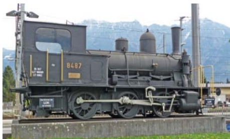
1909 built 0-6-0 8487 is plinthed outside Buchs station, 14 th April 2011

Now into country number 6, Austria but only en route to Germany. We looked in at Feldkirch station then did Wolfurt depot, only 12 on, then after a look at Bregenz station (2 locomotives and 1 unit)! The it was back into Germany for our second visit.