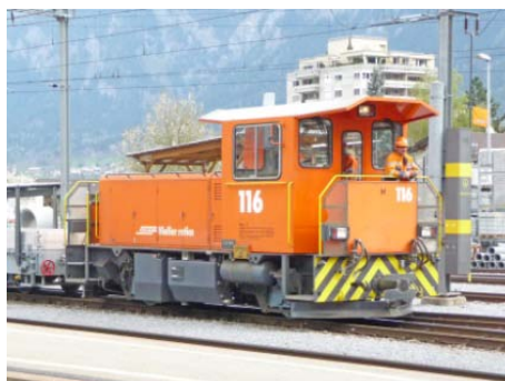
RHB (Rhätische Bahn) has the largest network of the Swiss private railways with one of its more modern tractors, Tm 2/2 116 shunting at Thusis station, 14 th April 2011