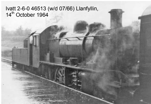
Ivatt 2-6-0 46513 (w/d 07/66) Llanfyllin, 14 th October 1964

The Llanfyllin branch beckoned with 46513 the branch engine. As by now the pouring rain had stopped, I got out at Llynclys where I discovered a delightful GWR loo sign. From there I then got 80078 back to Welshpool. This time I went all the way to Whitchurch behind 80099 and returned with old friend 80080 to Oswestry. Having always had an auto train on the branch to Gobowen in the past, to see 46513 (again) was a surprise. Black five 44760 took me back to Shrewsbury and D1754 home to a political rally on election eve.