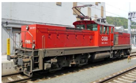
1063 037 was station pilot, Feldkirch station, 14 th April 2011