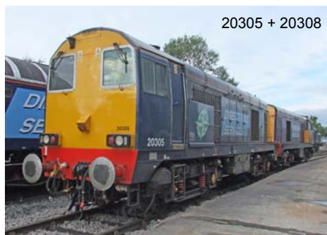
20305 + 20308