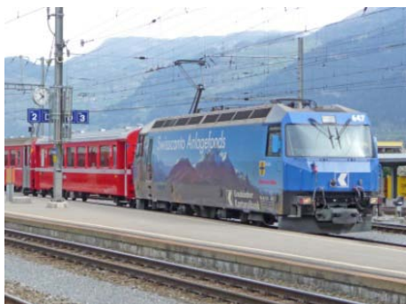
the most modern of the RHBs fleet of electric locomotives is the CI.Ge 4/4III of which 647 Grütsch is in non standard blue livery seen arriving at Thusis, 14 th April 2011