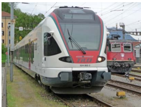
one of the new Belinzona s-bahn units, 524002 is stabled alongside Belinzona station, 14 th April 2011

Belinzona. An early visit to the station before a walk alongside the shed. No need to ask as most can be seen from outside. There is also a yard outside the town at San Paolo where 14 were seen there. Now it was the 75 mile journey to Chur, home of the RHB. The RHB (RHÄTISCHE BAHN) is the largest of the Swiss private railway companies in terms of route mileage. It also has a terminus in Tirino, in Italy. On route we stopped at Thusis just as a passenger train was coming in. In Chur there was not a lot to see so we headed north to the main RHB depot and workshop at Landquart. There were some locomotives and units stabled around the station. We did not attempt the works (we wrote earlier for a permit which they would have provided at an extortionate fee, so we declined), but managed a look into the shed, which is a roundhouse, and saw quite a bit.