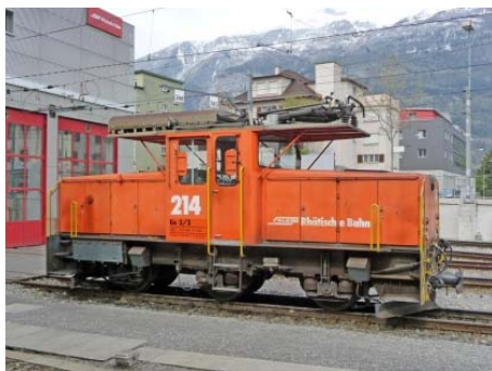
RHB Ge 3/3 electric shunter 214 sits outside the small depot at Chur station 14 th April 2011