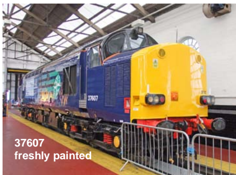
37607 freshly painted