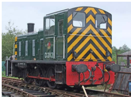
transferred D2112 Robertsbridge, RVR, 2 nd September 2012