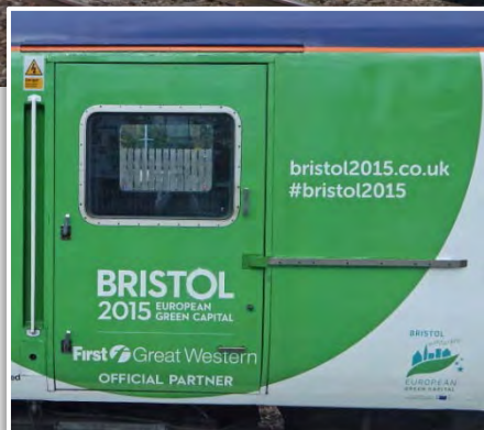
above 43126 in yet another advertising livery on a FGW HST power car on 1L11 Bristol Temple Meads – Paddington, Swindon, (14.10) 29 th July 2015

left wording around lefthand guards door, Cardiff Central, 1 st August 2015