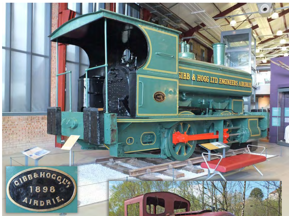
above Gibb & Hogg (1898 built) 11 [16] 0-4-0ST worked for Fife Coal Co then NCB Fife area

note the adjacent Glasgow to Airdrie mainline behind