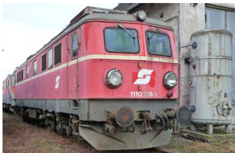
preserved 1110 526 with 1110 018 behind Amstettin, 11 th April 2013

We then continued onto St Polton which is mainly units now, a change from the good old days! Also in St Polton is the depot for the narrow gauge at Alpenbahnhof. This is for the line to Mariazell where there is a large tram museum. This line was worked by 100 year old Cl.1099 electric locomotives and 50 year old Cl.2095 diesels (built 1962). Units are going to take over from these quite soon.