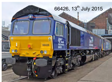
66426, 13 th July 2015

37601 stabled with UTU3 Test Train on the 21 st (see photo above right).