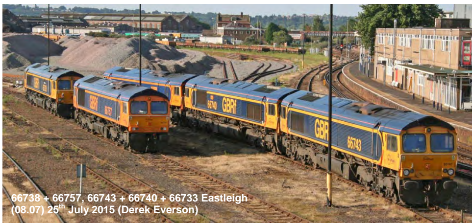
66738 + 66757, 66743 + 66740 + 66733 Eastleigh (08.07) 25 th July 2015