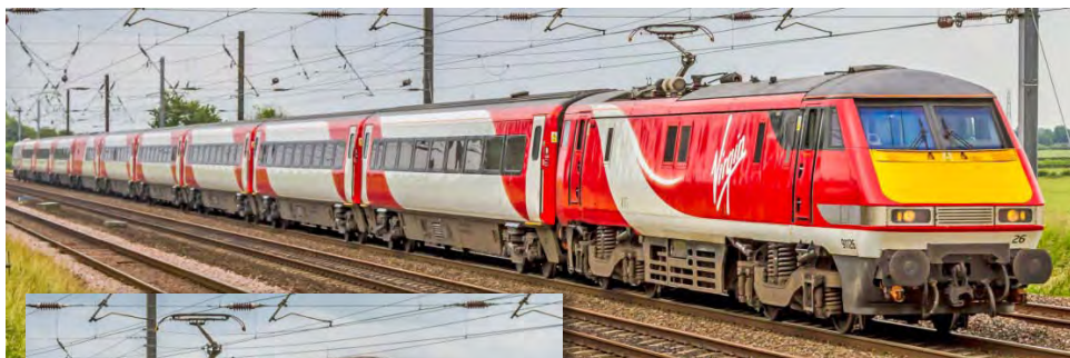
above 91126 with full width dark grey roof, Beningborough 5 th July 2015 (Mike Brook)