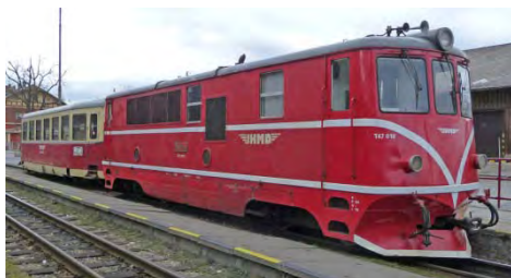
T47 018 with trailer 705 918 Jindrichuv Hradec station, 11 th April 2013

The main and last depot of the day was Ceske Budejovice. We greeted the chief with "Dobry Den" then handed a card that said Dobry Den, Jsme Anglican. Prosim, Chceme navstivit vas depo aby videt a fotografovat vas lokomotivy dekuji. That did the trick. 137 on shed, most outside and it was chucking it down!