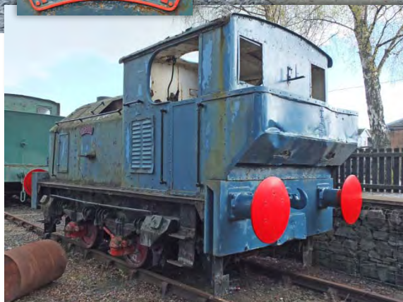
above the 3 outdoor industrial locos situated on the northern boundary alongside the Glasgow to Airdrie mainline with leading Hudswell Clarke (built 1909) 9 [895] 0-6-0ST worked for Fife Coal Co then NCB Fife area