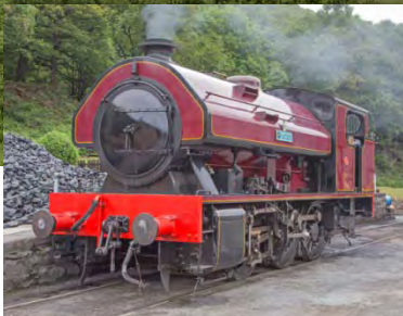
inset 0-6-0ST [2996] Haverthwaite, LHR (08.50) 29 th June 2015

I made a 5 day trip to take in some DRS action on the Cumbrian coast and the WCML. An extra early morning stop made was to visit to the Lakeside & Haverthwaite Railway (LHR) for breakfast which is fully recommended, watching the railway come alive before the services started Unfortunately I didn't have time to travel on the railway. I saw several DRS nuclear flask trains and the Cumbrian coast CI.37 services.