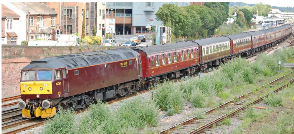
47760 t&t 37706 Eastleigh, 9 th July 2015 (Chris Addoo) .....if the buddleia gets any higher without being dealt with this shot is going to be ruined !!