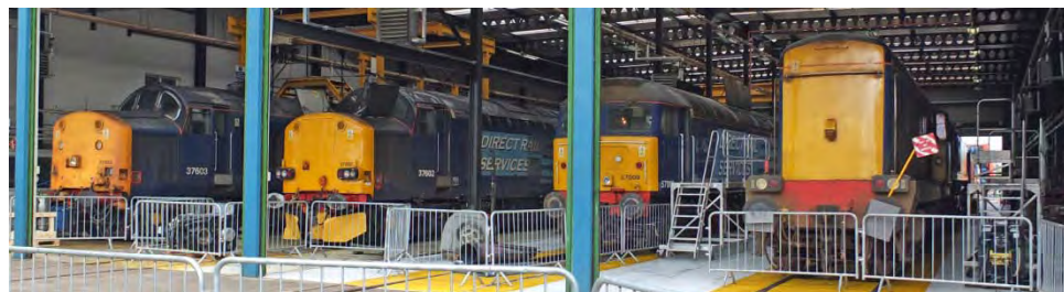
south end of depot: 37603, 37602, 57009 & 20304

One of highlights however of the event was the unveiling of 47712 in ScotRail Intercity livery alongside 37401, now mainline certified and back in the DRS stable of operational CI.37s and DBSO 9705 now in DRS livery. In the morning 37401 briefly sported Highland stag motifs on the cabside before they were taken off. I wonder how many realised the significance of these three together. I certainly saw them all together back when they all operated in Scotland in 1988. Checking my notes I had a trip for work by rail to Scotland at the end of October / start of November 1988 when I recorded 47712 and 9705 on the 31 st and the 1 st with 37401 seen on the 2 nd all at Glasgow Queen Street. I also saw 9707 at Edinburgh Waverley on the way home on the 2 nd . Sadly I never took photos back then. Though it was the 47s that t&t with DBSOs it will be 37401 now on Cumbrian coast services.