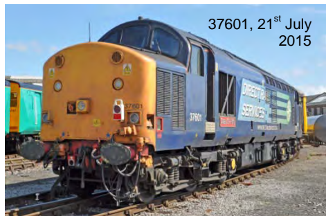
37601, 21 st July 2015

73136/73141 stabled with a Test Train for several days from the 21 st . 37219, the first Colas 37 to visit the Works, stabled with UTU3 Test Train on the 23 rd , having replaced 37601.