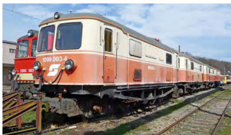
above stored 1099 003 heads a line of classmates with doyen 1099 001 behind right , Alpenbahnhof, 11 th April 2013

We then continued onto St Polton which is mainly units now, a change from the good old days! Also in St Polton is the depot for the narrow gauge at Alpenbahnhof. This is for the line to Mariazell where there is a large tram museum. This line was worked by 100 year old Cl.1099 electric locomotives and 50 year old Cl.2095 diesels (built 1962). Units are going to take over from these quite soon.