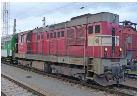
742 276 stands at the head of empty stock, Ceske Budejovice, 11 th April 2013