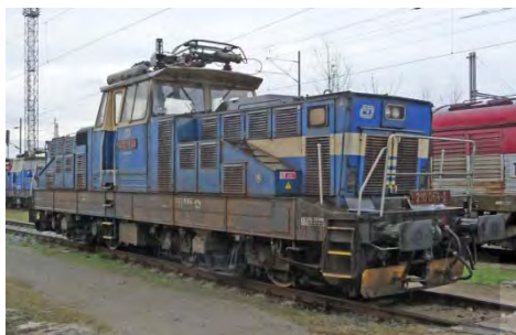
210 059 Ceske Budejovice Depot, 11 th April 2013