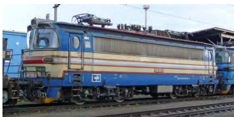
340 055, Ceske Budejovice Depot, 11 th April 2013