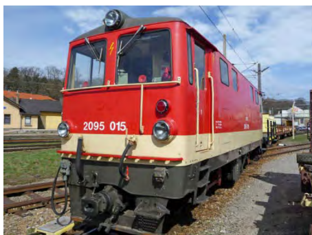
Cl.2095 015 stands at the head of a rake of departmental wagons Alpenbahnhof, 11 th April 2013

Continuing to Etsdorf Straß to the NÖVOG Depot and workshop, where there was a man in the Depot, we asked permission...he nodded. There were 2 ex ÖBB class 2043s a class 2062 shunter and a class 2067 shunter. Down the yard was a preserved class 2045. We went into the works area where