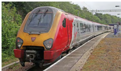
221101 + 221108 King's Park 10.58

Over the weekend of the 11th & 12 th July Virgin Pendolinos & Voyagers were diverted in the outskirts of Glasgow via Mount Florida on the Cathcart Circle line, through Iain Gardiners local station at Burnside, heading for Newton and re joining the WCML. This was due to a bridge replacement at Newton. All the local services that would have gone through Cambuslang were diverted including EMU Cls.318, 320 & 380.