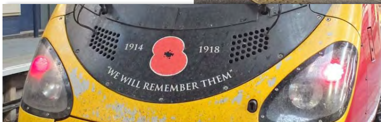
above 69203 left 69103