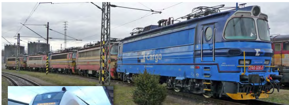
above 240 026 heads a line of classmates, Ceske Budejovice Depot, 11 th April 2013