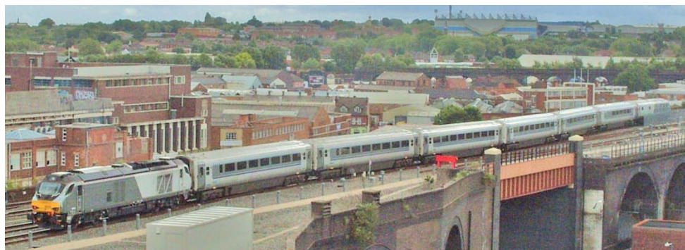
68010 departing B'ham Moor Street on the rear of the 12.55 to Marylebone, 7 th July 2015 (James Holloway)