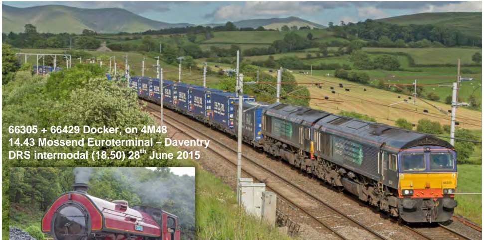
66305 + 66429 Docker, on 4M48 14.43 Mossend Euroterminal – Daventry DRS intermodal (18.50) 28 th June 2015