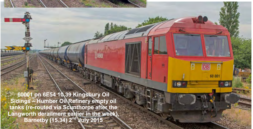
60001 on 6E54 10.39 Kingsbury Oil Sidings – Humber Oil Refinery empty oil tanks (re-routed via Scunthorpe after the Langworth derailment earlier in the week), Barnetby (15.34) 2 nd July 2015

I then headed east and for home via the S&C over to the Barnetby area, hoping to catch some freight. It's a shame there are now so few coal trains running. The Barnetby area was very quiet, just the iron ore and oil tanks running.