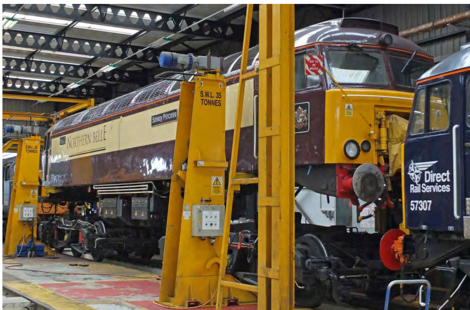
above 57312 jacked up off its bogies

Another interesting little fact is that the two Cl.47s present were previously operated by Cotswold Rail prior to a new life with DRS.