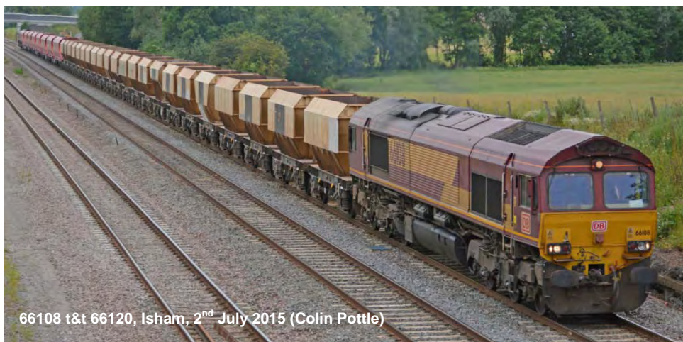
66108 t&t 66120, Isham, 2 nd July 2015 (Colin Pottle)