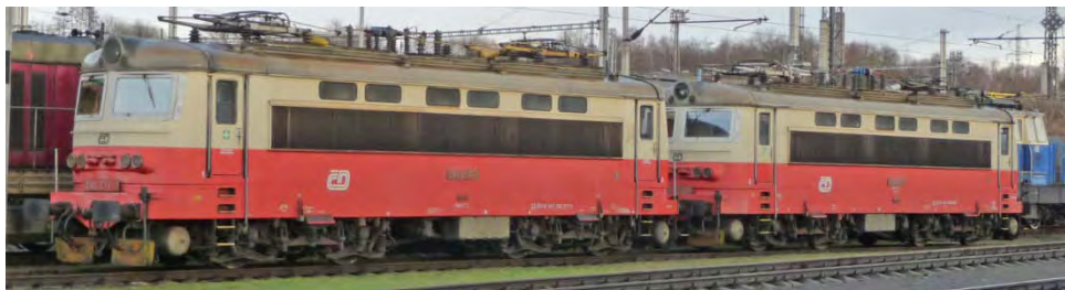
242 277 & 242 259, Ceske Budejovice Depot, 11 th April 2013