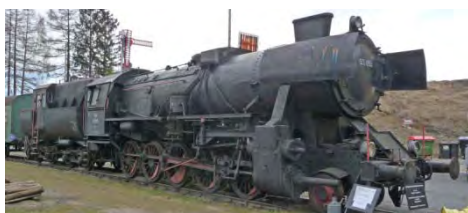
2-10-0 52 855 Sigmundsherberg museum, 11 th April 2013

Out of Austria again and into the Czech Republic. The first small town we came to was Ceska Velenice where 2 locomotives were stabled adjacent to the station. Then on to Jindrichuv Hradec, This depot only had 4 diesel, 1 shunter and 1 steam on. Three of these still carried their original numbers!