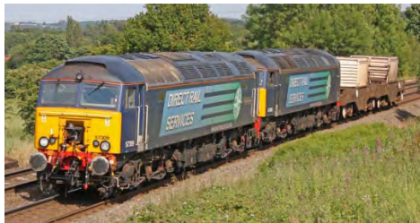
47760 t&t 37706 on 1Z67 London Victoria - Weymouth Cathedrals Express was seen passing through Eastleigh at 11.35.