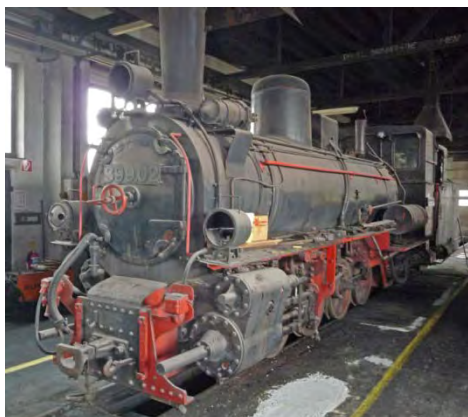
right shut inside Gmund shed was 0-8+4 399 02, 399 04 was also there, 11 th April 2013

Next was the museum at Sigmundsherberg. A selection of steam, diesel, electric and departmental items were seen. The last Austrian depot was Gmund. Two ÖBB locomotives were stabled in the yard and in the narrow gauge shed there were two of the three allocated 0-8+4 steam tanks and one of the two B-B class 2095s.