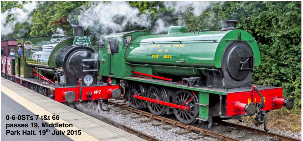
0-6-0STs 7 t&t 66 passes 19, Middleton Park Halt. 19 th July 2015

The close geographical proximity of the Middleton Railway to the Hunslet Engine Company and the fact that it currently operates a number of Hunslet built locomotives was the catalyst for holding the gala there. In operation throughout the Gala, although I was only able to attend on the Sunday, were the following Locos, all Hunslet built.