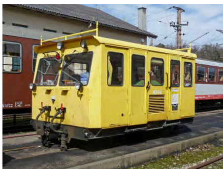
narrow gauge staff transporter X625 902 can haul 2 or 3 lightweight trailers Alpenbahnhof, 11 th April 2013