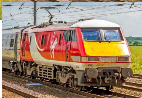
left 91108 with new full width white roof, Beningborough 5 th July 2015 (Mike Brook)