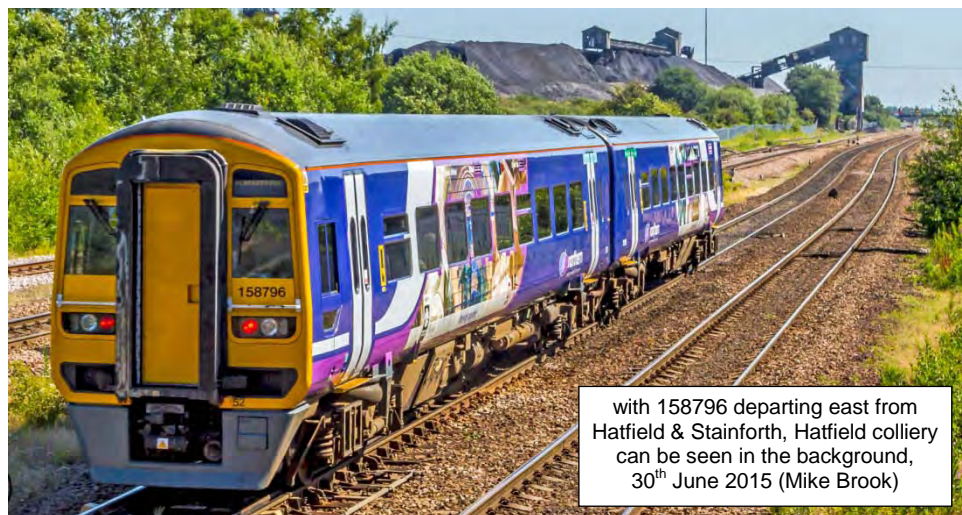
with 158796 departing east from Hatfield & Stainforth, Hatfield colliery can be seen in the background, 30 th June 2015 (Mike Brook)

Hatfield Colliery, the scene of the 2013 major landslide closed suddenly at the end of June. The last two deep mines at Thoresby and Kellingley are also likely to close indicating the market slump for coal.