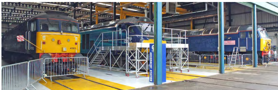
north end of depot: above inside 47813, 68003 & 57307 (showing part finished vinyls) below outside 37606, 47828 & 66302, which demonstrated the washer