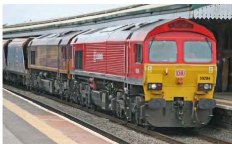
59204 + 66186

the latter used to provide buckeye coupling