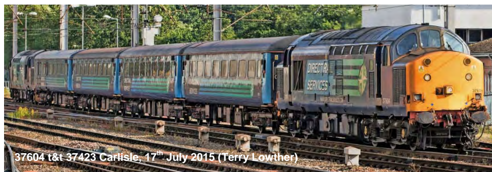
37604 t&t 37423 Carlisle, 17 th July 2015