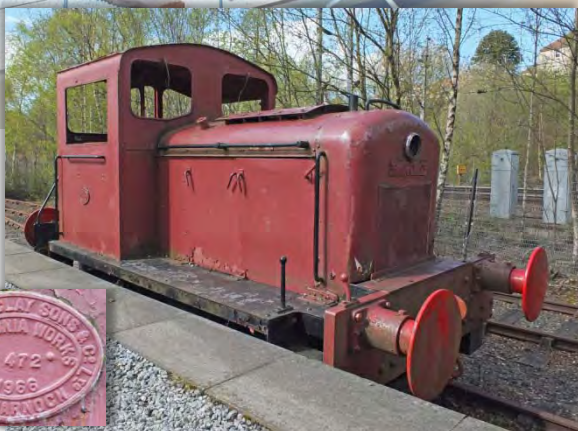
above Barclay (built 1956) 5 [472] 0-4-0DH

note the adjacent Glasgow to Airdrie mainline behind