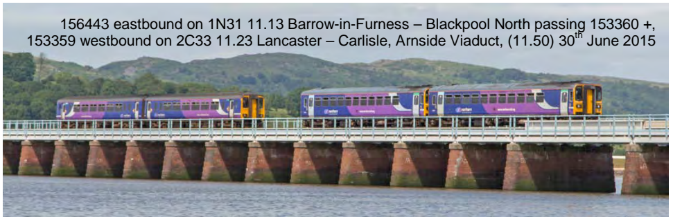
156443 eastbound on 1N31 11.13 Barrow-in-Furness – Blackpool North passing 153360 +, 153359 westbound on 2C33 11.23 Lancaster – Carlisle, Arnside Viaduct, (11.50) 30 th June 2015

I made a 5 day trip to take in some DRS action on the Cumbrian coast and the WCML. An extra early morning stop made was to visit to the Lakeside & Haverthwaite Railway (LHR) for breakfast which is fully recommended, watching the railway come alive before the services started Unfortunately I didn't have time to travel on the railway. I saw several DRS nuclear flask trains and the Cumbrian coast CI.37 services.