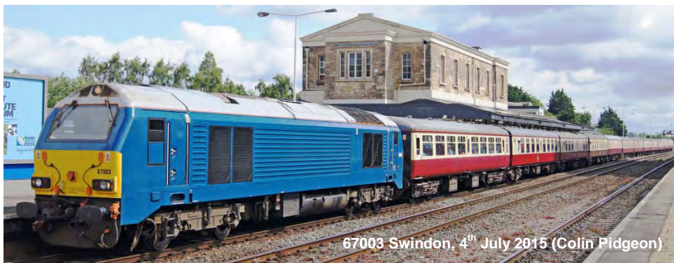
67003 Swindon, 4 th July 2015

The main tour of the month was the GBRF stock transfer move from Ipswich to Eastleigh following the previous days staff Away day from Ipswich to Scarborough. The Sunday trip with headboard 'The Second Serve' was Ipswich to Eastleigh via Walton on the Naze, Harwich, Norwich, Peterborough and Wembley.