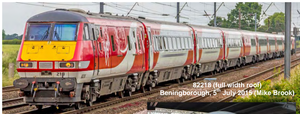
82218 (full width roof) Beningborough, 5 th July 2015 (Mike Brook)