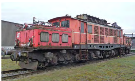
according to the records there are 12 class 1020s preserved. 1020 005 here is not on the list ! Amstettin, 11 th April 2013

We continued our tour and visited Amstettin, half OBB and half preserved.