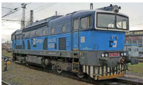
above right 753 771 a Cl.753 7xx rebuilt from Cl.750s, 752s and early 753s by CD Cargo Ceske Budejovice Depot, 11 th April 2013