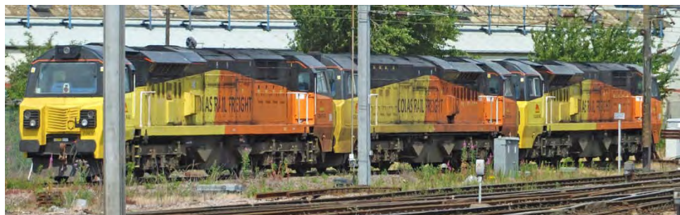
70810 + 70802 + 70804 stabled north of Doncaster station, 11 th July 2015