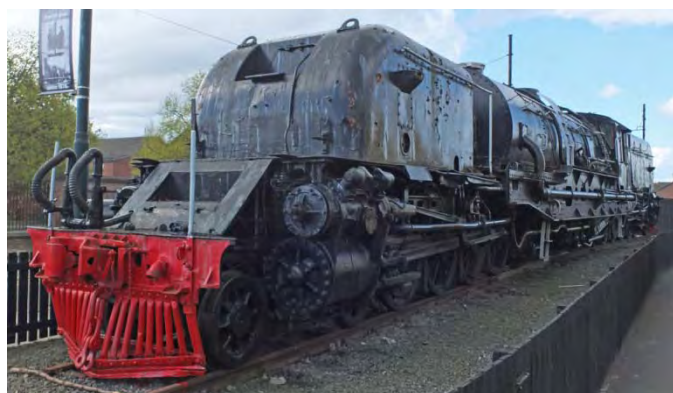
left 3'-6" gauge NBL Beyer Garrett (built 1956) 4112 [7827] 4-8-2+2-8-4 alongside the tram track and Heritage Way to the left