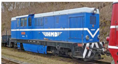
T48 001 Jindrichuv Hradec Depot, 11 th April 2013