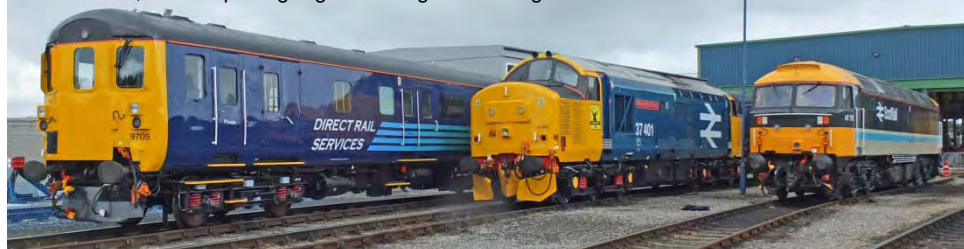
DBSO 9705, 37401 sporting Highland Stag cabside logo & 47712

Wagons: (3) PFA 92721/33/84 Snowploughs: ADB 965230 with 965224 just south of depot