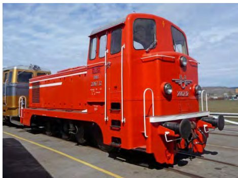
immaculate CI.2067 (0)12 is seen in the yard, NÖVOG Depot, 11 th April 2013

some railcars were being renovated and we were told to get out. It appears the man we asked had nothing to do with the Depot and had since disappeared!