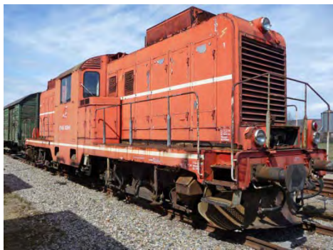
nice to see a preserved CI.2045, 2045 009, NÖVOG Depot, 11 th April 2013