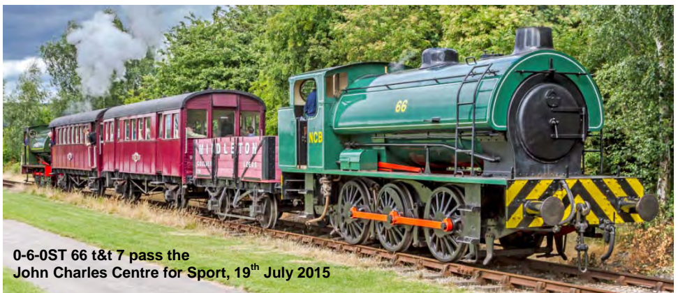
0-6-0ST 66 t&t 7 pass the John Charles Centre for Sport, 19 th July 2015

Steam: Austerity 0-6-0ST 7 [2705] ' Beatrice ' – also numbered S119, built in 1945 and actually celebrating her 70 th birthday on this day, initially worked at Ackton Hall Colliery at Featherstone, where she was named after the colliery manager's daughter. ' Beatrice ' now works regularly on the Embsay & Bolton Abbey Steam Railway.