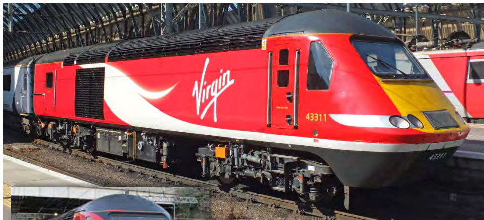
new VTEC liveries on CI.43 HST power cars above 43311 one of the first two to be treated King's Cross, 10 th July 2015

This section will endeavour to show all new liveries / variations or those existing ones where not carried on the stock before. Liveries that become 'extinct' will also be covered. As with names, it may take a while after the livery application before a photo is sourced from members. New liveries may also be shown in other articles. See 59003 & 66707 in EASTLEIGH WORKS REPORT and 43317 in TRAFFIC & TRACTION NEWS .