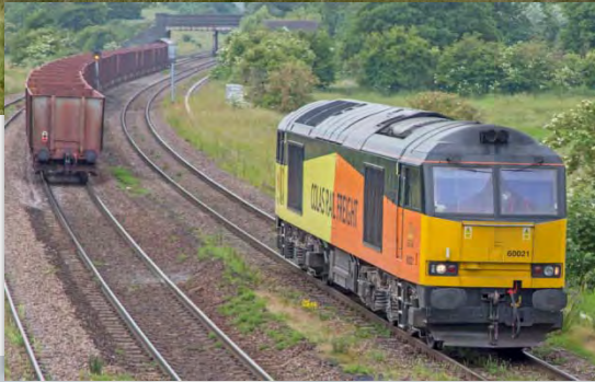
left 60021 on 0Z60 11.52 Doncaster CHS – Immingham Transit Quay light engine move with 66148 passing on 6T24 11.38 Immingham BSC Ore Terminal – Santon FOT loaded iron ore, New Barnetby (12.08) 2 nd July 2015