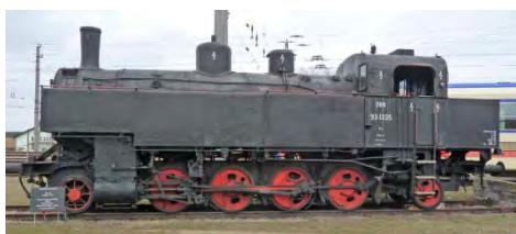
2-8-2T 93 1335 Sigmundsherberg museum, 11 th April 2013

Next was the museum at Sigmundsherberg. A selection of steam, diesel, electric and departmental items were seen. The last Austrian depot was Gmund. Two ÖBB locomotives were stabled in the yard and in the narrow gauge shed there were two of the three allocated 0-8+4 steam tanks and one of the two B-B class 2095s.