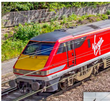
below left 91129 with narrow black roof, York, 29 th June 2015 (Mike Brook) then below right with narrow white roof King's Cross, 10 th July 2015