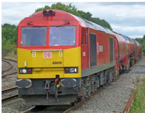
37607 + 37612 passed Fen Lots Drove, Eastrea on Pathfinder charter from Bristol Parkway - Dereham at 10.56.