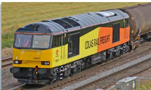
above 60047 the eighth Colas CI.60 to be treated, Harrowden Jct, 10 th July 2015 (Colin Pottle)