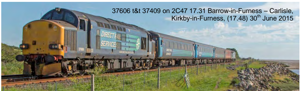
37606 t&t 37409 on 2C47 17.31 Barrow-in-Furness – Carlisle, Kirkby-in-Furness, (17.48) 30 th June 2015