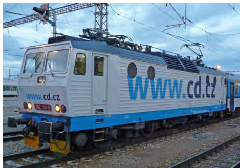
362110 arriving with empty stock in the centre road, Ceske Budejovice, 11 th April 2013