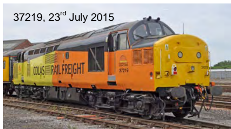
37219, 23 rd July 2015