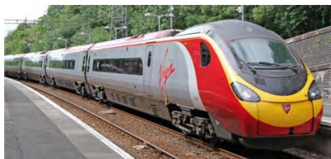
390044 Kirkhill 13.40