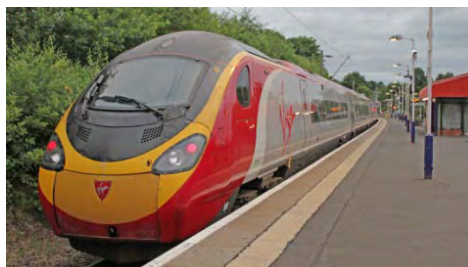
390135 Burnside 20.07