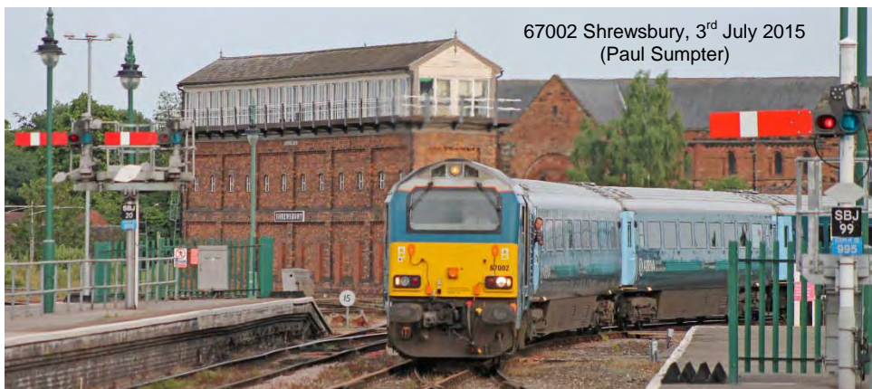
67002 Shrewsbury, 3 rd July 2015 (Paul Sumpter)