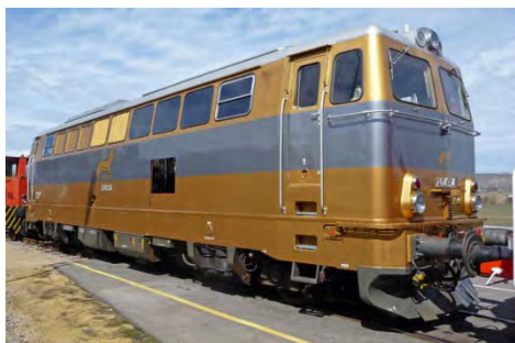
looking excellent in "Wiesel" livery 2043 (0)24, also on shed was 2043 015 NÖVOG depot, 11 th April 2013