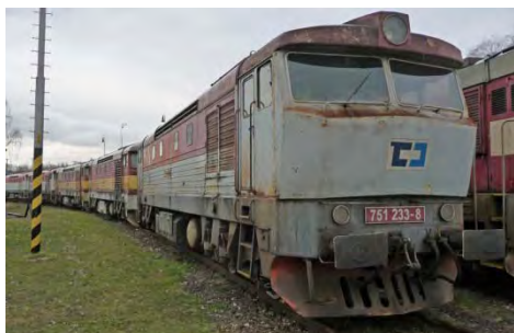
751 233, Ceske Budejovice Depot, 11 th April 2013

The main and last depot of the day was Ceske Budejovice. We greeted the chief with "Dobry Den" then handed a card that said Dobry Den, Jsme Anglican. Prosim, Chceme navstivit vas depo aby videt a fotografovat vas lokomotivy dekuji. That did the trick. 137 on shed, most outside and it was chucking it down!